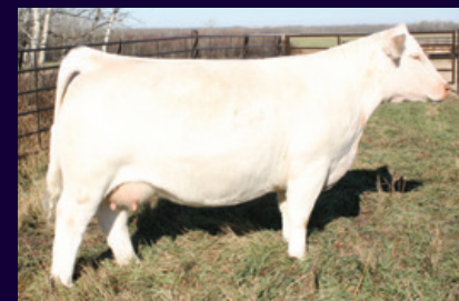
STARSTRUCK 409B MANY DESCENDANTS AVAILABLE