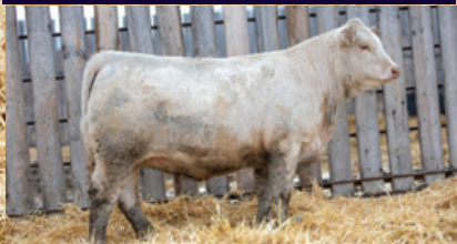
DAUGHTER OF 314H, FULL SISTER TO EMBRYOS