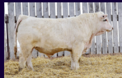
HIGH ROAD SIRE OF HEIFERS