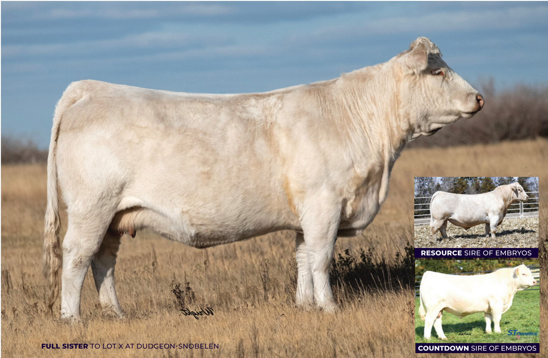
FULL SISTER TO LOT X AT DUDGEON-SNOBELEN