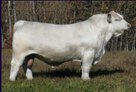
RUGER FULL BROTHER TO MISS CRUSH