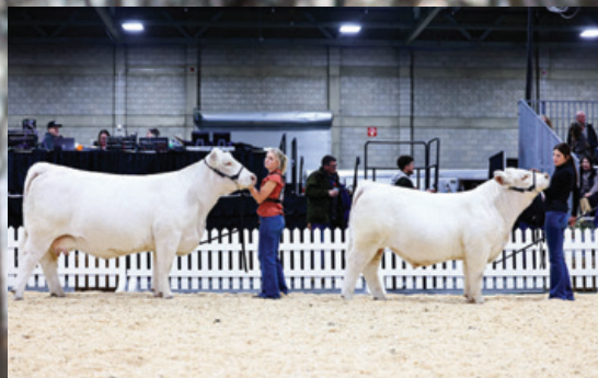
ZEUS AND DAM SERVICES