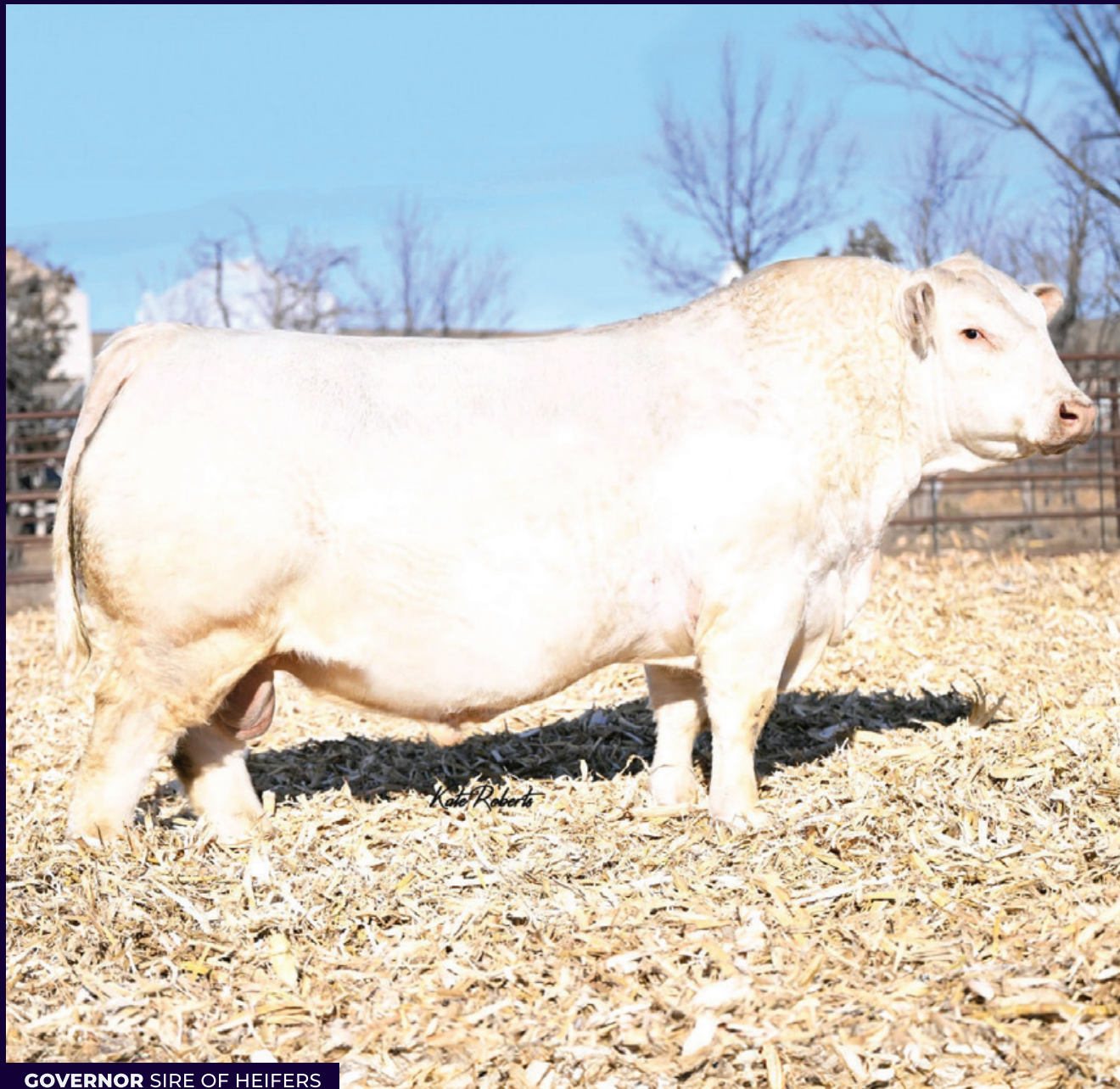
GOVERNOR SIRE OF HEIFERS