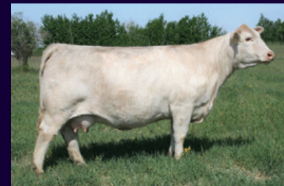
D&D COVERGIRL DAUGHTER AVAILABLE