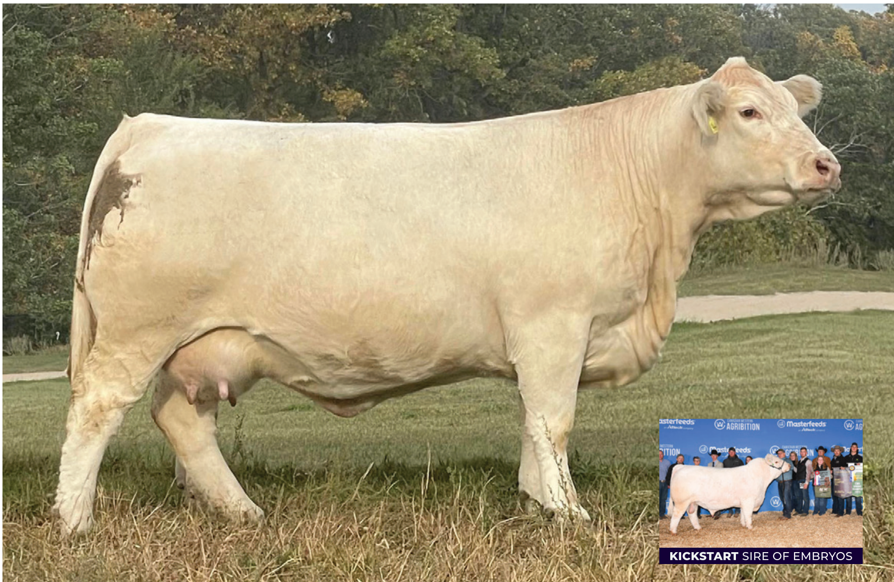
KICKSTART SIRE OF EMBRYOS