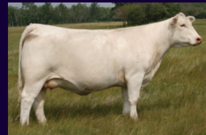
STARSTRUCK 135J DAUGHTER AVAILABLE