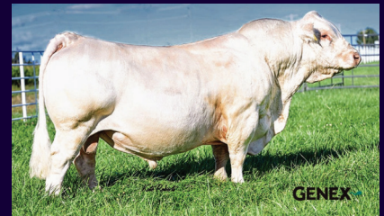
LUNCH MONEY SIRE OF HEIFERS