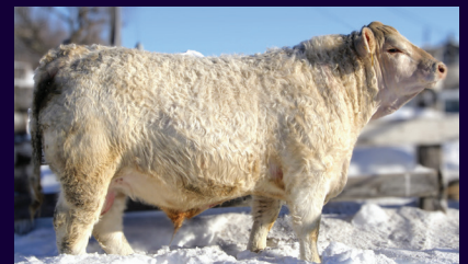
TRANSPORT SIRE OF HEIFERS