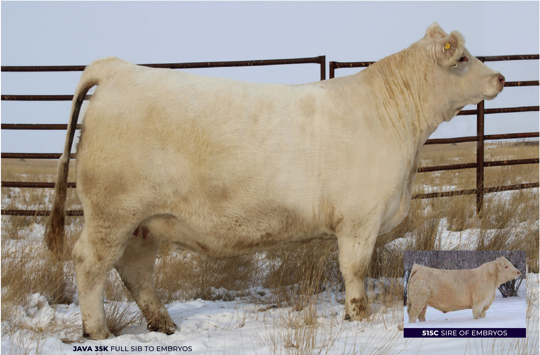
JAVA 35K FULL SIB TO EMBRYOS