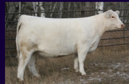
COVERGIRL CWA CHAMP, MA- TERNAL SISTER AVAILABLE