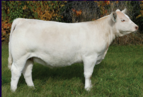
MISS CRUSH DAM OF EMBRYOS