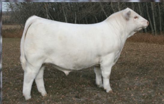
PROFOUND PROGENY AND SERVICES