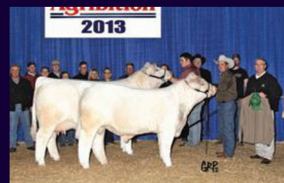
WOOD RIVER PRINCESS 13Y