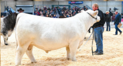
BOURBON SIRE OF EMBRYOS