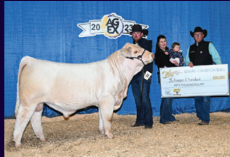
LIMITLESS PLAYER'S CLUB CHAMP