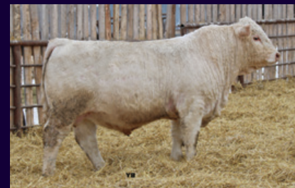
HEATWAVE 7H SIRE OF HEIFERS