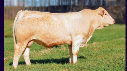
JERICO SIRE OF HEIFERS