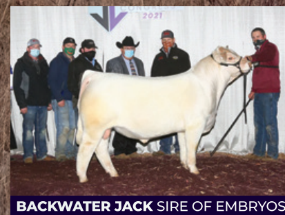
BACKWATER JACK SIRE OF EMBRYOS