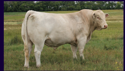
J BAR W TOP SIRE OF HEIFERS