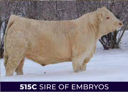
515C SIRE OF EMBRYOS