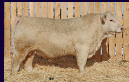
COMPADRE 13H SIRE OF HEIFERS