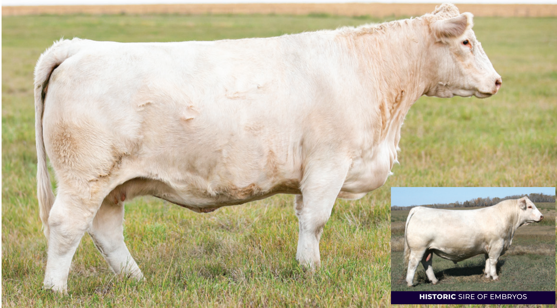
HISTORIC SIRE OF EMBRYOS