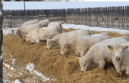
A SAMPLE OF HEIFERS ON OFFER