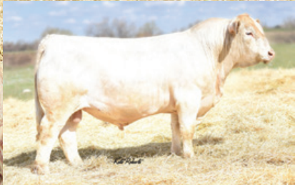
RANSOM SIRE OF EMBRYOS