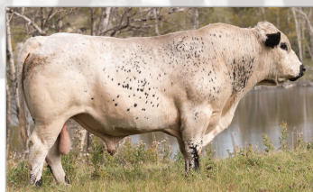
SIRE: INC GOLIATH 747G