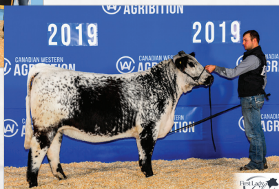
DAM: INC NORTHERN LEGEND 67F