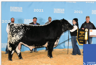
SIRE: COLGAN'S GENERAL 20G

Polled: PP Coat Colour: E P /E Myostatin: Non-Carrier