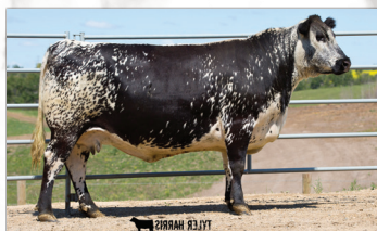
DAM: STAR BANK WITCHES BREW 16W