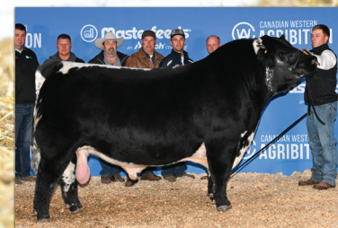
DAM: PINE VALLEY ANNA 4C