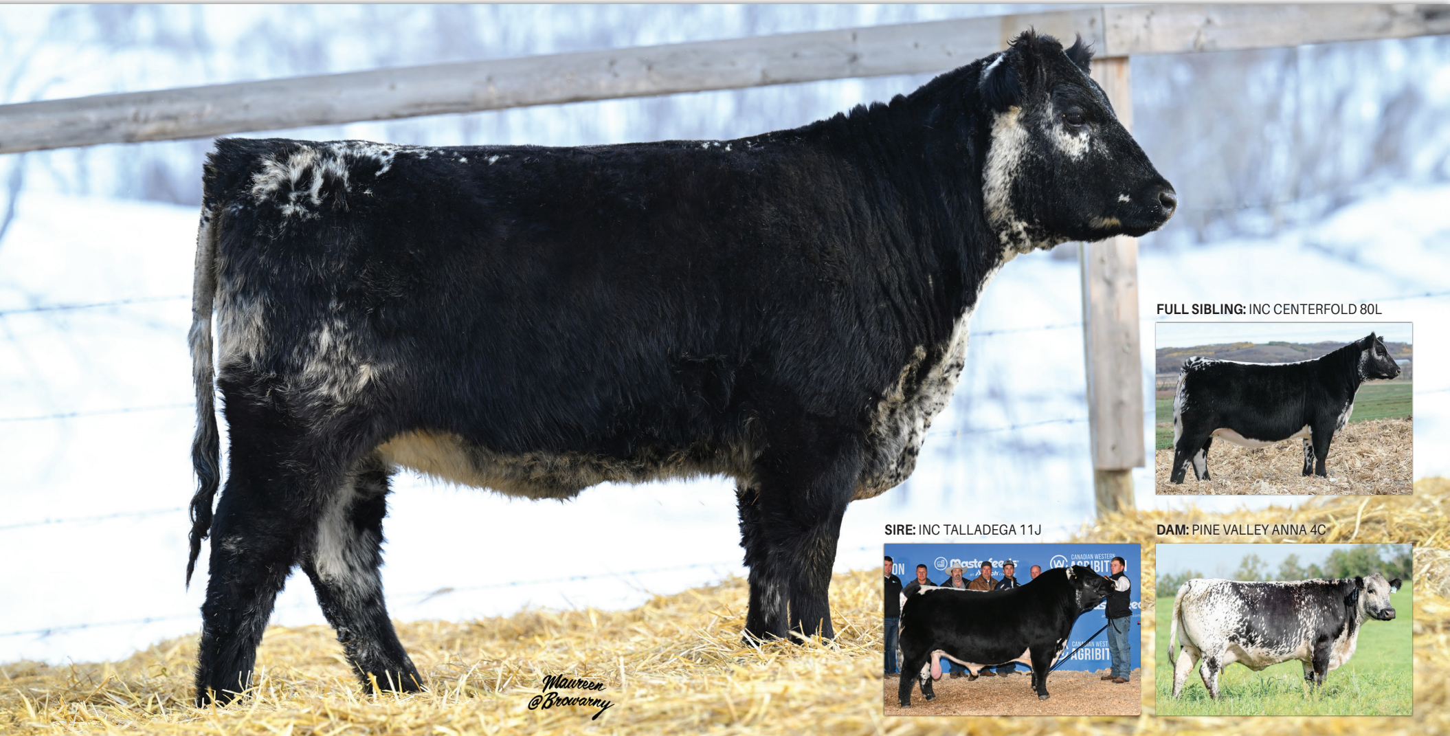
FULL SIBLING: INC CENTERFOLD 80L