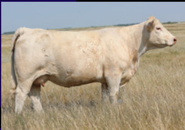
HTA DELIGHT 959G Dam

MC866777 HTA 3100L 1/20/2023 HOMO POLLED EPDS BW -1.7 WW 64 YW 108 MM 20 MTL 52 HTA ASTROID 603D HTA RELIABLE 4101B HTA SPIDERMAN 9103G HTA DELIGHT 959G HTA HOT STUFF 484B HTA DELIGHT 402B BW 97 LBS BW % OF DAM 5.6% AOD 4 ADJ 205 839 ADJ 365 1548 ADG 4.43 100K TESTED