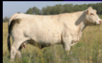
HTA DELIGHT 487B Dam

BW 120 LBS BW % OF DAM 7.3% AOD 9 ADJ 205 805 ADJ 365 1656 ADG 5.32