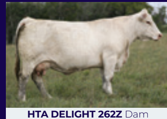
HTA DELIGHT 262Z Dam

BW 117 LBS BW % OF DAM 7.1% AOD 11 ADJ 205 861 ADJ 365 1469 ADG 3.8