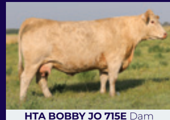
HTA BOBBY JO 715E Dam