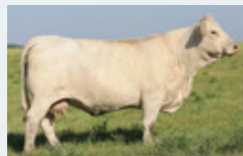
HTA BOBBY JO 567C Dam

BW 105 LBS BW % OF DAM 5.7% AOD 8 ADJ 205 652 ADJ 365 1476 ADG 5.15 100K TESTED