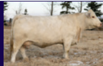
HTA GLITTER 541C Dam

BW 101 LBS BW % OF DAM 5.3% AOD 8 ADJ 205 747 ADJ 365 1388 ADG 4.01