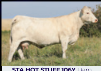
STA HOT STUFF 106Y Dam