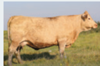
HTA BOBBY JO 5114C Dam

MC866844 HTA 3149L 2/22/2023 HETERO POLLED EPDS BW 4.1 WW 69 YW 130 MM 30 MTL 63 WINN MANS LANZA 610S RGP REMINGTON 101Y SHSH HIGH CLASS 43D HTA BOBBY JO 5114C SHSH MADONNA 21U HTA BOBBY JO 655S BW 102 LBS BW % OF DAM 5.7% AOD 8 ADJ 205 824 ADJ 365 1521 ADG 4.36 100K TESTED