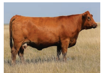
DAM HTA Classy Lady 835F