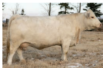
Granddam HTA Glitter 541C