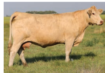
DAM HTA Kiwi 748E