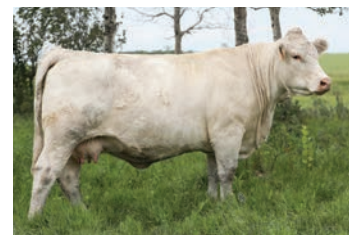
DAM HTA Sonja 823F