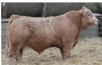
Sire HTA Game Changer 9141G