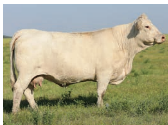
MATERNAL GRANDDAM HTA Bobby Jo 567C