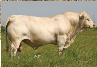
Grandsire RPG Remington 101Y