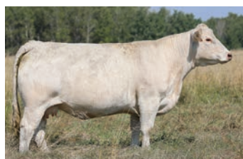
Dam HTA Glitter 8117F