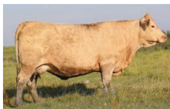
Dam HTA Bobby Jo 5114C