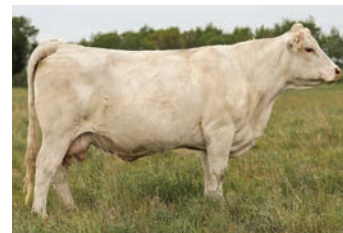
DAM HTA Glitter 434B

HTA BRAVIA 855U HTA BRIDGET 704T C2 ZEPLIN 45Z STA HOT STUFF 106Y MERIT 8789U RGP LUCILLE 101L MERIT 5323R HTA GLITTER 502R