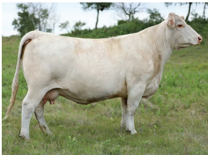
DAM HTA Hot Stuff 484B