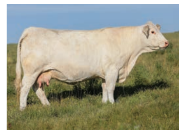
DAM HTA Sara 795E