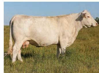
DAM HTA Sonia 6112D