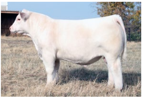
SVY TRUST 6H