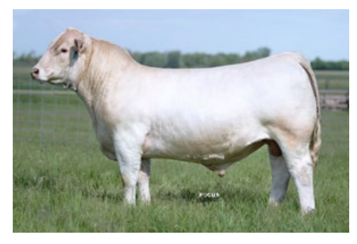
WCR BOLD MOVE 168P