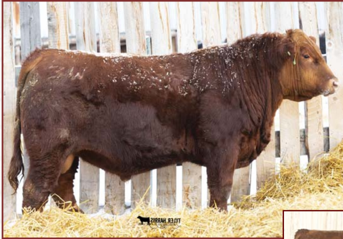
RED WARD'S HITCH 838F