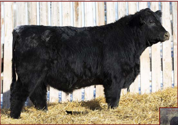
WARD'S PR GIBSON 23G

SANKEYS LAZER 609 OF 6N SANKEYS ERICA 525 SA V HARVESTOR 0338 JUSTAMERE 0405 CHARISE 361N G D A R ROGUE 640 KBJ QUEEN 69X DWAJO IMAGE MAKER 21R FRL ATALANTA 626S