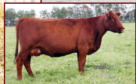
RED PASQUIA FAYET 70U DAM OF LOT 67G