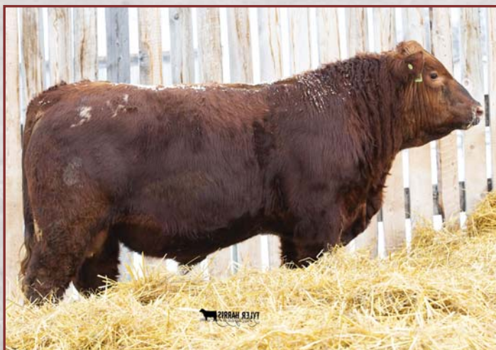
RED WARD'S FUSION 809F