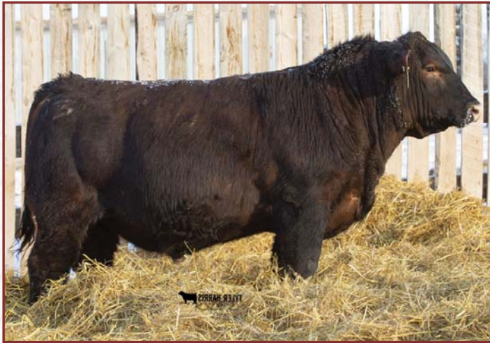
RED WARD'S PR HITCH 811F