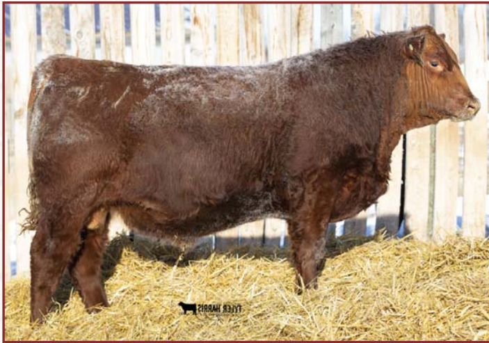
RED WARD'S REVOLVE 37G