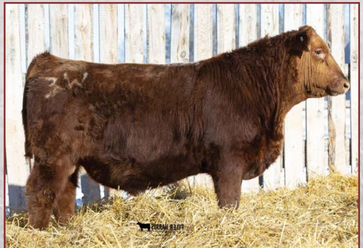
RED WARD'S MULBERRY 17G