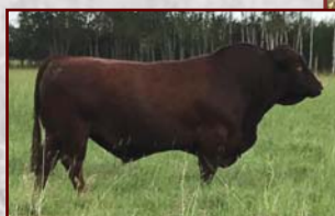
RED WARD'S COMBAT 515C ON PASTURE, BREEDING SUMMER OF 2019