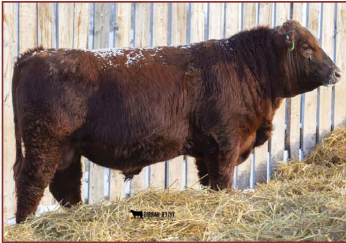
RED WARD'S PR FUSION 827F