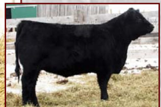
DBRL 03M LUCY 14X GREAT GRANDDAM OF LOT 14G