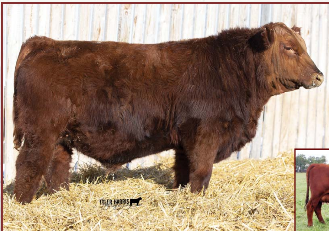
RED WARD'S GARTH 67G

RED CLAY BANDIT 18X RED SVR CHRISTINA 12Y RED T-K BAILOUT 1Z SVR MISS LARK 249X RED U-2 ICON 223M RED LETTER LASSIE 75D RED GEIS ZAMA PINE 190'97 RED PASQUIA FAYET 6C