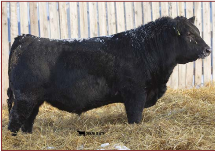
WARD'S INITIATIVE 832F