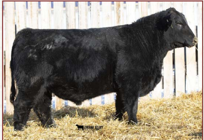
WARD'S ALASKA 74G