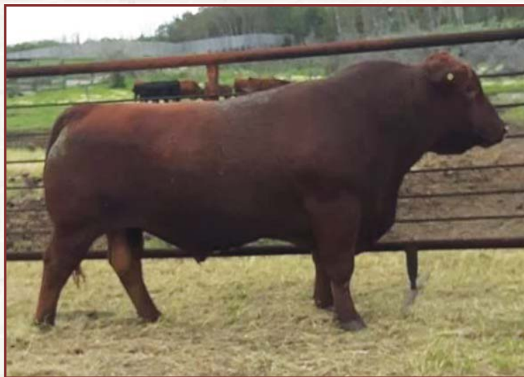
RED SVR HITCH 23D

Hitch continues to turn heads with his natural thickness and muscle pattern! We had him displayed at the Saskatchewan Angus Summer Tour (after he had bred females through out the summer) and he was our display bull at Agribition this year (then he went home to breed fall cows)! We expect a lot of him and he doesn't miss a beat! His bull calves carry his same muscle pattern and easy doing ability and their average BW is 84 lbs. If you want muscle and thickness, check out these sons!