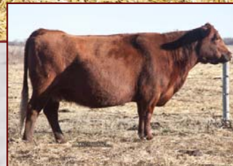
RED WARD'S FREYJA MIST 37W GRANDDAM OF LOT 36G

RED BIEBER ROLLIN DEEP Y118 RED TR COUNTESS 731X RED HOWE BOLD FUTURE 86T RED LETTER BLACKBIRD 76N HOWE MAVERICK 6W RED HOWE MS ENVIOUS 34W RED TER-RON TRACKER 29T RED WARD'S FREYJA 56N