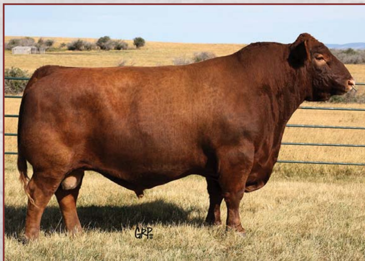
RED FINE LINE MULBERRY 26P

What do you say about a bull that is 16 years old and is still used heavily in the Red Angus breed? Consistency, longevity, thickness, capacity come to mind, all valuable traits that we strive for. We used a semen package this year, kind of hoping for some females! But instead we have some stand out bull calves for our repeat customers!! Retro genetics that will benefit anyone's program!