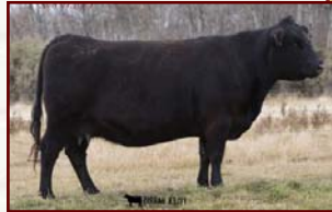
WARD'S C EVA 64Z DAM OF LOT 53G