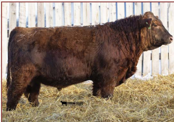
RED WARD'S FUSED 850F