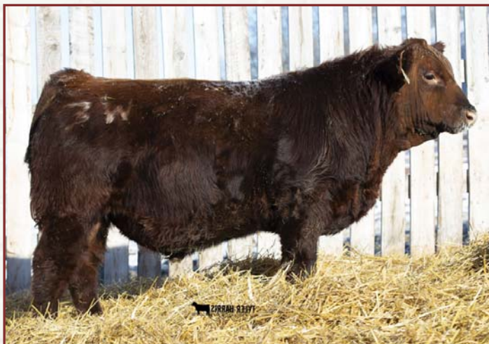
RED WARD'S GASKET 48G