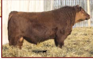
RED WARD'S SIGNATURE 716E MATERNAL BROTHER OF LOT 838F