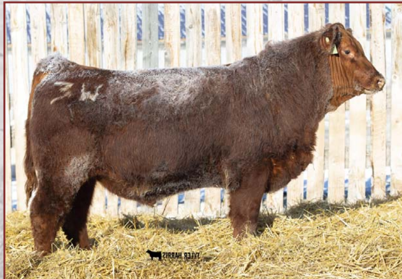
RED WARD'S GARDA 24G

RED HR RAMBO ET 91K RED BRYLOR MISS ROC 20H RED SILVEIRAS REDFORD RED MC DOUGALL FAYETTE 59A RED TER-RON REALDEAL 01W C. WARD'S ERICA 97N RED GOLD-BAR STATUE KN 126S RED LETTER COUNTESS 8M