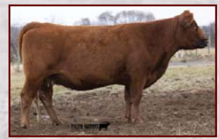
RED WARD'S COUNTESS 39C DAM OF LOT 24G