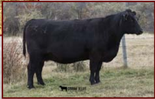
WARD'S PR COUNTESS 46A DAM OF LOT 47G

SA V WALL STREET 7091 PHP PATTY 86U RED HANDFORD DYNAMITE 136L CCL ERICA 2'00 HF HEMI 176W EGGEN BIG SKY MISS 61N HF FREE WHEELER 193T WILLABAR COUNTESS 116N