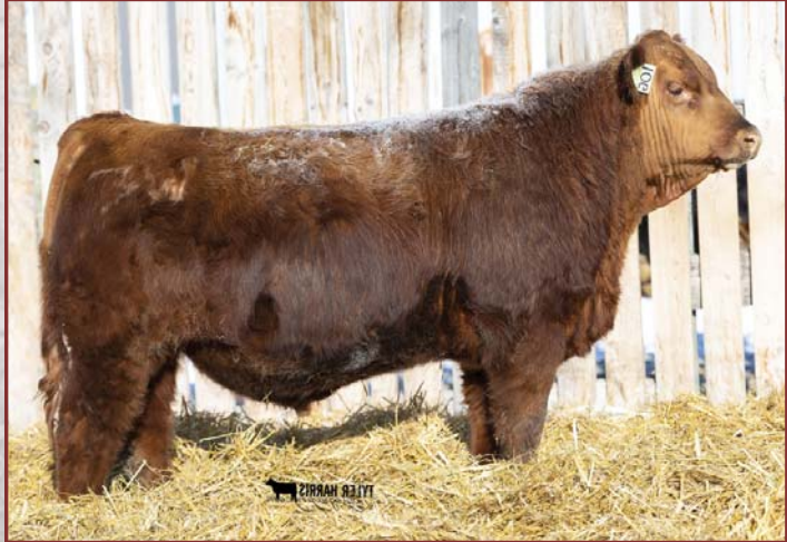
RED WARD'S PR MULBERRY 10G