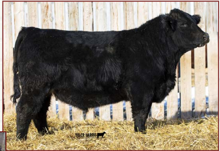
WARD'S C COMMANDANT 53G