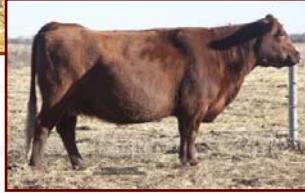
RED WARD'S FREYJA MIST 37W DAM OF LOT 82G