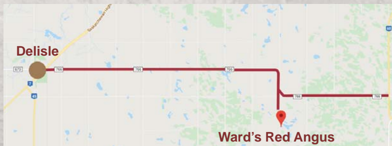
Ward's Red Angus

Take 766 Highway East towards Pike Lake Provincial Park Go 10½ miles on 766. The road will curve south, continue south onto gravel (3073) and follow the Ward's Red Angus signs.