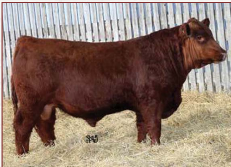
RED LWNBRG FUSION 69D

Outcross genetics here! He was purchased in 2017 from Leeuwenburgh Angus. His Peacemaker dam (70B) is one of their favorite young cows and Red Andras Fusion R236 has been a go to calving ease sire in their herd. As a group, the Fusion sons were consistent, stout, deep and easy fleshing. He combines calving ease with a little more frame. This year the fall calving group is largely sired by 69D. The added frame from the Fusion breeding combined with the added age of the fall bulls makes this an impressive group.