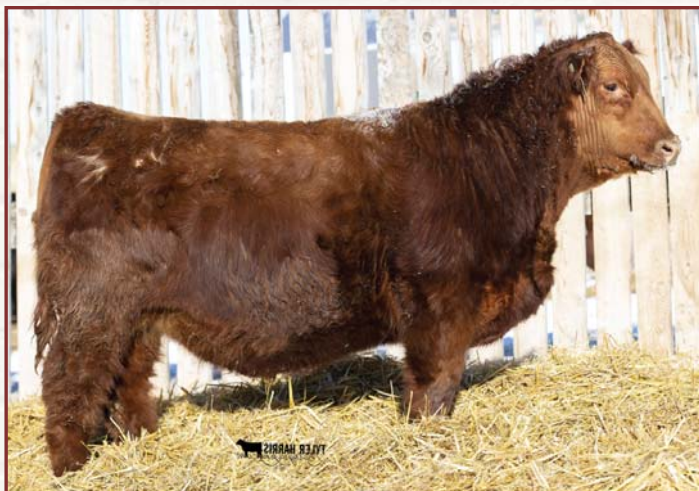
RED WARD'S REVOLVER 43G