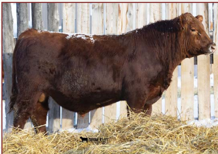
RED WARD'S JW FUSION 804F