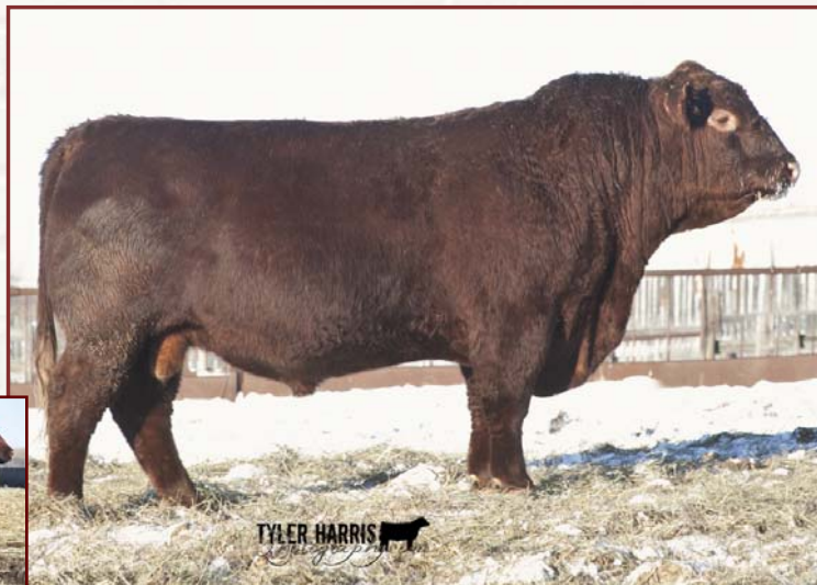
RED TR ROLLING ALONG 79B SIRE