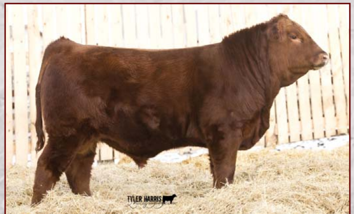
RED WARD'S JW HITCHHIKER 66F BROTHER OF LOT 39G AND HIGH SELLING BULL IN 2019 TO JIM KOHUT