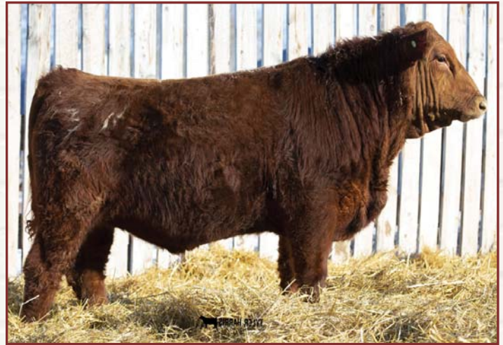
RED WARD'S GARNET 25G

RED CLAY BANDIT 18X RED SVR CHRISTINA 12Y RED T-K BAILOUT 1Z SVR MISS LARK 249X RED PATRIOT 629 RED FLYING K MS DYNAMO 156N RED WARD'S HOBO 2K RED LETTER BLACKBIRD 42H