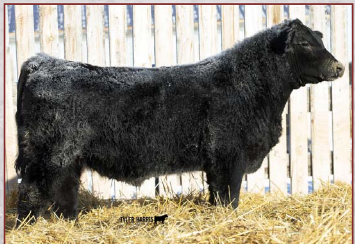
WARD'S ALASKIN 77G