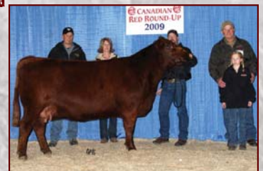
RED WARD'S FREYJA 56N GREAT GRANDDAM OF LOT 36G

WARD'S RED ANGUS YEARLINGS... FEATURE BULL