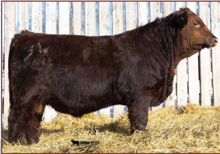
RED WARD'S GENESIS 96G