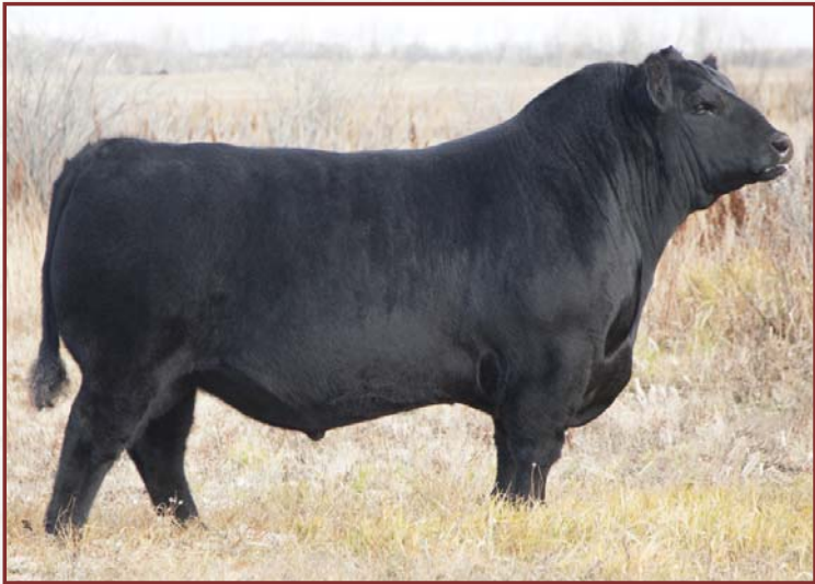
HLC 101 CROSS FIRE 569C

Alaska 264E came to us sight unseen. BW of 86 lbs., WW of 960 lbs., YW of 1490 lbs. and Scrotal of 43 cm. He has definitely lived up to the numbers! We have always admired the HF Alaskan 94T breeding for its functionality and longevity. He has been a great fit with our Black herd and we are excited to see this young herd bull's influence in our herd down the road.