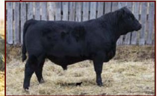
WARD'S PR GUNFIRE 12G OCTOBER 2019