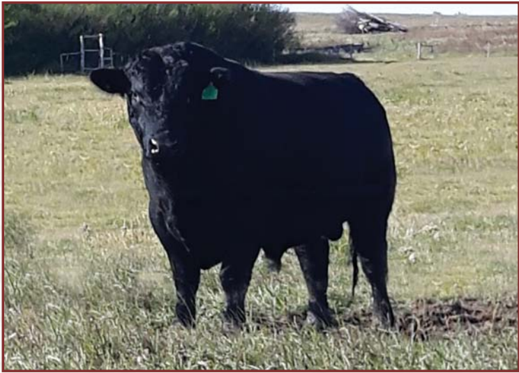
FOUR BAR X ALASKA 264E