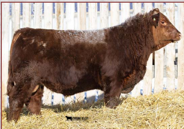
RED WARD'S C RED ROLL 97G