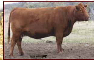
RED WARD'S COUNTESS 49Z DAM OF LOT 13G