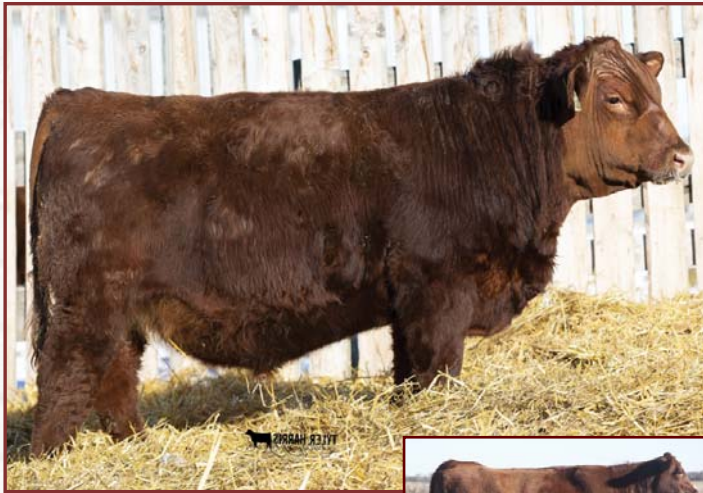
RED WARD'S GAUGE 82G