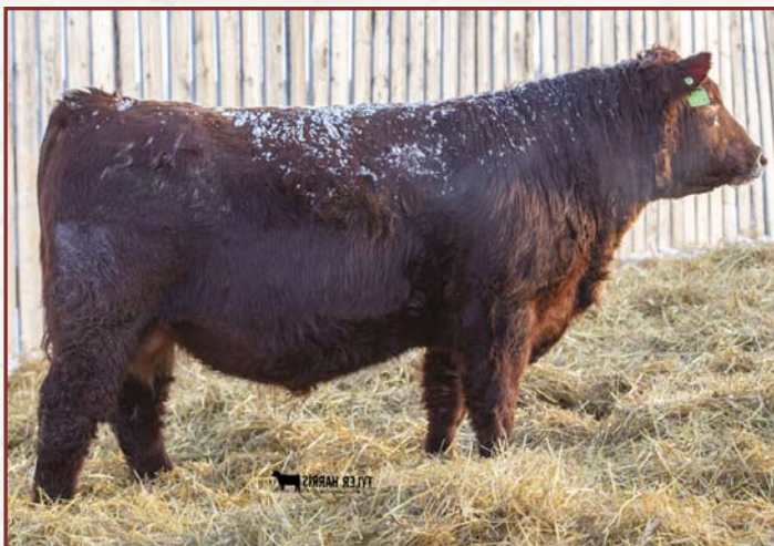
RED WARD'S FUSION 833F

• Dark red, light boned, easy calving bull.