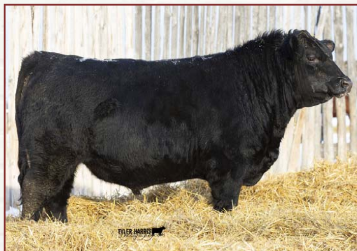
WARD'S INITIATIVE 801F