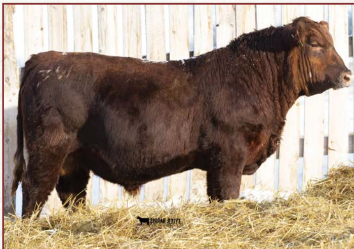
RED WARD'S HITCHINGS 853F