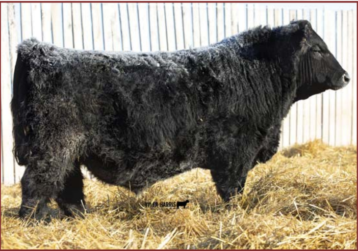
WARD'S CASH FLOW 18G