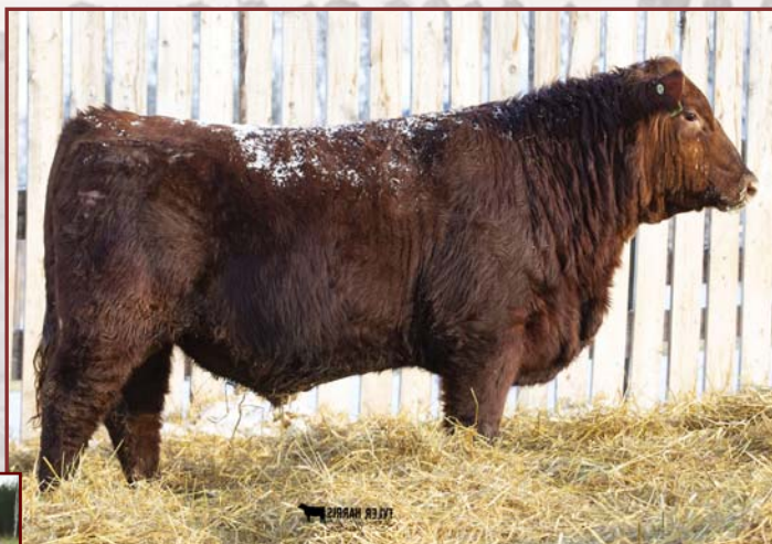
RED WARD'S HITCHED 854F