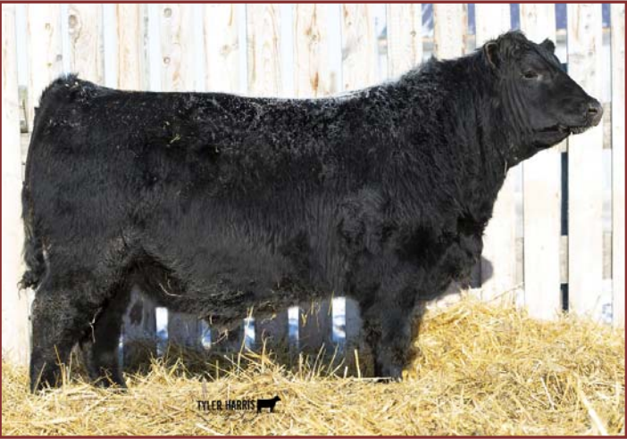
WARD'S PR GIBSON 23G

SITZ DASH 10277 BARSTOW QUEEN W16 WK RETURN VERMILION LASS 0029 SITZ UPWARD 307R SCC 5320 TIBBIE 26M LEELA SCOTCH CAP 2P ISLA BANK BURGESS 62P