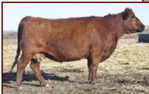
RED WARD'S BLACKBIRD 48X DAM

We were very disappointed when we lost Red TR Rollin Along 79B. He was a guaranteed calving ease specialist, combined with explosive growth and shape in his calf crop! Last Roll 96E was a late April born bull out of our Blackbird 48X cow line, so we decided to keep him to replace his sire! He has not disappointed! His calves have the same low birth weight and muscle shape the old bull had! If you need bulls for your heifer pen, look at these Last Roll sons!