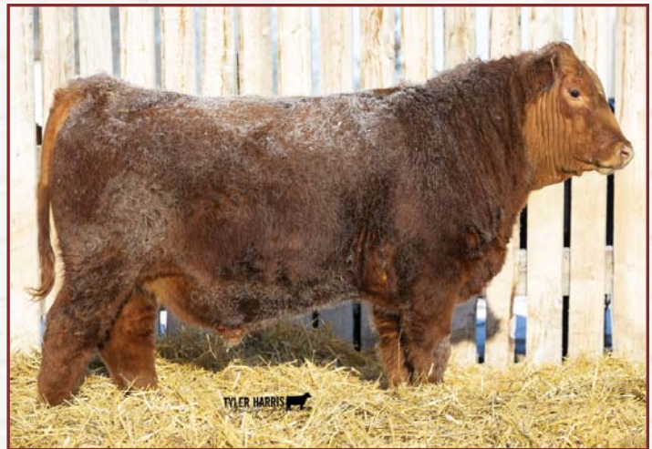
RED WARD'S GALLON 64G

RED CLAY BANDIT 18X RED SVR CHRISTINA 12Y RED T-K BAILOUT 1Z SVR MISS LARK 249X RED 5L NORSEMAN KING 229Y RED SSS DUCHESS 606P RED OPEN AV CUB PROSPECT 2N RED OPEN A V COPPER DAY 321M