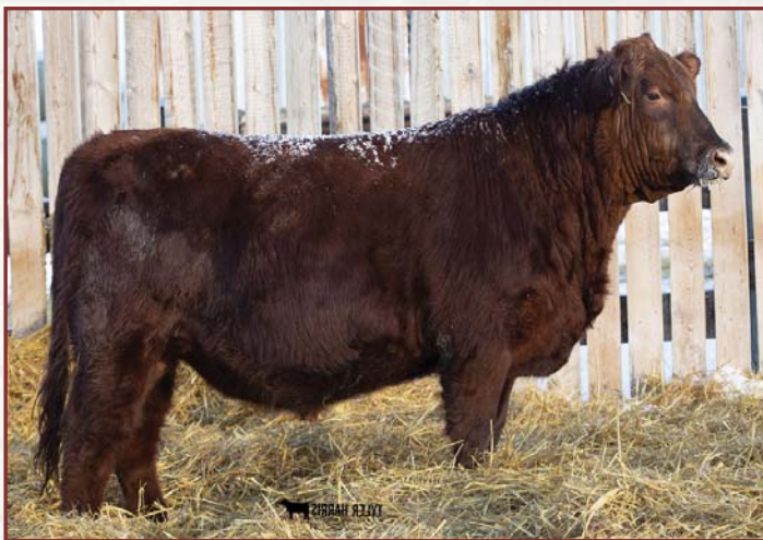
RED WARD'S FUSION 835F

• Bull that will cover a large volume of females! • 300A is a solid dam with past bulls selling to Triangle D Land & Cattle and Bill Braun.