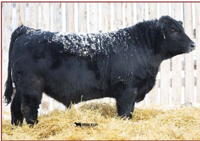
WARD'S C CASSANOVA 852F