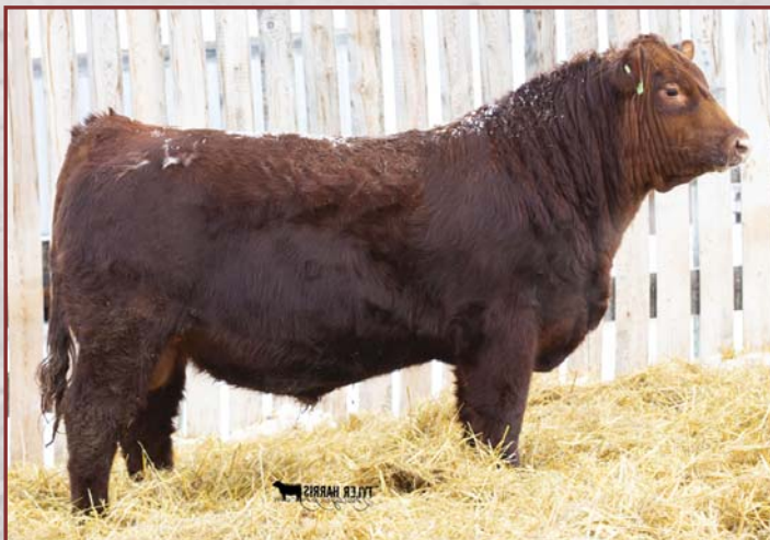
RED WARD'S FUSED 831F