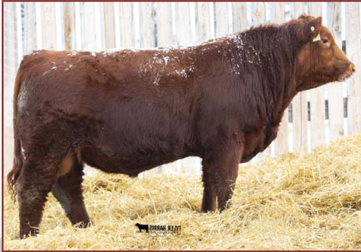
RED WARD'S PR HIKE 841F