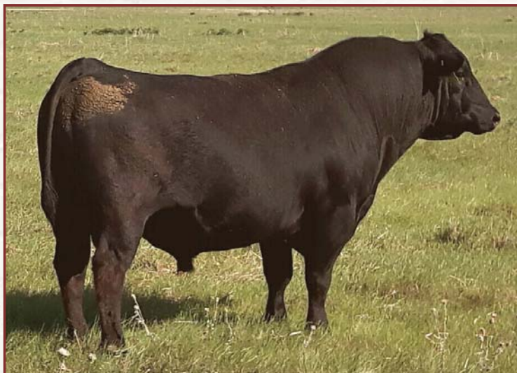
EASTONDALE CASSANOVA 126 14

These are the last bulls off of Cassanova we will have on offer. We really made this guy work over the years and he never missed a beat! We owned him with Double V Angus, he bred in both herds in the spring, then we would bring him back to breed the black fall cows! He is so well put together structurally, with the best feet we have seen, he handles it like a walk in the park! His bull calves are easy doing, moderate with muscle and they travel on sound feet and legs like their sire!