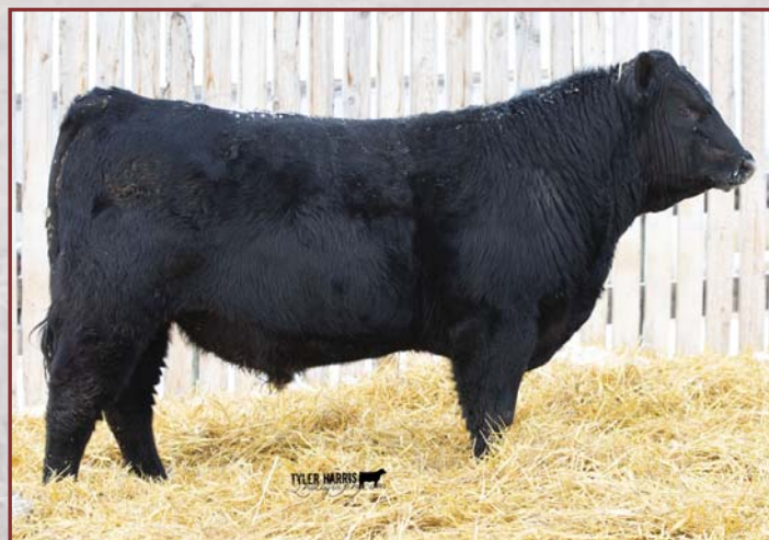
WARD'S INITIATIVE 808F