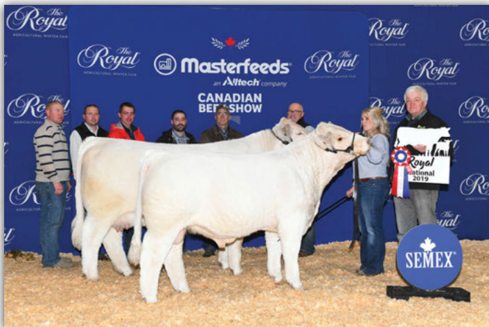
Toronto Royal 2019