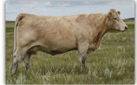
MXS 281Z - Dam of 47G