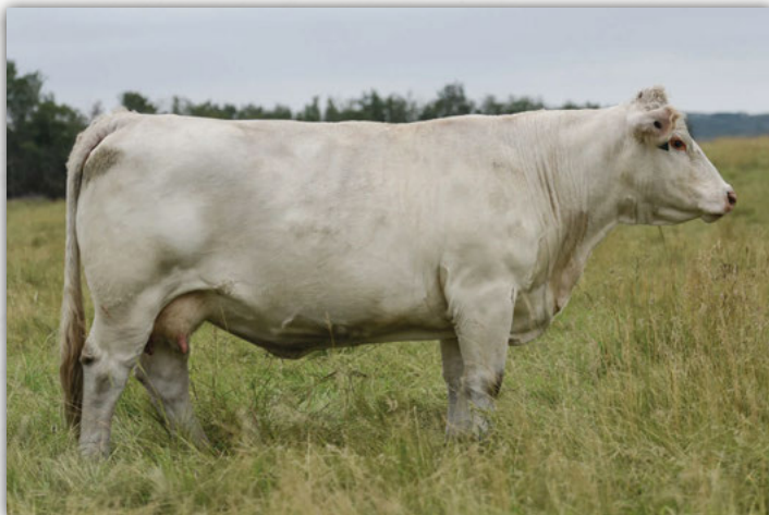
BWP 1Y - Dam