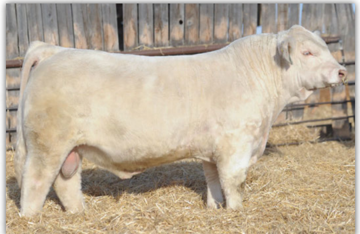
SOS 51F - Full Brother Sold to Wilgenbusch Charolais