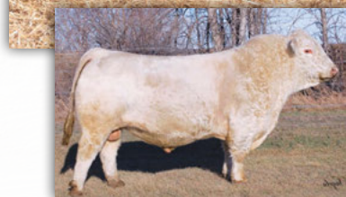
Sparrows Aquarius 493B

MD ALI TRADE U1059 WINN MANS BEVERLY 663S SPARROWS ELDORADO 361L SPARROWS ANGEL EYES 458U LHD MR PERFECT Y416 P-3 LADY MONTE 0-80Z ERIXON'S SPITFIRE 127T MXS ESPEON 824U