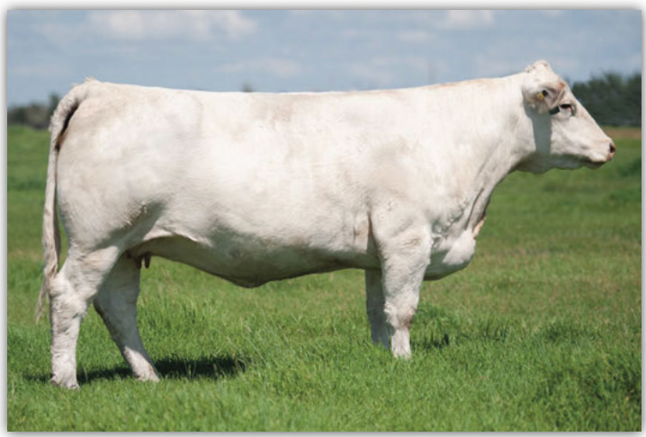
SOS Adele 167Z - Dam