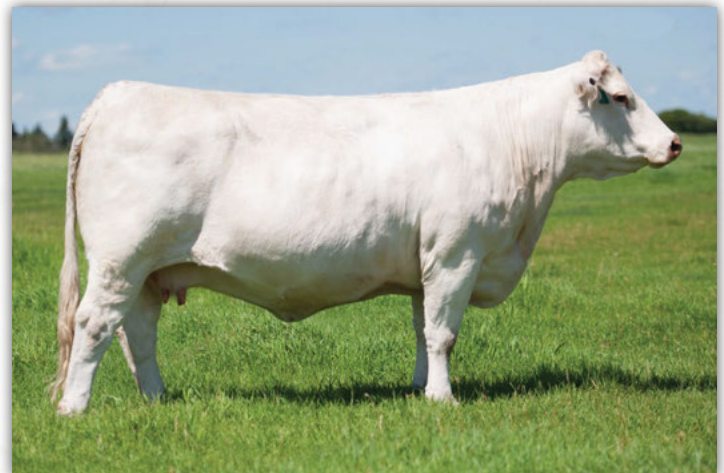
WEA 24Z - Dam