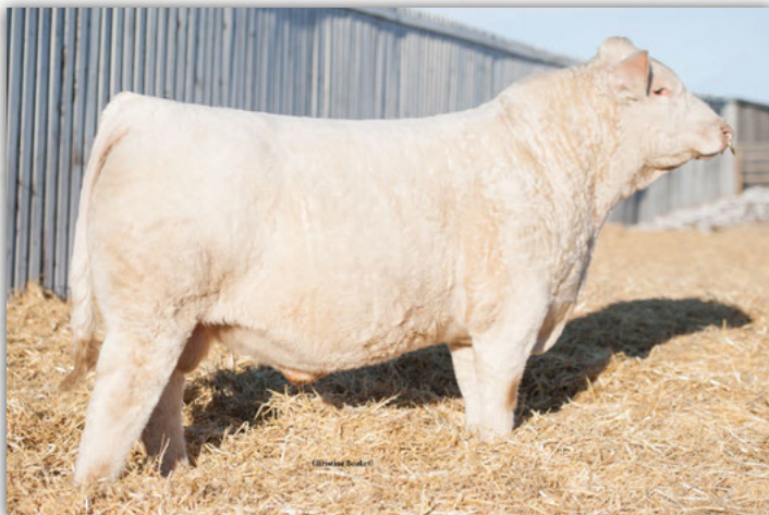
SOS 139D - Maternal Brother Sold to Hopewell Charolais