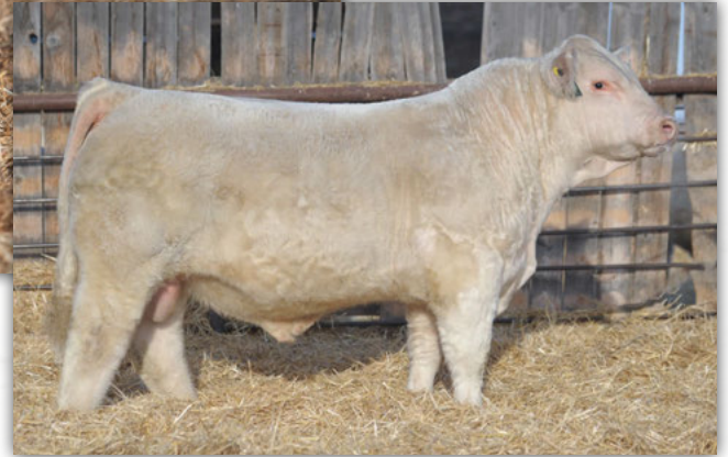
SOS 102F - Maternal Brother to 37G

MERIT 7329T WINN MANS CHAVEZ 826Y WINN MANS BREATHLESS 826U MERIT ROUNDUP 9508W MXS SNOW WHITE 419B MXS SNOW WHITE 977W HTA RHAPSODY 390N MERIT BECKY 2150M WINN MANS LANZA 610S WINN MANS BREATHLESS 160L MXS VERMILLION 527R MERIT YOLANDA 7244T ERIXON'S SPITFIRE 127T MXS SNOWWHITE 129L