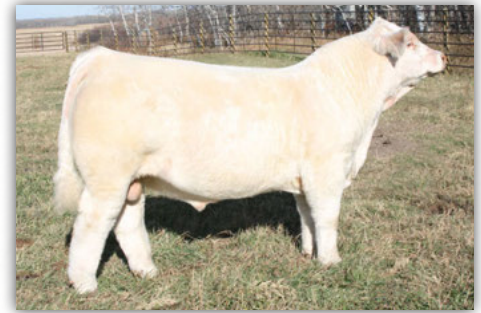
SVY Grizzly PLD 521C

SPARROWS MATADOR 7K SPARROWS BARMAID 218H SPARROWS LANDMARK 963W SDC SADIRA 31S JWY FIFTY SHADES 706Z JWY MERCEDES 20Z SVY NORTHSTAR 153Y MXS TOPAZ 537R SPARROWS ALCATRAZ 18N SVY GRIZZLY PLD 521C SVY SADIRA 155Y JWX DOWNTOWN 7C MXS TOPAZ 727E MXS TOPAZ 379A