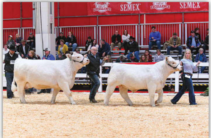
Walking in the ring at Royal 2019