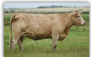
WDE 101B - Dam of 97G