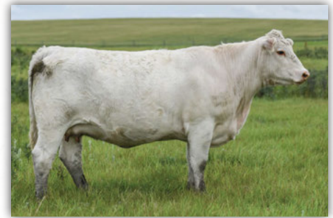
MXS Lowentree 756E