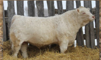
Pleasantdawn Classic 707C