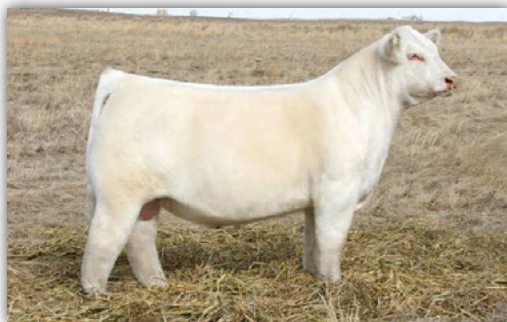
KASS/CJB Famous 6038 ET - Sire