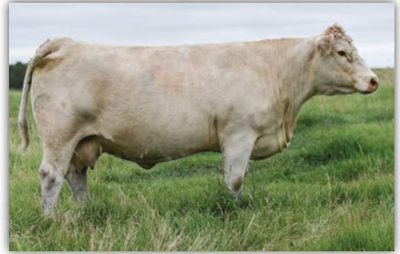
MXS Treasure 540C - Dam of 72G