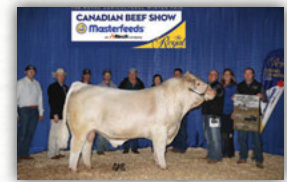
SOS Chuckwagon 54C - Sire