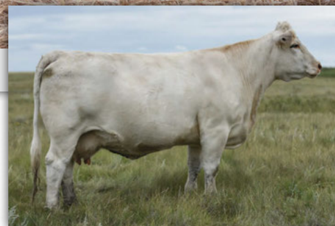
MXS 371A - Dam

SPARROWS MATADOR 7K SPARROWS BARMAID 218H SPARROWS LANDMARK 963W SDC SADIRA 31S SPARROWS LANDMARK 963W SVY STARSTRUCK 559R MXS ALGONQUAN 506R MXS CLEARCUT 318N