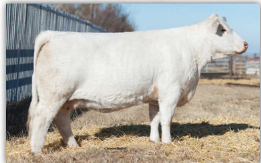
SOS Jessicah 34B - Dam