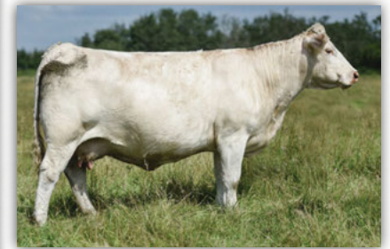
MXS 401B - Dam of 937G