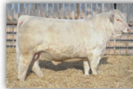
SOS 3F - Full Brother