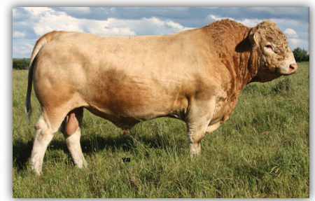
Erixon's Spitfire 127T

JWX SILVER BULLET 524W JWX SHANIA 306T JWX FIFTY SHADES 706Z JWX DOWNTOWN 7C JWX MERCEDES 20Z ERIXON'S SPITFIRE 127T MXS ESPEON 281Z MXS ESPEON 824U JWX SIR NAVIGATOR 37T CSS LADY IMPRESSIVE 20P GDSF RED KING 39M ERIXON'S LUCY 62K CSS SIR NAVIGATOR 77S MXS ESPEON 122L