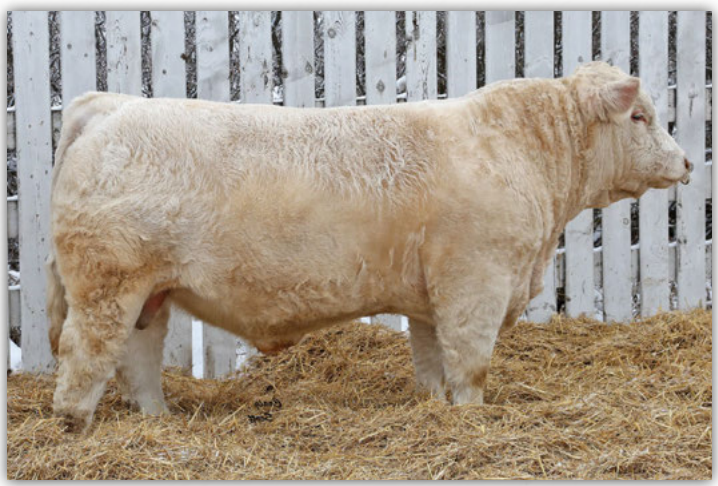
SOS Home Grown 15C - Full Brother