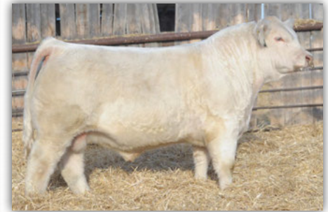
SOS 153F - Full Brother to SOS 63G Sold to Landaker Charolais