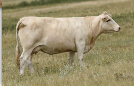
MXS 472B - Dam