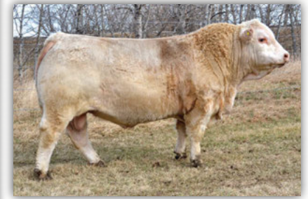
CJC Symbol B1067P