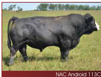
NAC Android 113C