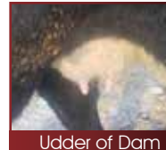
Udder of Dam