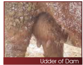
Udder of Dam