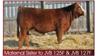
Maternal Sister to JVB 125F & JVB 127F