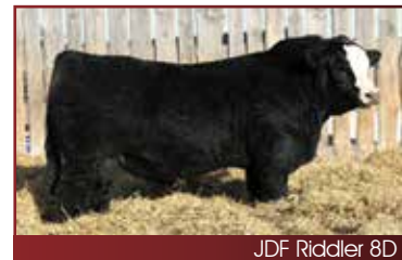
JDF Riddler 8D