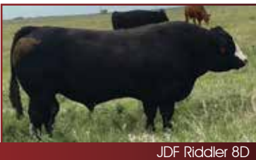
JDF Riddler 8D

Homo Polled Test Pending. Judge 48G has been a favorite all summer. So smooth and tidy with an attractive head and front end. Deep quartered and full bodied, this good footed calf will grab your attention. Mothered by a sweet Honky Tonk two-year-old. A calf you might consider for some heifers.