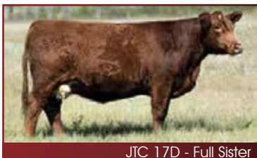
JTC 17D - Full Sister