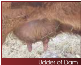
Udder of Dam