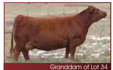
Granddam of Lot 34