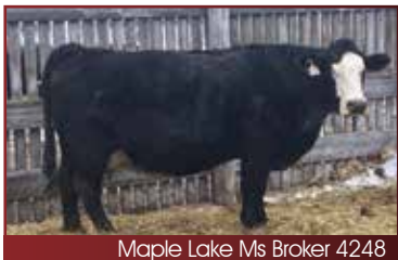
Maple Lake Ms Broker 4248