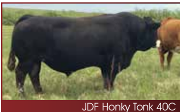
JDF Honky Tonk 40C