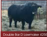
Double Bar D Lawmaker 425E

Homo Polled Test Pending. Judge 48G has been a favorite all summer. So smooth and tidy with an attractive head and front end. Deep quartered and full bodied, this good footed calf will grab your attention. Mothered by a sweet Honky Tonk two-year-old. A calf you might consider for some heifers.