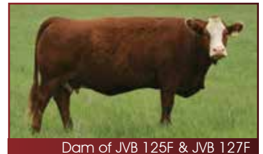
Dam of JVB 125F & JVB 127F