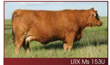
LRX Ms 153U