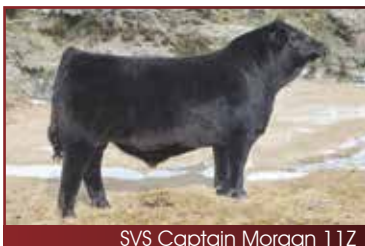
SVS Captain Morgan 11Z