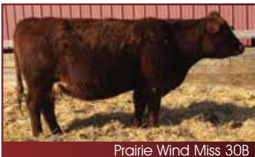
Prairie Wind Miss 30B