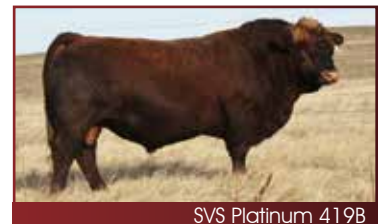
SVS Platinum 419B