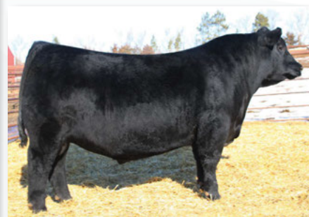
S A V President 6847 - Service Sire