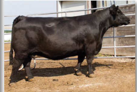
JL Evening Tinge 1250 - Graddam