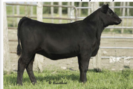
Daughter at Neilcainr