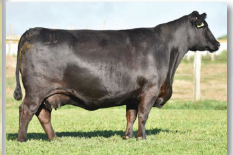
JL Ruby 5003 - Dam