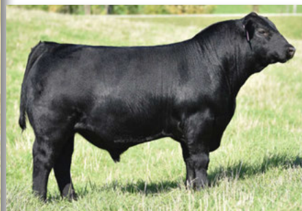
GF Lucknow 905G - Service Sire