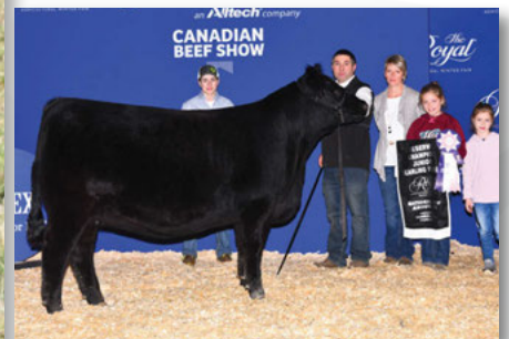
Wiwa Creek Bellemere 1743 - Dam of Lot DDGN 909G