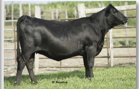
Daughter of 585C at Graco Farms

S A V 8180 TRAVELER 004 SAV BLACKCLASS 124 EA H.C.C NAVIGATOR 20P LLB COUNTESS 269N CONNEALY ONWARD SITZ HENRIETTA PRIDE 81M B C C-J C L EMBLAZON 038-287 CRESCENT CREEK ERICA 1P