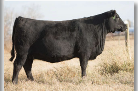
JL Forever Lady 6104