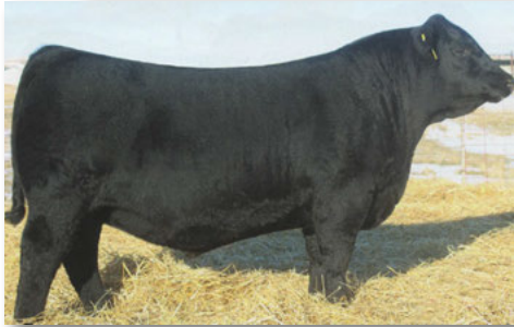
S A V America 8018