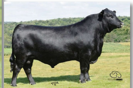
S A V Textbook 5115 - Sire