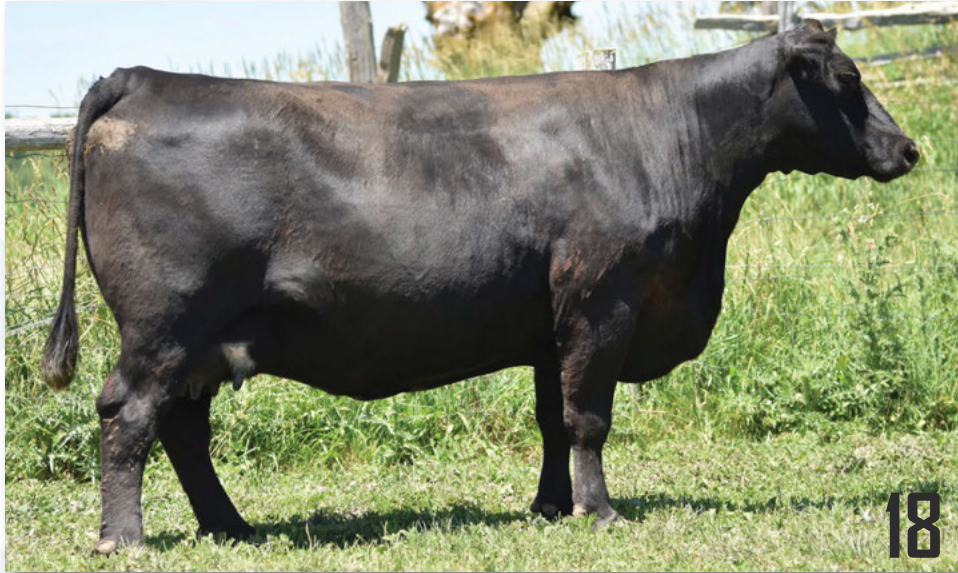
Consigned by: Rehorst Farms Ltd.

YOUNG DALE KNOCK OUT 134U BROOKMORE TIBBIE 222T YOUNG DALE PANARAMA 66T YOUNG DALE GRACE 19T HF KODIAK 5R TLA BEAUTY 5R A A R REALLY WINDY 1205 MAPLE LAKE RICHELLE 5099R