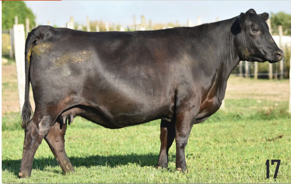
Consigned by: Rehorst Farms Ltd.