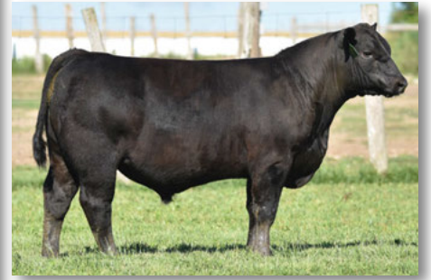
2020 Bull Calf - On display sale day!