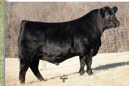
Whitestone 18-Million - Service Sire