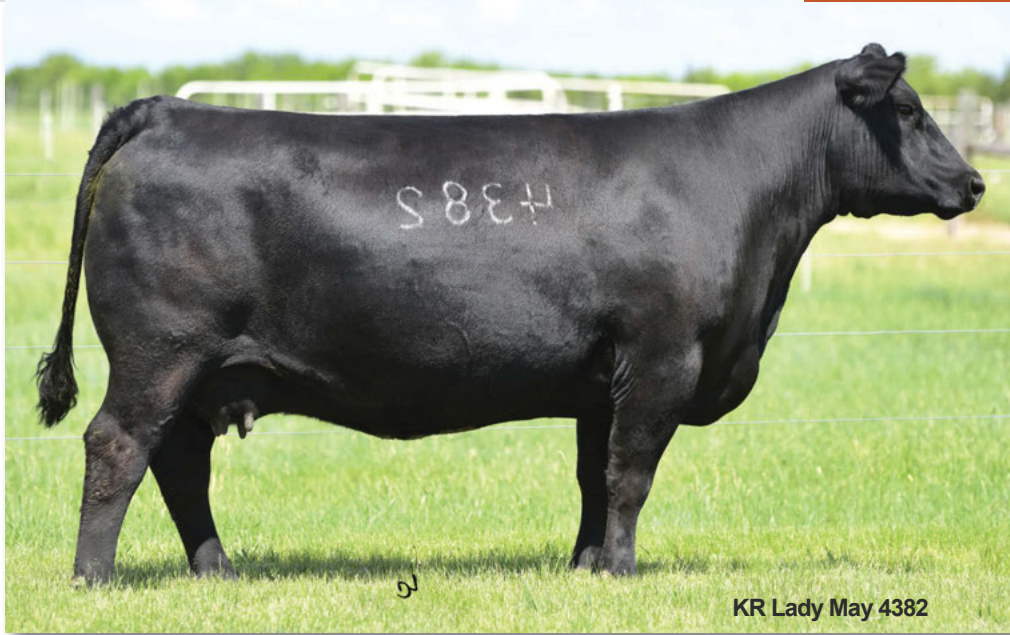
KR Lady May 4382