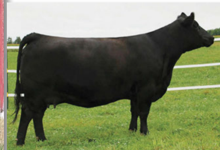
OSU Empress 3100