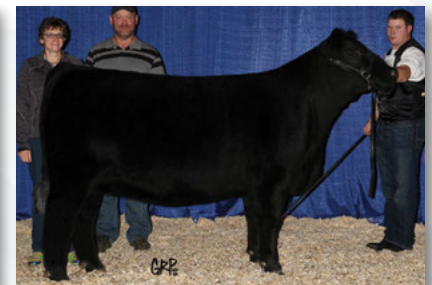
GF Shedaisy 106C - Dam