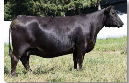
44C as a 3 year old