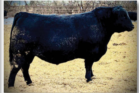
LLB Dominic 884F