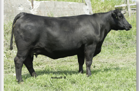
HF Evening Tinge 57R - Granddam