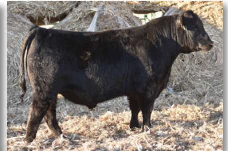
RHFL 918G - Son at Last Straw Cattle Co.