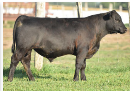
2020 Bull Calf - On display sale day