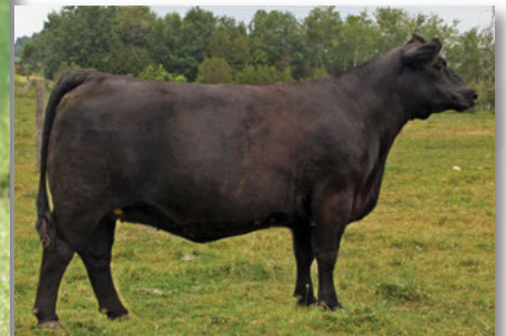
HF Evening Tinge 57R - Dam