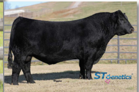
S A V Extension 6856 - Service sire