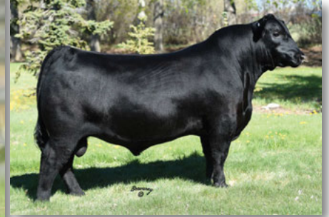
S A V Purebred 4896 - Service sire