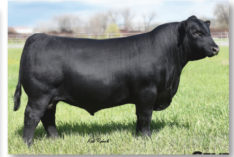
Musgrave Stunner 316