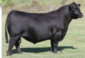
Stevenson Turning Point

A powerful heifer by South Dakota out of a hard working New Worth cow, whom possesses balanced EPDs with a marbling EPD in the top 20%. She is mated early to sexed Turning Point semen, for a guaranteed heifer baby in 2021. Her dam is from the Lucy cows out of the Gilchrist program, who we think is one of the hard working cow families to the Ontario Angus industry. South Dakota packs a marbling EPD in the top 5% of the breed and bred back to sexed Turning Point, a Weigh Up son, this is a valuable package.