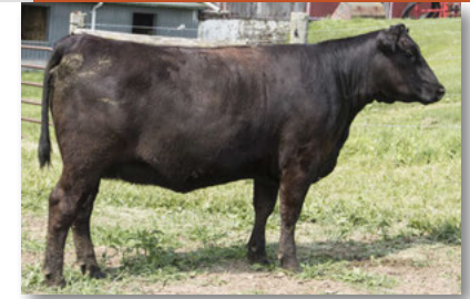
Daughter of 44C