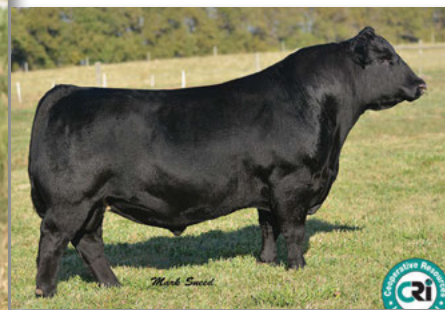
PVF Insight 0129 - Sire of PFLC 124G