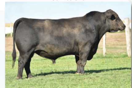
Rehorst Tinge EXR 807F - Sire of Lot 16A