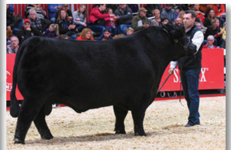
MICH Wheatland Hicaliber 7197E - Sire of Lot 14A