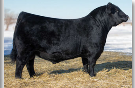
Youngdale Defiance 199F - Service Sire