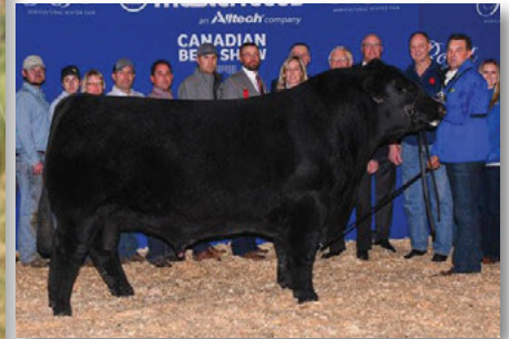
MICH Wheatland Hicaliber 7197E - Service Sire