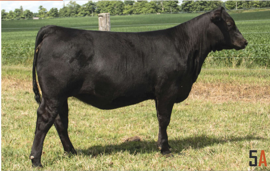
Consigned by: Meadow Bridge Angus.