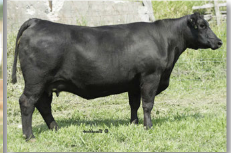
HF Evening Tinge 3618 - Dam