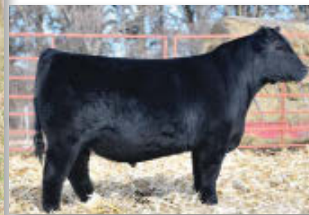
OHL Gunner 7263G - Service Sire