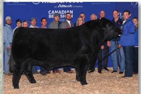
MICH Wheatland Hicaliber 7197E - Service Sire