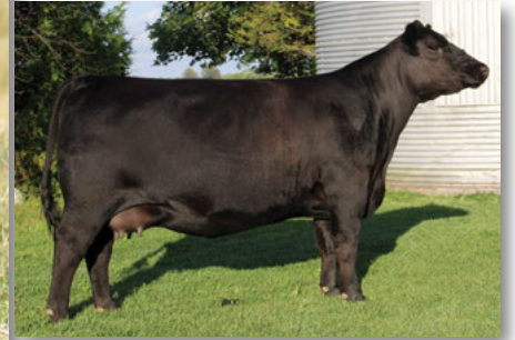
PFLC Bardetta 4A - Granddam