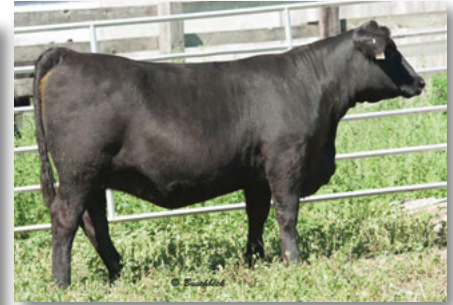
Rehorst Evening Tinge 698D - Dam