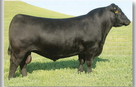
S A V Rainfall 6846