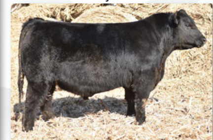
GF Blackstock 624G - Service Sire