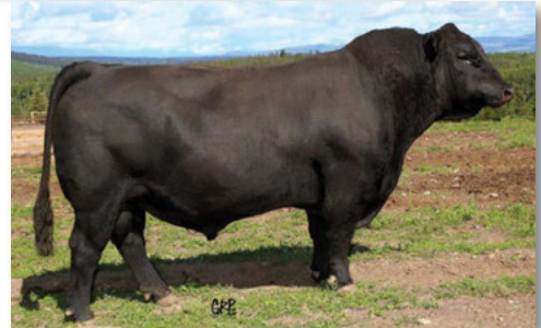
Bar-E-L Natural Law 52Y