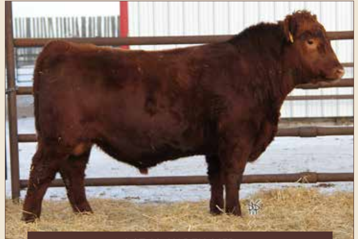
LOT 12: KADEN 245D