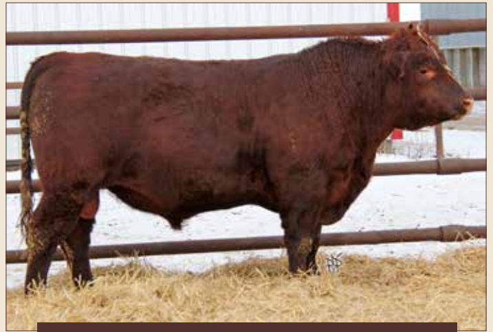
LOT 2: ALLAN 150D