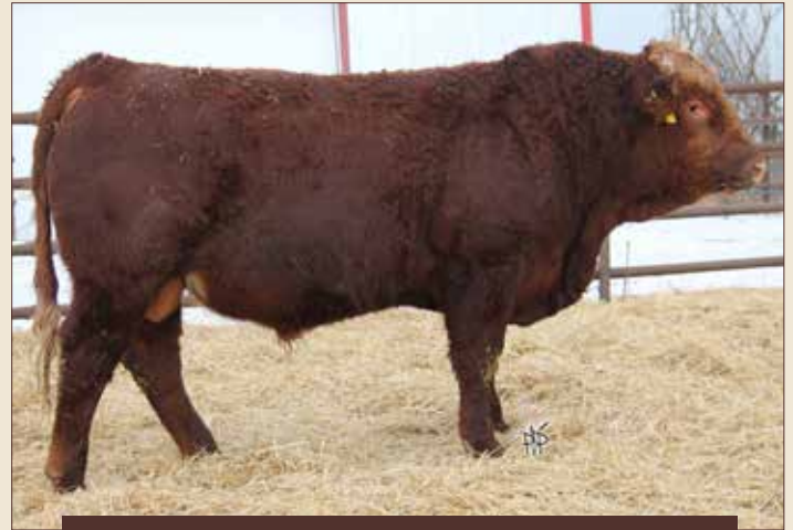
LOT 55: HYBRED 221D