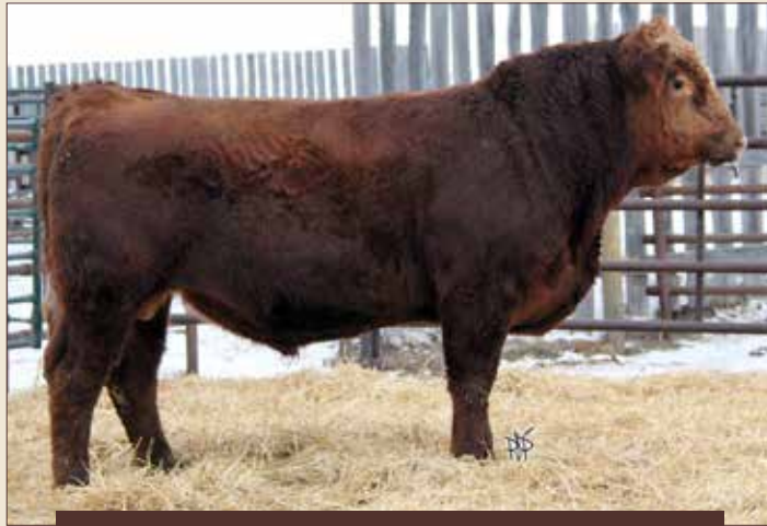
LOT 32: HYBRED 322D