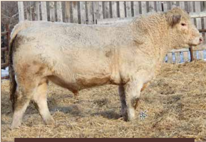
LOT 61: JAMBOREE 175D