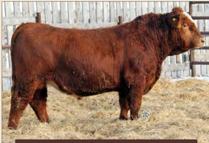
LOT 39: HYBRED 351D