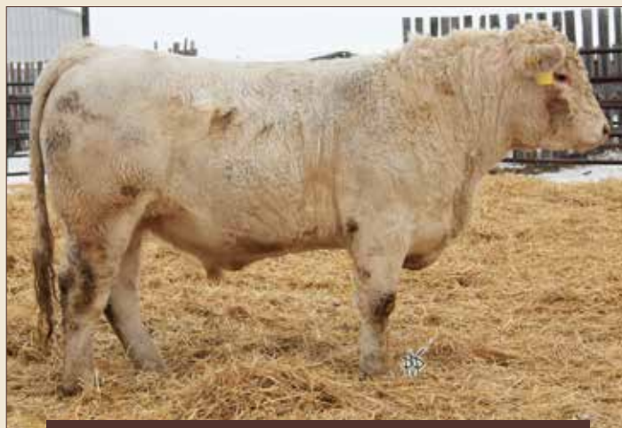
LOT 60: FROLIK 152D