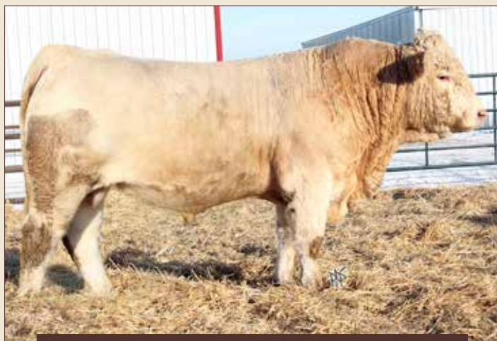
LOT 56: PILLAR 107D