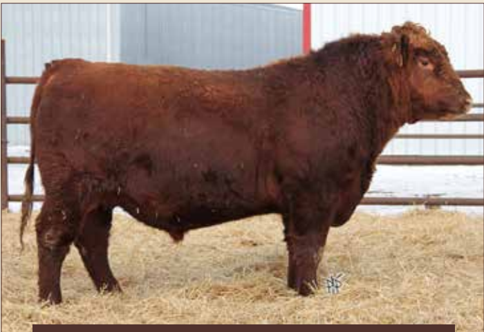
LOT 9: CAPONE 156D

9 CAPONE 156D RED | POLLED | 1935790 | 3-APRIL-2016