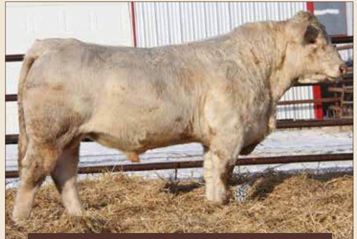
LOT 64: HAVRE 164D