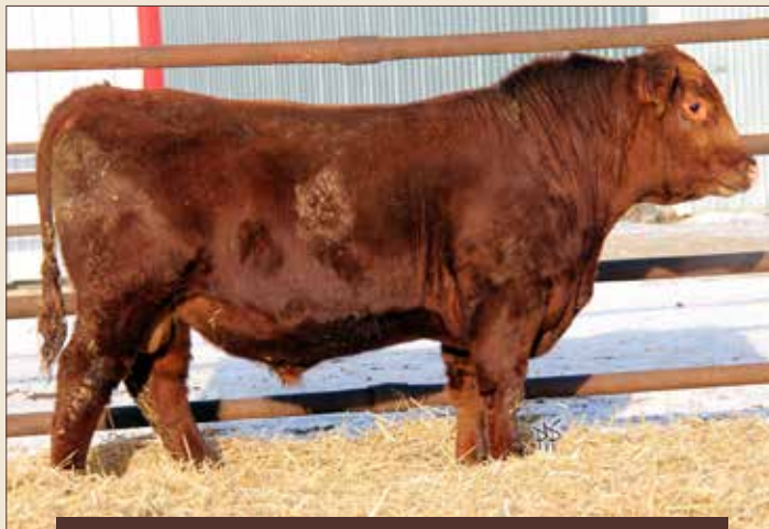
LOT 29: BANDLY 216D