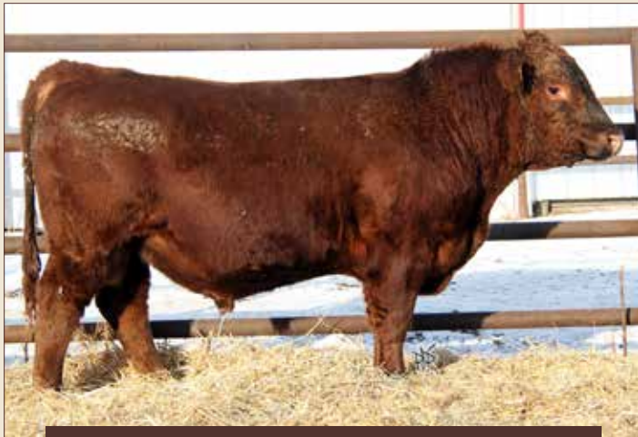
LOT 21: VANDURRA 114D