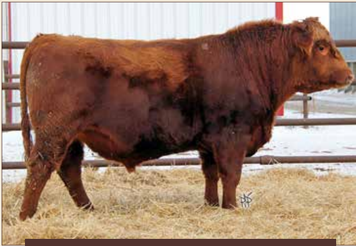
LOT 1: SCRANTON 165D