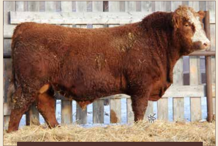
LOT 34: HYBRED 317D