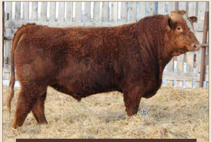
LOT 44: HYBRED 343D