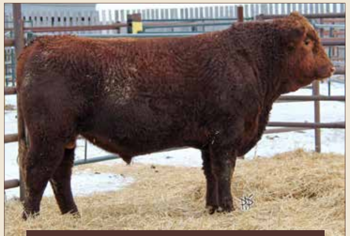
LOT 49: HYBRED 337D