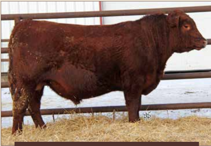
LOT 26: FRANK 258D