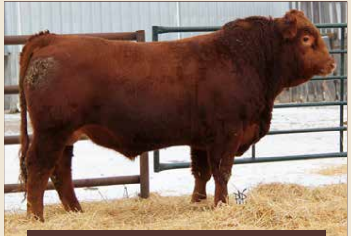
LOT 37: HYBRED 309D