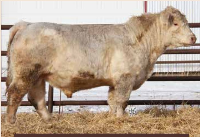
LOT 63: MIDAS 143D