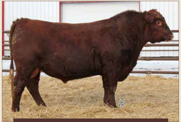
LOT 6: PHIL 138D

5 EARL 176D RED | POLLED | 1945262 | 24-APRIL-2016