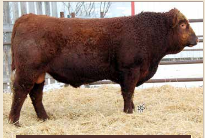
LOT 41: HYBRED 367D