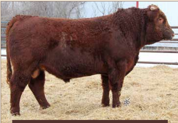
LOT 48: HYBRED 373D