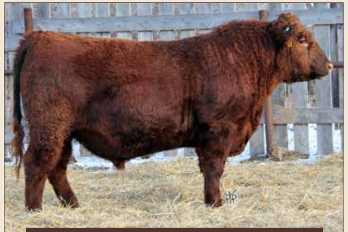
LOT 4: FALLOON 158D