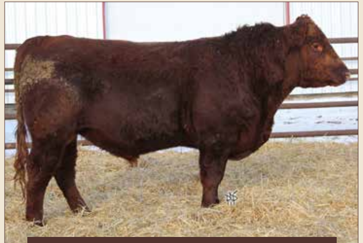
LOT 23: MIXBURN 169D