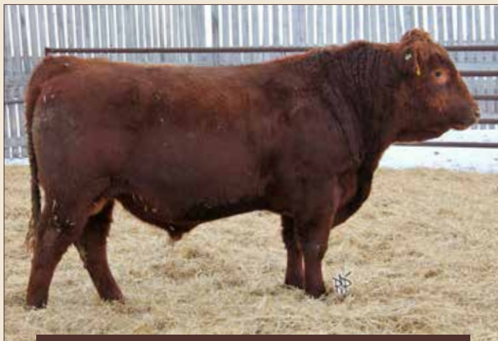
LOT 18: TWISTER 13D

EPDs are breed specific and are meant to compare animals within the same breed only. They are not comparable across the different breeds.