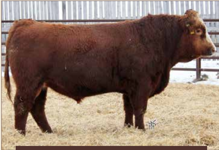
LOT 53: HYBRED 304D