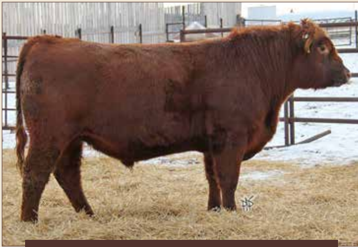
LOT 5: EARL 176D