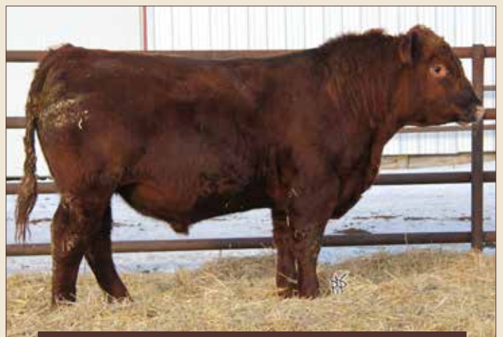
LOT 25: RICK 237D