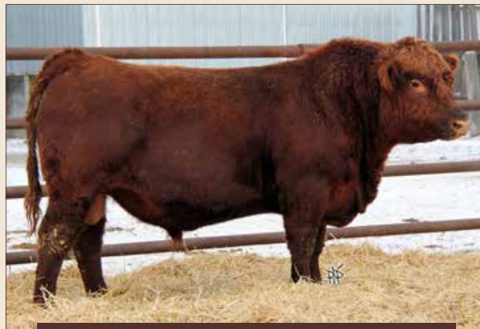
LOT 19: SPYDER 159D