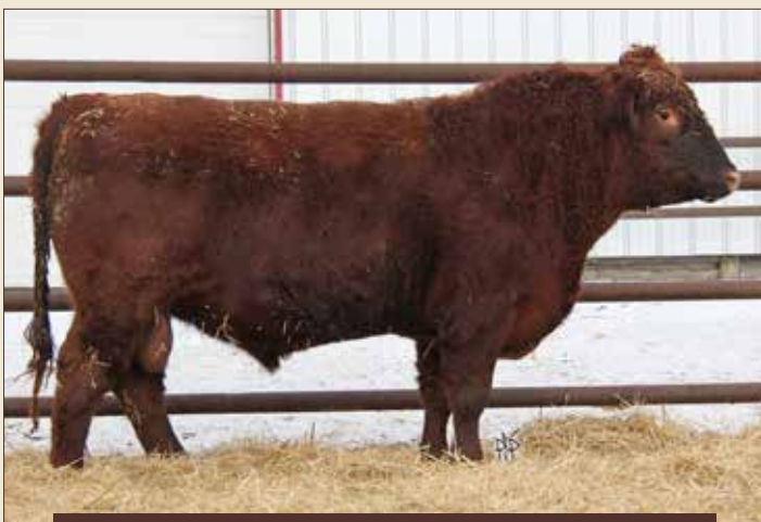
LOT 20: WALPOLE 115D