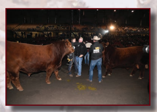
SUPREME EXCITEMENT - FARMFAIR 2017 (IMPACT ON LEFT, TRADITION ON RIGHT) BOTH PLACING IN TOP FIVE