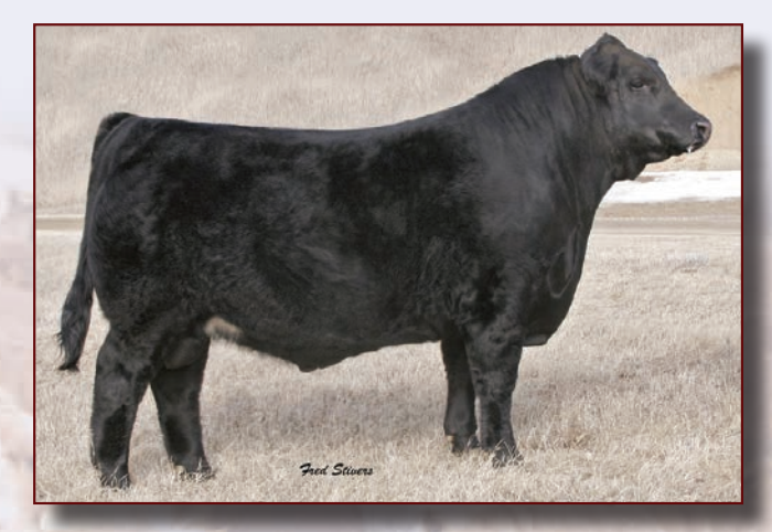
TMCK WESTMORELAND SIRE OF LOT 16 - RGA 1D

Westmoreland has been one of our strongest breeding sires. From moderate birth to solid growth figures and impressive structure in his progeny he has covered it all. Here is a son that will blend calving ease with good growth numbers.