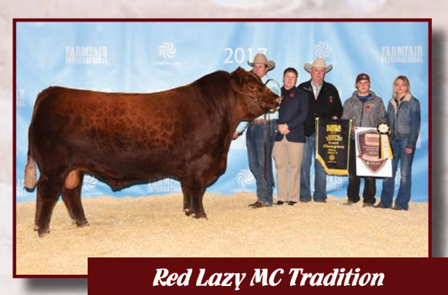
NATIONAL CHAMPION RED ANGUS FARMFAIR 2017