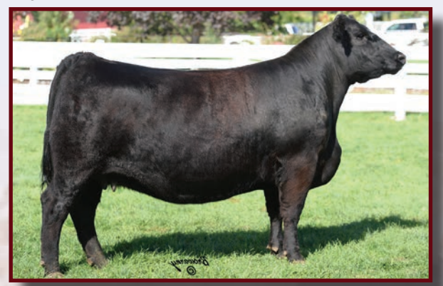
EF BLACKBIRD 10A DAM OF LOT 26 - RJG 10D

Retaining semen interest for in herd use.