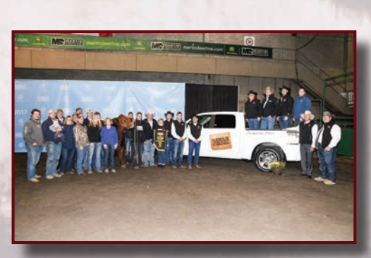
"WE GOT THE TRUCK!" FARMFAIR 2017