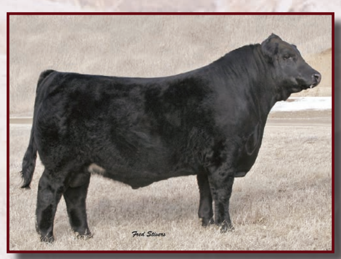
TMCK WESTMORELAND 889X SIRE OF NORDAL BLACKSMITH