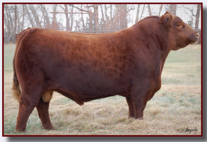
Red Lazy MC Tradition 111C