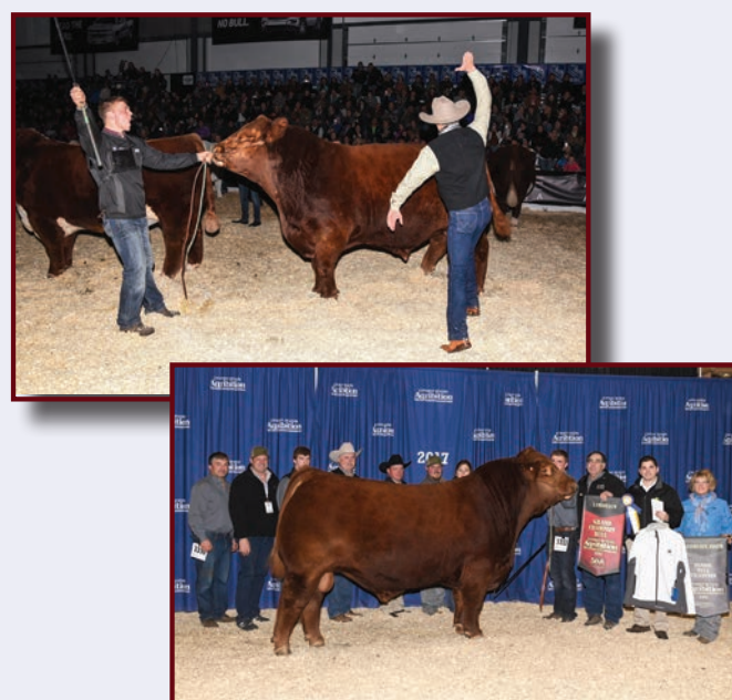
At Agribition 2017