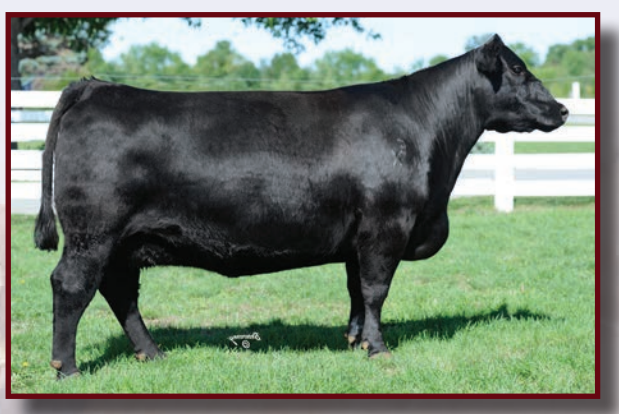
EXAR BLACKBIRD 5877 GRAND DAM OF LOT 26 - RJG 10D