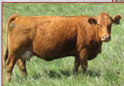
Dam of Lot 4