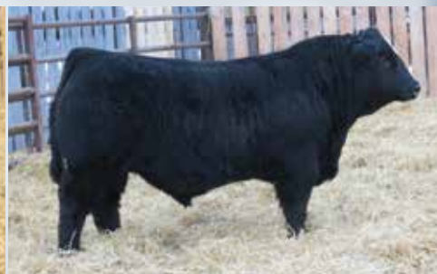
R Plus Hammertime 5051C

Sold in 2016 sale to Bonchuk Farms, Rocky Meadow Simmentals & JP Cattle.