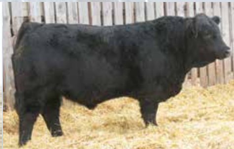
R Plus Prairie Fire

Sold to Westway Farms. Could be one of the most influential black Simmental bulls ever.