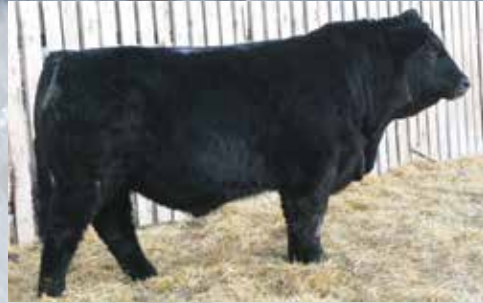
R Plus McSteamy 8028U

Sold to Westway Farms. Top red son of Edge, continually sires the top Another Black Edge son that has selling bulls at Westway and R Plus. done amazing things.