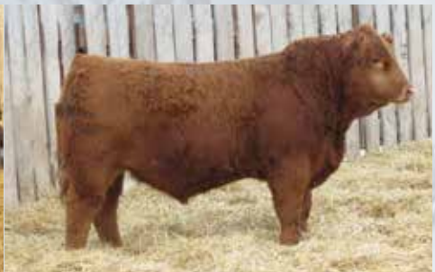
R Plus Keystone 3011A

Sold to Traxinger Simmentals, Claremont, South Dakota in our 2014 Sale.