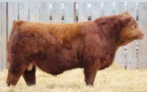
R Plus Hitman 4194B

Sold in 2015 sale to Circle G Simmentals, Lacombe, AB & Spring Creek Colony, Walsh, AB.