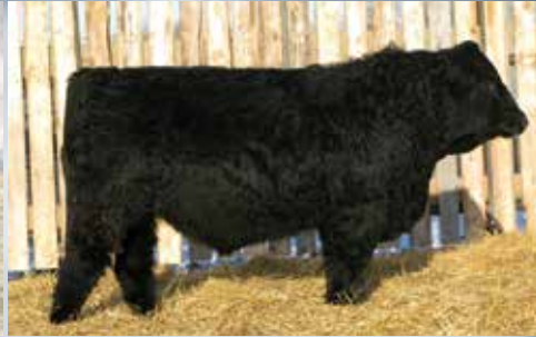
R Plus Blackout

Sold to Tri R Simmentals. The great female maker and also the sire of Yukon.