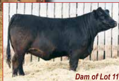
Dam of Lot 11