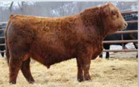
R Plus Venom 4006B

Sold to Kunkel Simmentals, New Salem, North Dakota in our 2014 Sale.