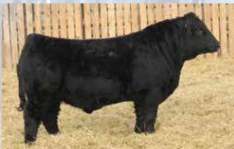
R Plus 5015C

Sold in 2015 sale to SIBL Simmentals, Cherhill, AB. Great Reload 2006Z son.