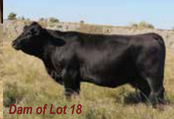
Dam of Lot 18

CNS DREAM ON L186 WS PILGRIM H182U WS MARLA 276M