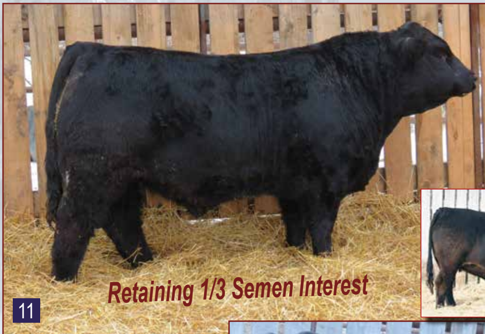
Retaining 1/3 Semen Interest

The 15A cow raised our high selling bull in 2016, selling to JP Farms, Bonchuck Farms and Rocky Meadows. This years Profit son has been one of the real popular bulls in the pen.