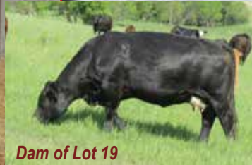
Dam of Lot 19

CNS DREAM ON L186 WS PILGRIM H182U WS MARLA 276M