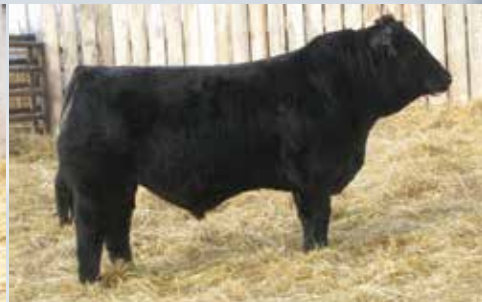
R Plus 2035Z

Sold to Kopp Farms. His legacy, a number of top sellers at Kopp's recent dispersal.