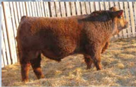
R Plus Redge 8018U

Sold to Westway Farms. Top red son of Edge, continually sires the top Another Black Edge son that has selling bulls at Westway and R Plus. done amazing things.