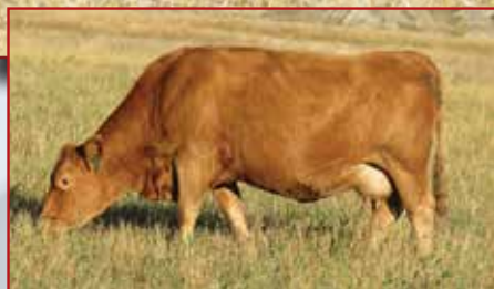
Dam of Lot 3