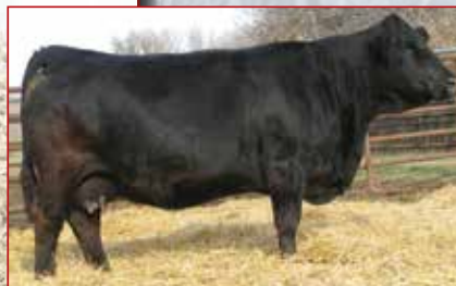
Dam of Edge Sun Star Miss Drive

Edge is a bull we raised and sold in our 2006 sale to Westway and Lewis farms. He has definitely influenced our program more than any other bull we have ever raised or seen in the breed. He is certainly influencing the Simmental breed through his sons and daughters that are working in several herds. The thing about Edge, is he makes his calves better in consistency, kind and type. Throw aways are few and far between.