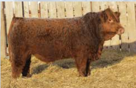
R Plus 3197A

Sold to Highway 5 Simmentals, Canora, SK in our 2013 Sale.