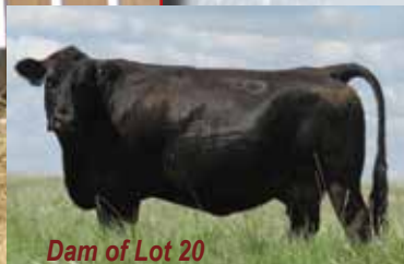
Dam of Lot 20

CNS DREAM ON L186 WS PILGRIM H182U WS MARLA 276M