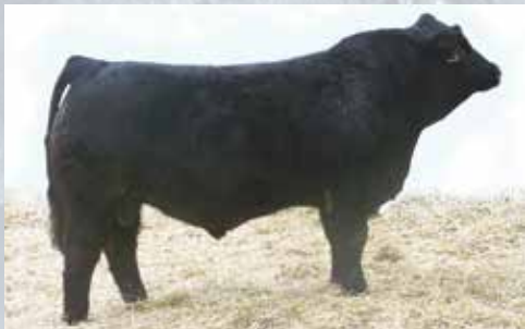
R Plus Black Edge 5028R

Sold to Tri R Simmentals. The great female maker and also the sire of Yukon.