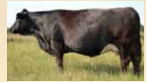
MBJ 17U - Grand dam