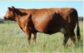
MBJ 168X - Grand dam