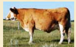
MBJ 66J - Grand dam