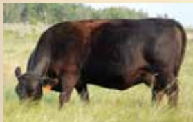
RRAR 31S - Grand dam