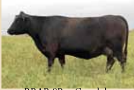
RRAR 8R - Grand dam