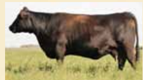
RRAR 27X - Grand dam