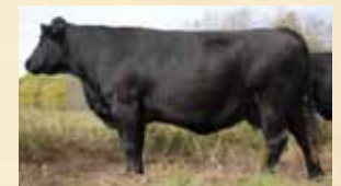
MJB 25T - Grand dam