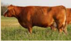
MBJ 104X - Grand dam