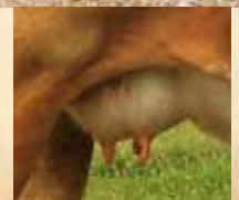
Dam's udder at a younger age

'Liner 9D' has a world of breeding potential. His dam is a beautiful deep bodied cow that would make my all-time 'top 10 list'. Paternal sisters to 9D are in demand as much as any sire group in our Simmental industry. These '56U' daughters consistently raise my top bulls. His sire and dam are both still going strong, and looking good doing it at an advanced age. His EPD's and his individual performance are outstanding along with his very impressive phenotype. He has good testicles and has a very nice disposition. His gestation was 283 days. You will go a long way to find a better pedigreed red blaze faced bull. He is tested homozygous polled. Retaining 100 doses for in herd use.