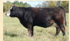
MBJ 102T - Grand dam

The black baldies are always popular and '31D' is no exception. His dam is perfectly uddered and very fertile. She sold to Van De Velde Cattle as did a daughter of hers in a previous sale. She also has two daughters in my herd. He is a twin and had a gestation of 286 days.