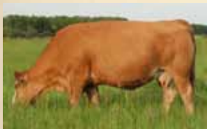
MBJ 54R - Grand dam