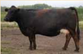
MBJ 59U - Grand dam

SPRINGCREEK ALL IN 155Y SPRINGCREEK GOLD STANDARD SPRINGCREEK GOLDY 135W SPRINGCREEK LOTTO 52Y SPRINGCREEK NEVA 913A SPRINGCREEK LINNE 59U