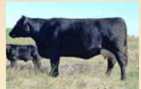
DTZ 39R - Grand dam