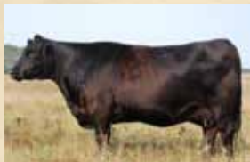
8Y - Grand dam