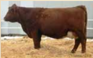
MBJ 5M - Grand dam