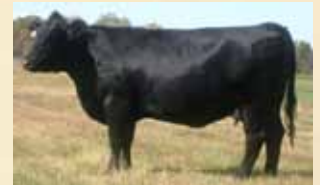
MBJ 7P - Great Grand dam