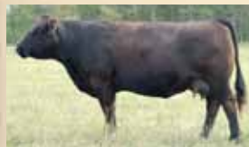
MBJ 10R - Grand dam