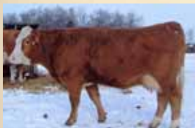
CLNO 25J - Grand dam