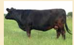
MBJ 124T - Grand dam