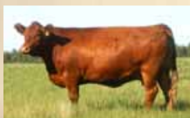
MBJ 861M - Grand dam