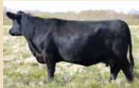
RRAR 9Y - Grand dam