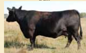
RRAR 8W - Grand dam