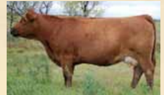
MBJ 6X - Grand dam