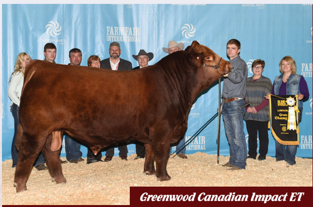
Greenwood Canadian Impact ET

Blacksmith was the top selling bull in our 2016 sale at $25,500 to Stonyview Farms. He is impressive in his depth, length and correct structure with an outstanding disposition. His sire Westmoreland has continued to impress as his progeny mature. We are confident in Blacksmith's future as we have bred a large number of our Commercial and Purebred Limousin for 2017. His individual growth numbers and EPD's along with a sale day scrotal of 41cm and at 2000 lbs. We will have semen available for the 2017 breeding season. Co-Owned with Stonyview Farms, Lockwood, SK.