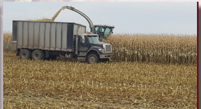
The results to a record corn harvest.