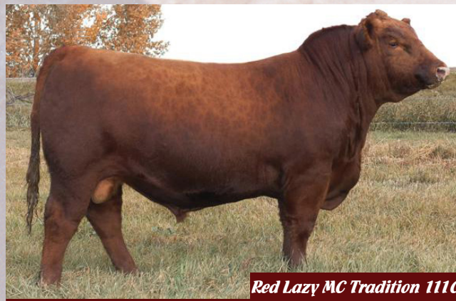
Red Lazy MC Tradition 111C

Tradition 111C was the pick of the bulls from the Lazy MC Red Angus Cow Girls 2015 sale. As part of Lazy MC show string he has been Grand Champion at the Olds Fall Classic and Reserve Junior Champion at Edmonton Farm Fair and Agribition, plus a RBC Supreme Qualifier, in 2016. We were impressed with his sire WPRA Legacy and being out of the top rated Firefly Cow family. We anticipate a large group of progeny from tradition in both our red commercial females and our Red Angus purebred herd. Semen available on Tradition 111C. Co-owned with Lazy MC Angus.