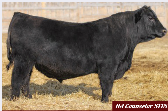
HA Counselor 5118

We will have semen available in 2017 on HA Counselor 5118. Co-owned with Hinman Angus, Malta, MT.