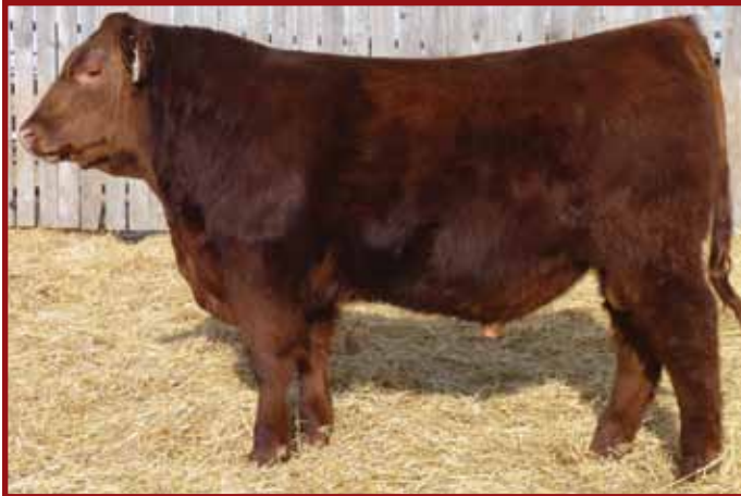
Red Bar-E-L Acquire 176A