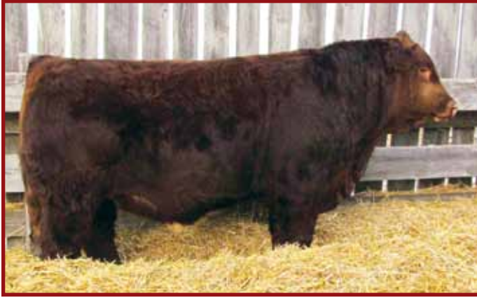
Erixon Sniper 68Y