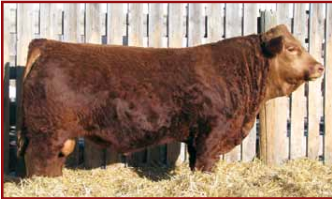
CMS Luongo 304A