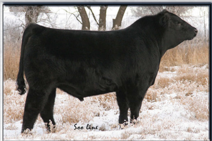
SOE LINE YELLOWSTONE 9286