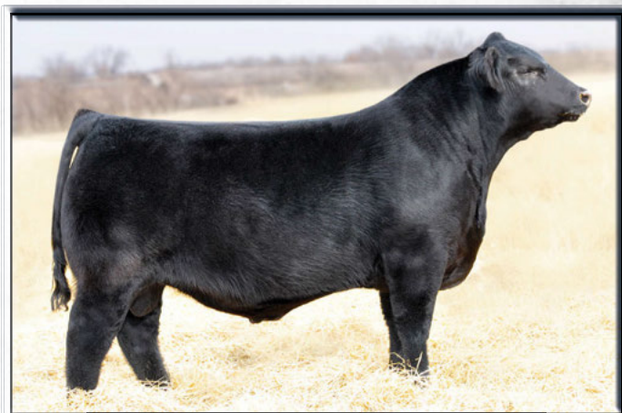
EXAR UPSHOT 0562B