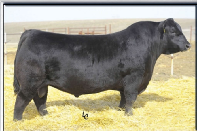
R B TOUR OF DUTY 177