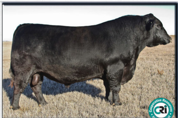
JINDRA DOUBLE VISION