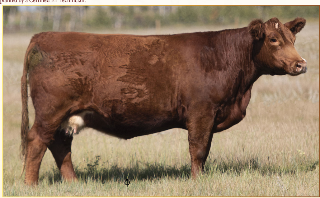
QUEENS OF THE HEARTLAND PRODUCTION SALE