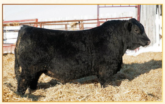
174H - Service Sire to 140H