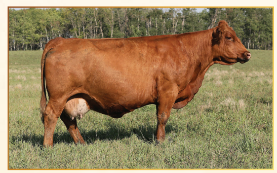
48Y - Dam of 113H & 92H

Polled tests pending AI bred April 17th to JPCC Ignition 166F. Exposed to Scissors Hemisphere 2H May 3rd- June 1st Vet opinion- Hemisphere