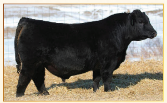
Six Mile Cache Creek 804E - Sire

AI bred to Wheatland Monument 28H April 18, 2021. Exposed to Scissors Hemisphere 2H May 3 - June 1, 2021 Vet opinion- Favourable to AI