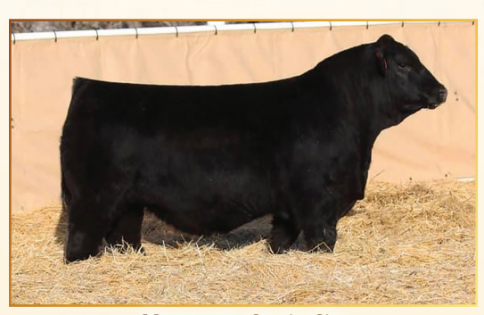
Monument - Service Sire

Monument 28H was a bull that was highly sought after in the sale and many predominant breeders in both Canada and the USA acquired semen packs. Here is a bull with calving ease numbers and thickness you can't deny. These are some of the first heifers to sell that carry his service.