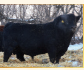
JPCC Super Smooth 69B - Sire of 33H & 99H

Polled and color test pending Exposed to JPCC Rito 174H May 3- June 1, 2021