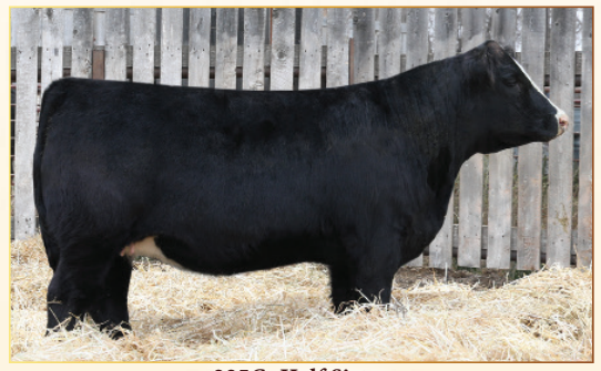
225G- Half Sister

Polled and color test pending AI bred to Wheatland Monument 28H April 18, 2021. Exposed to Scissors Hemisphere 2H May 3- June 1, 2021 Vet opinion- Favourable to Hemisphere