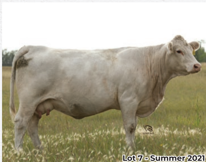
Lot 7 - Summer 2021