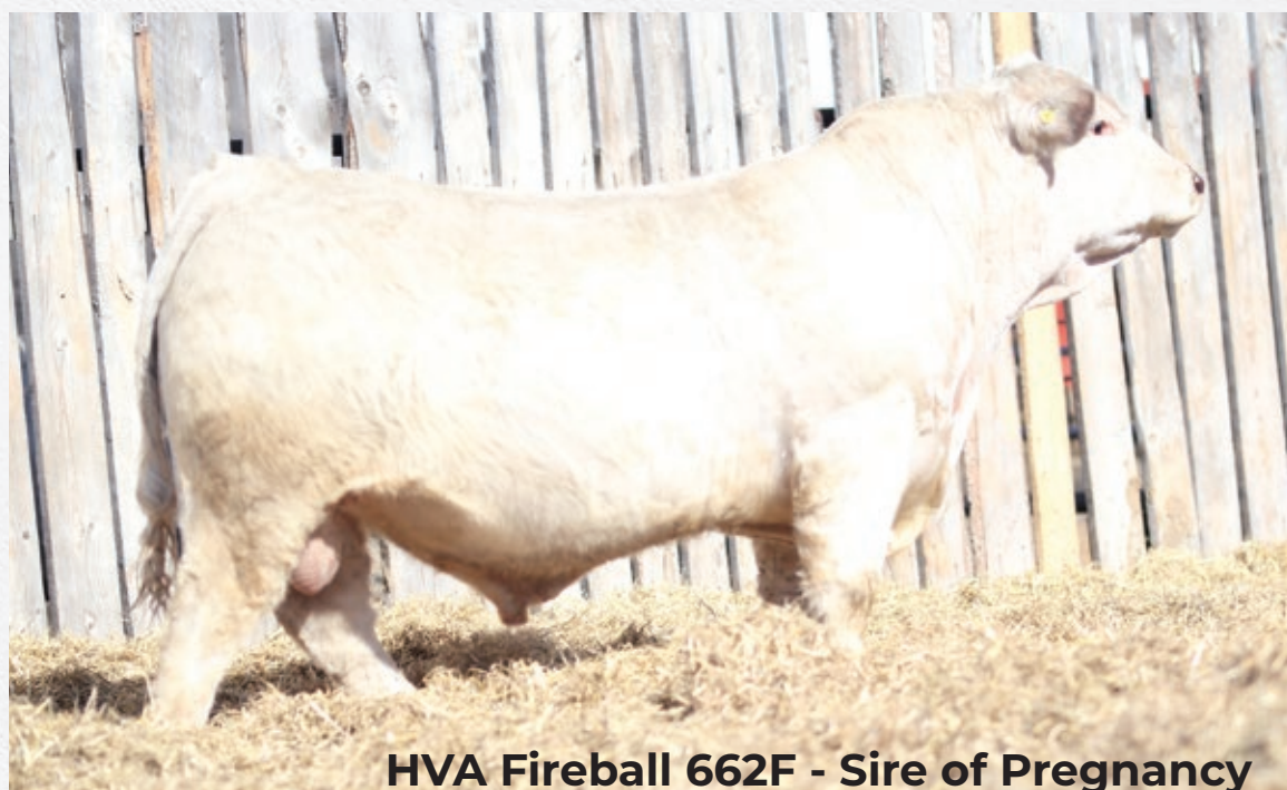
HVA Fireball 662F - Sire of Pregnancy

• The donor cow, Lily was the 2017 Supreme Champion at the RBC Supreme at CWA and the Supreme Champion at Farm Fair International that same year