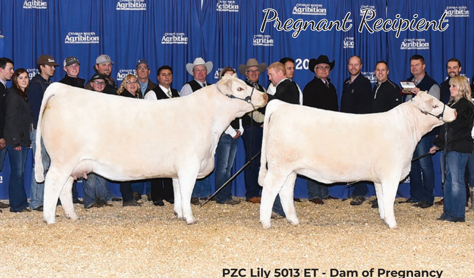
PZC Lily 5013 ET - Dam of Pregnancy