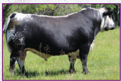
Invictus 103C Sire

Buyer supplies semen and pays all associated costs of transporting and flushing. One flush guaranteeing 4 embryos.