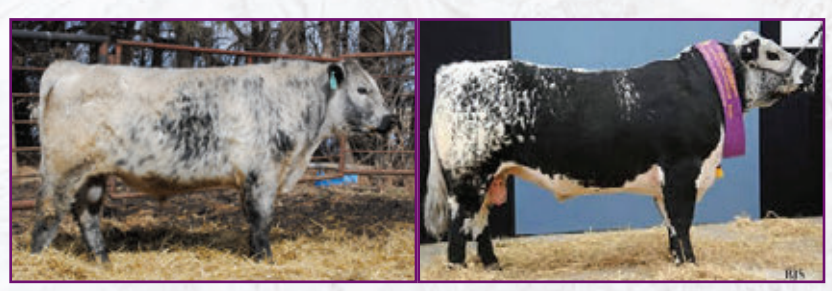
MX hard as a rock 157H Service Sire

Al bred to Rose Hill American Pie L21 April 5, 2021 Exposed to MX Hard as a Rock 157H April 15, 2021