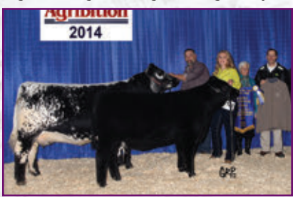
JANETTE 3W DAM