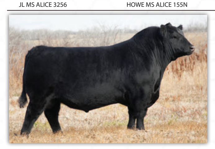
HLC 101 Cross Fire 569C - Sire

CHD 818H AI bred April 22, 2021 to Chestnut Turning Heads 29G. Exposed to JL Mr Rain 0041 from May 6 - July 13, 2021. Safe to AI service Due Jan 29, 2022.