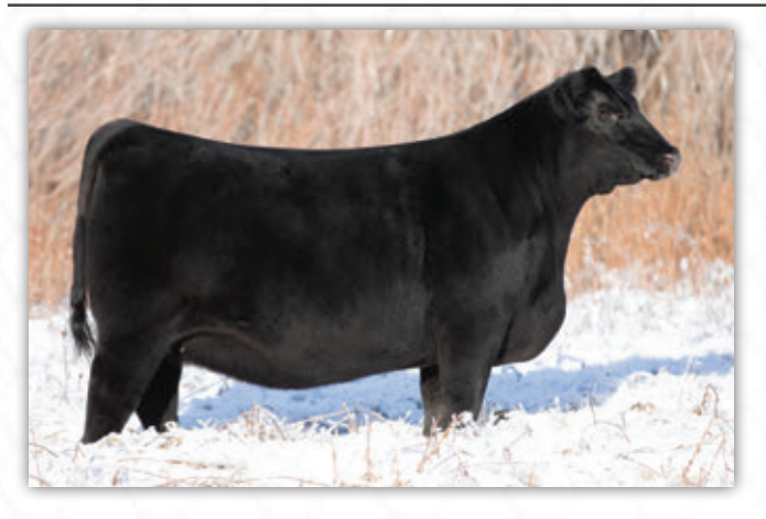
HLC Erica 561G - Dam

This female is the result from the first IVF flush out of past sale highlight, HLC Erica 561g and the outstanding $1.51 million dollar, SAV America 8018. This set of Erica calves have been very exciting to watch develop. They are exceptional in terms of body dimension, muscle mass and width of base. For as stout and powerful as 886 is she is still very attractive up through her head and neck. A female I feel is as good as we have walked through this ring. The consistency in this group of flush mates is unprecedented. They are like peas in a pod, all sharing that powerful design and exceptional look. She will have 3 brothers headlining our spring bull sale.