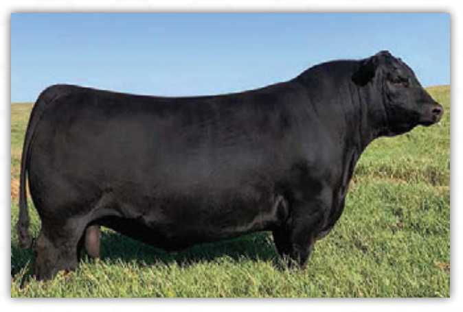
S A V America 8018 - Sire