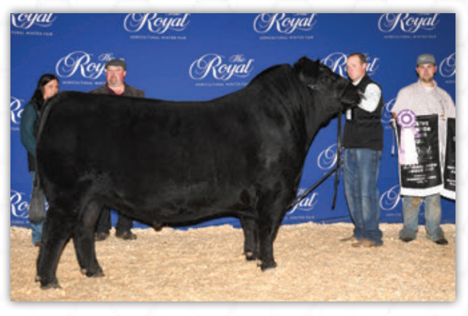
HLC 101 Cross Fire 569C - Sire