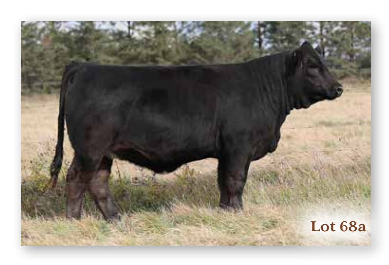
PAGE 40 WLB Livestock Complete Dispersal Sale