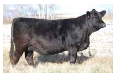
WLB 435B WLB 435F