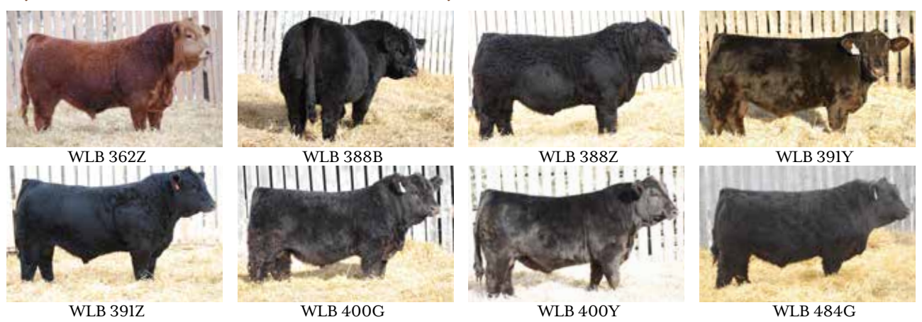
Progenyofthe Black Ms New Trend 412 H Cow Family