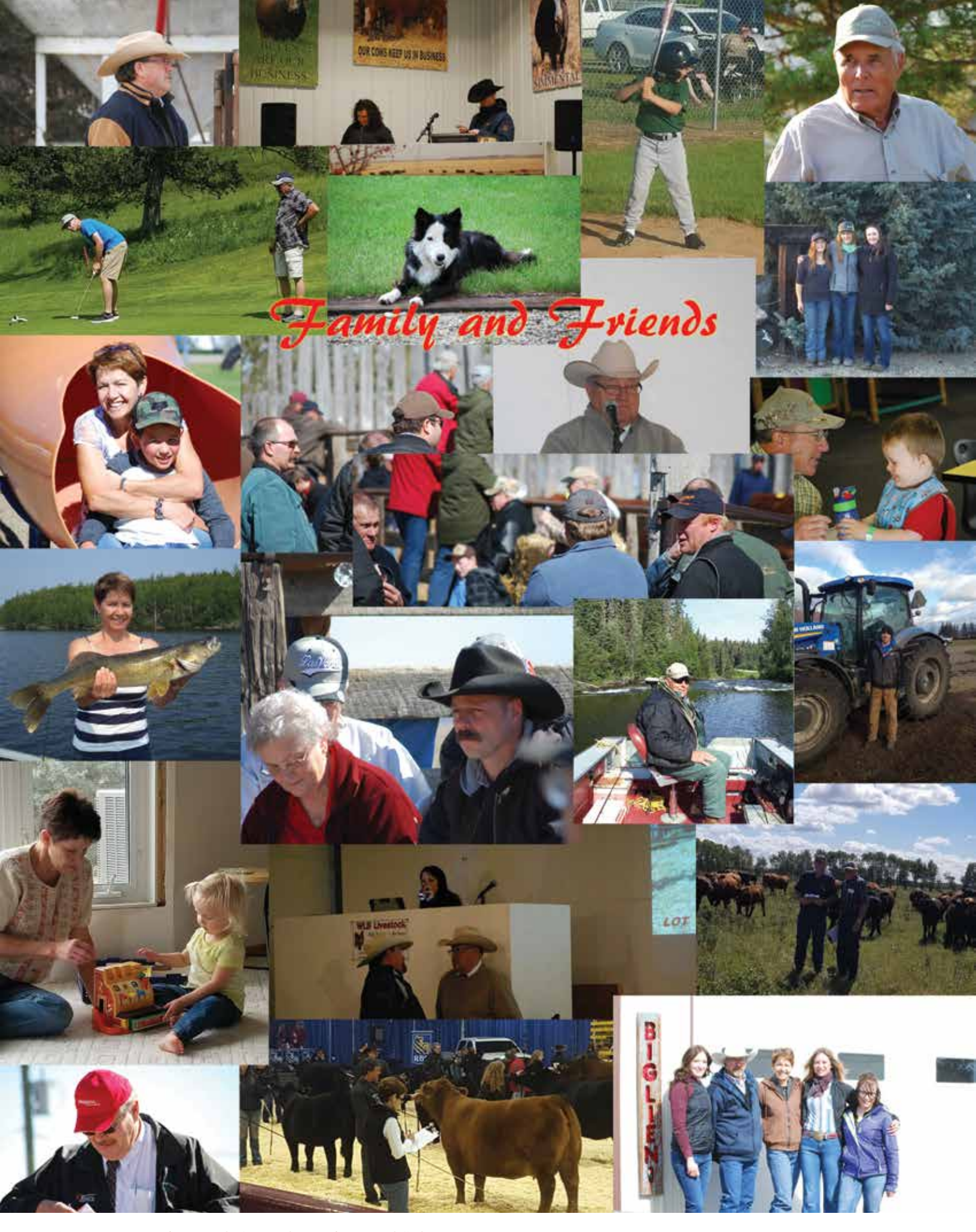
PAGE 44 WLB Livestock Complete Dispersal Sale