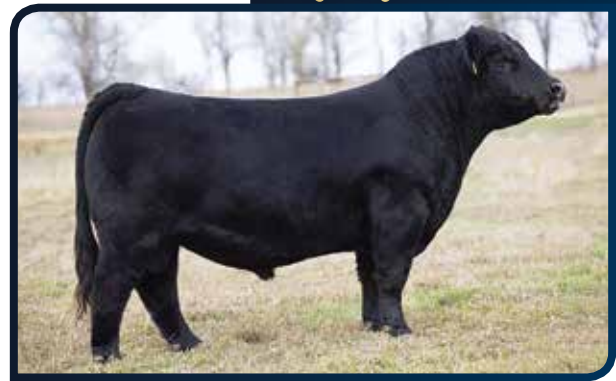
PROFIT - MATERNAL GRANDSIRE OF JVB 79G