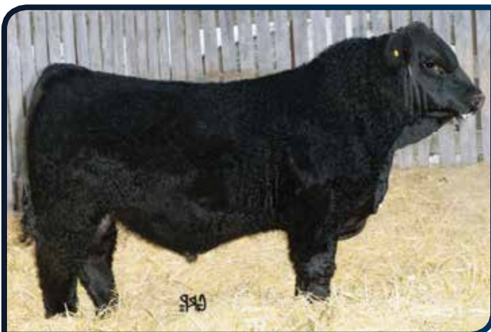
LRX BLACKHAWK 16D - SIRE OF JVB 41F, JVB 11G AND EMBRYOS