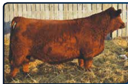
CIRCLE G RED MAGIC 840F - DAM OF PLANTED EMBRYO