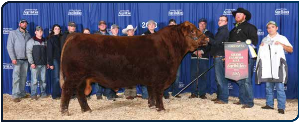
CHAMPION BULL SWAN LAKE RED CIRCUIT 28D - SON OF MAR MAC MISSY 83Y