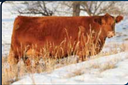
WHEATLAND LAY 3111A - PATERNAL GRANDDAM OF JVB 30G