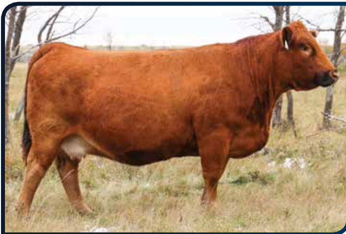
JHSN LULU 33Z - DONOR AND FOUNDATION FEMALE