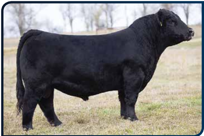
PROFIT - SIRE OF JVB 25G