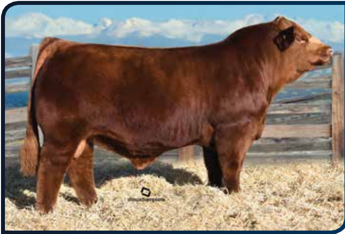
STF CRIMSON TIDE DZ87 - SIRE OF EMBRYOS

Homozygous Polled • Black • She ranks in the top 5% of the breed for Weaning Weight, the top 10% for Yearling Weight and Carcass Weight, the top 15% for Rib-Eye Area and the top 25% for Marbling. • Performance females of this quality are hard to part with. • AI bred to SAS Copperhead G354 on April 3, 2020. Pasture exposed to RPCC Red Geronimo 201G from May 25 to September 1, 2020.