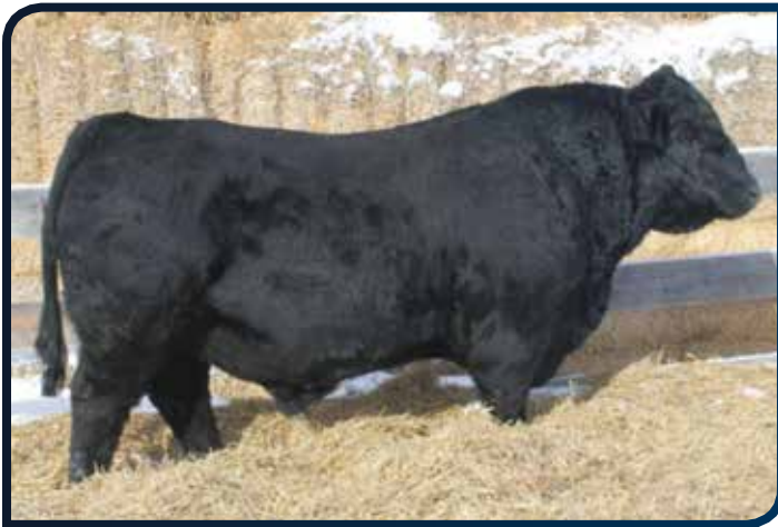
MRL MISSILE 138C - SIRE OF JVB 59G