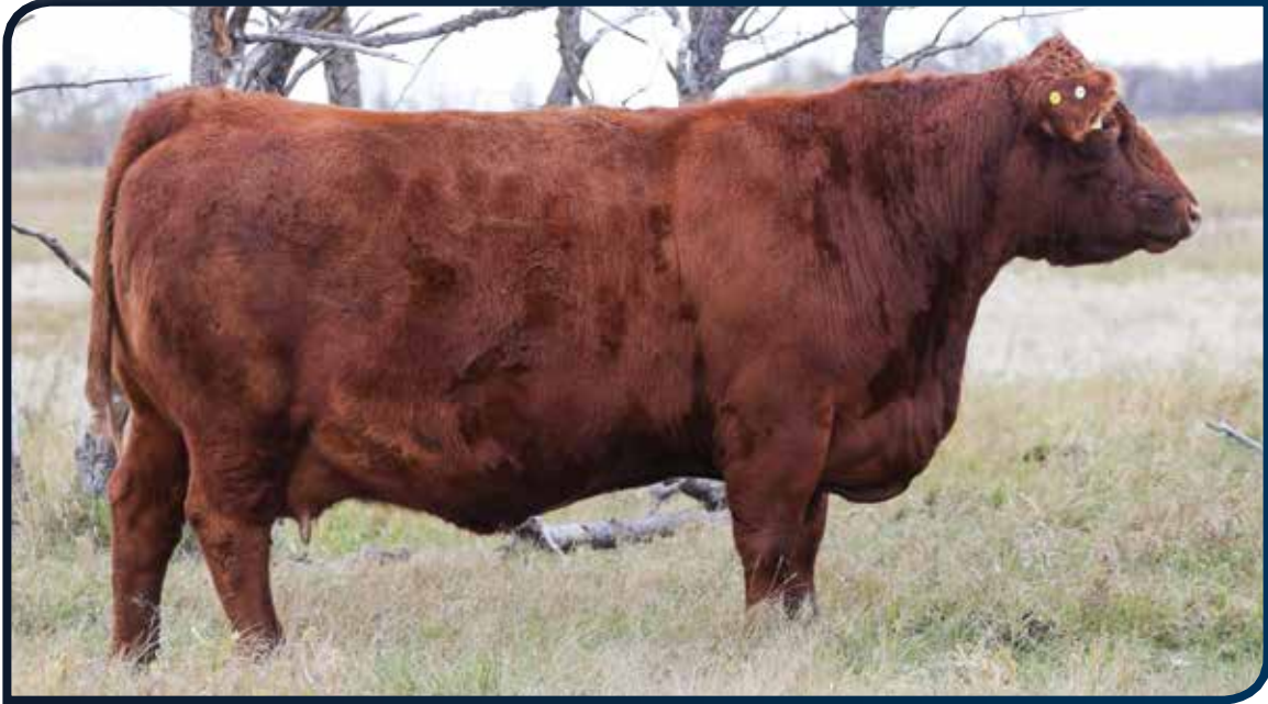
MAR MAC MISSY 63Y - DAM OF CHAMPION BULL SWAN LAKE RED CIRCUIT 28D

Homozygous Polled • Red • This February ET heifer has the genetics to breed winning show stock.