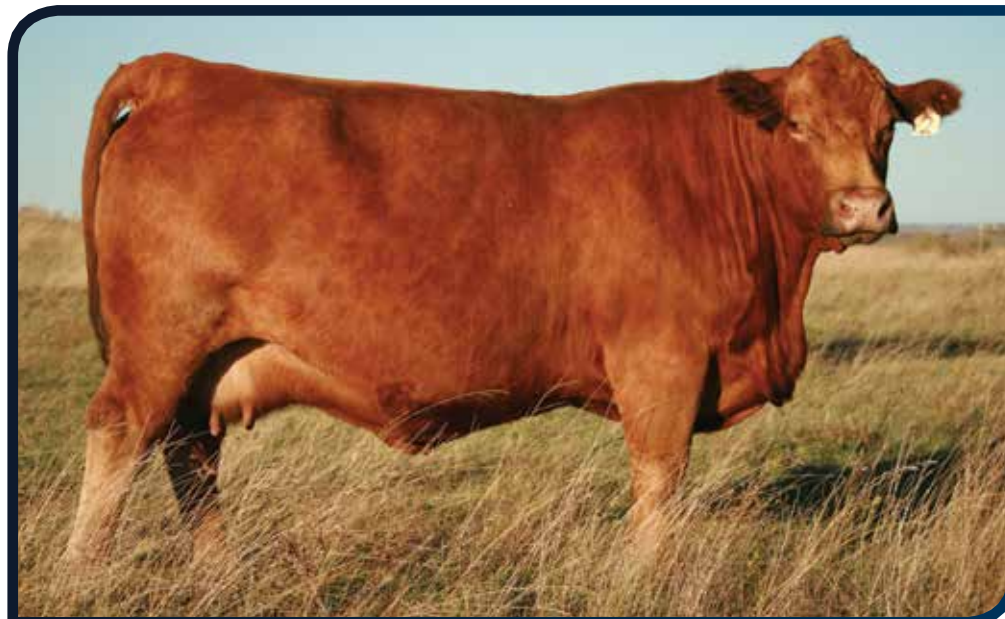
LRX MS 153U - DAM OF JVB 18H