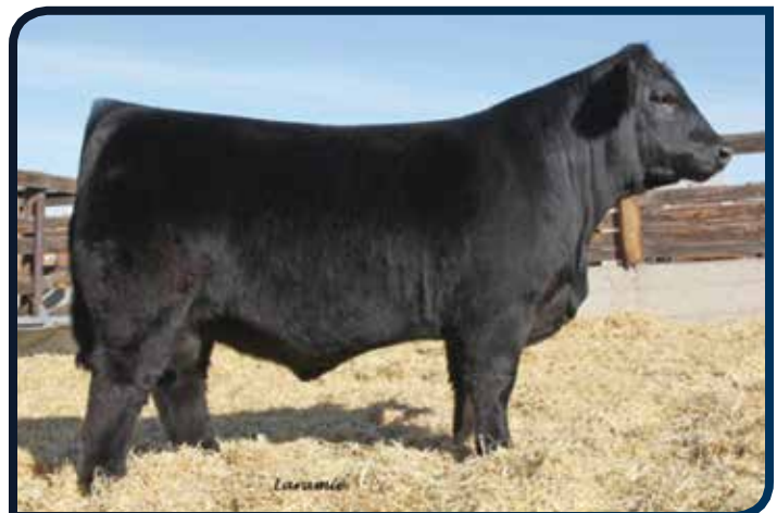
STF ROYAL AFFAIR Z44M