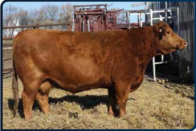
DRAKE CHLOE 14P - MATERNAL GRANDDAM OF JVB 36H