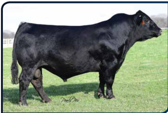
WS PROCLAMATION E202 - SIRE OF JVB 3H