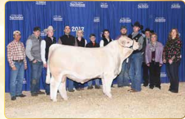
SVY FORTRESS 703E SIRE OF HEIFER CALVES