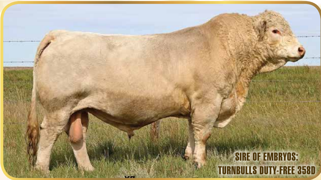
SIRE OF EMBRYOS: TURNBULLS DUTY-FREE 358D