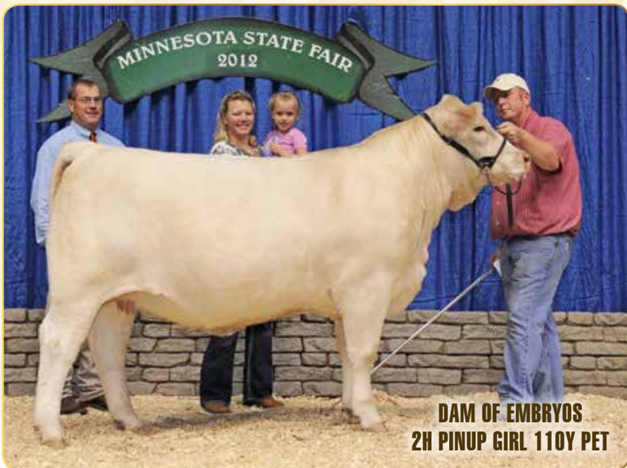
DAM OF EMBRYOS 2H PINUP GIRL 110Y PET