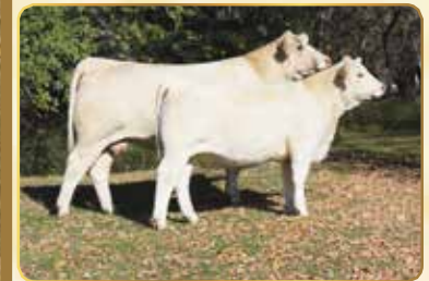
JMB MS WHAT-A GIRL 829F WITH JMB SHANESE 3H