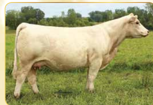
BALDRIDGE ELVIRA 120M ET: MATERNAL GRAND DAM OF 2H PINUP GIRL 110Y PET