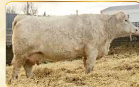
DAM OF EMBRYOS: SOS PRINCESS KATE 33Y