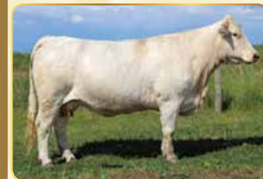
DAM OF SIRE: SKW JAVA 140C