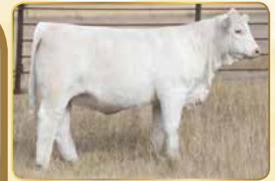
PROGENY OF SOS JESSICA 34B: SOS 145H