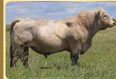
SIRE: WHITECAP EMBARGO 7E