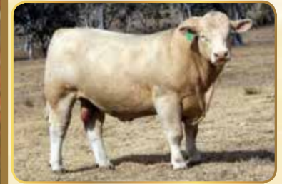
SIRE OF EMBRYOS: PALGROVE HALLMARK