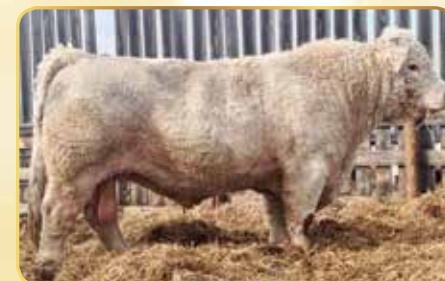
SIRE OF EMBRYOS: WINN MANS CHAVEZ 826Y