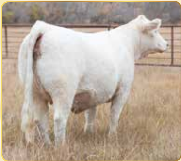
SOS GODDESS PLD 21G