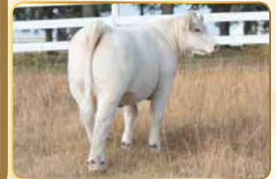
PROGENY OF SOS JESSICA 34B: SOS 17H

NEVER have I EVER been as excited for a set of embryo calves as of 34B's calves this year! 18 calves on the ground, nine bulls, nine heifers and every one is very complete or awesome! They are sired by Escobar or Chuckwagon and the three heifers we will bring to town represent how deep this offering truly is. No matter which one you select, there is no wrong choice and we will help in any way possible to make this decision a fun and profitable one. 34B, herself, is flawless in her makeup; big barreled yet feminine, broody and very fertile. In fact, she averaged over 19 #1 embryos in her five flushes in 2018. Rest assured, she will pass this on to any of her nine daughters you have to pick from. Selection to be made March 1, 2021.