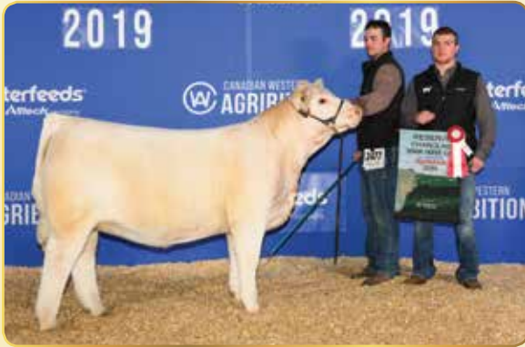
MVY 36G 2019 AGRIBITION RESERVE SENIOR HEIFER CALF CHAMPION AND SECOND HIGH SELLING LOT