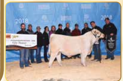
SIRE: SOS APEX PLD 139F