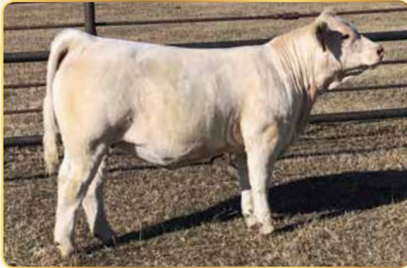
MVY 61H 2020 FORTRESS DAUGHTER