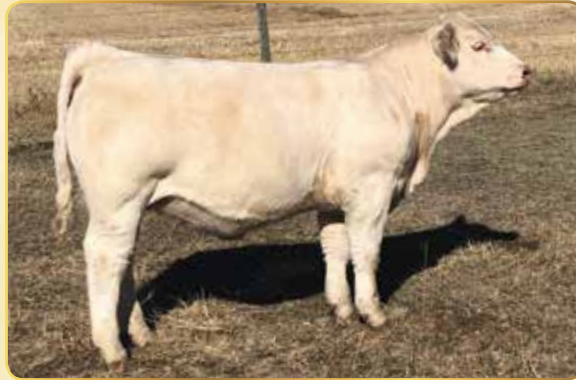
MVY 6H 2020 FORTRESS DAUGHTER