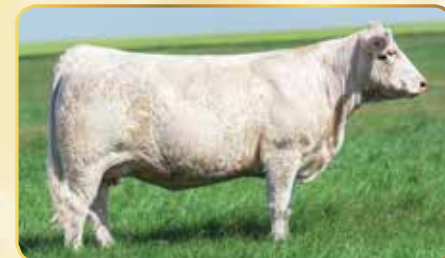
DAUGHTER OF SOS PRINCESS KATE 33Y: SOS DUCHESS 66F