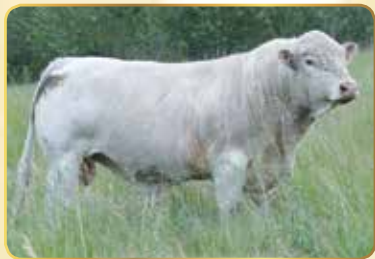
SIRE: REESE DUKE 239D