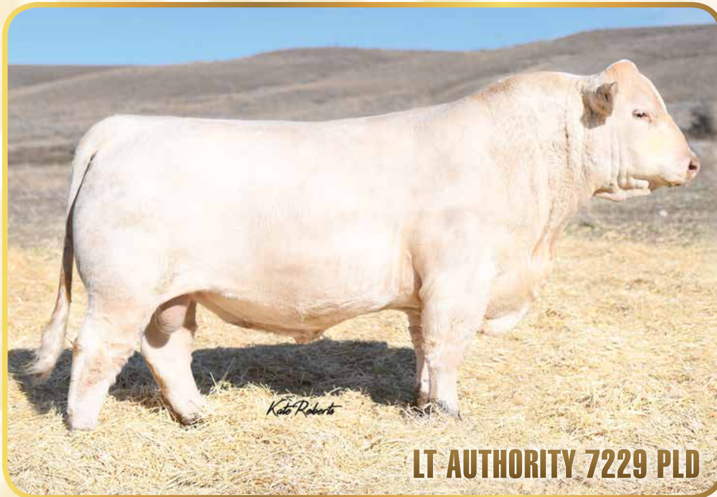
LT AUTHORITY 7229 PLD