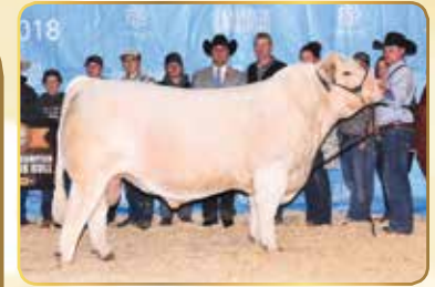
SIRE: SHARODON DOUBLE VISION 1D