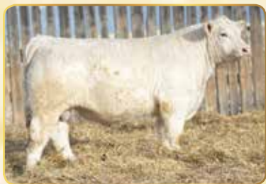
SERVICE SIRE: DYV FOOTPRINTS SIR 35G