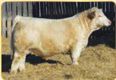
MATERNAL HALF BROTHER: ONL CHILLIN IT 14B