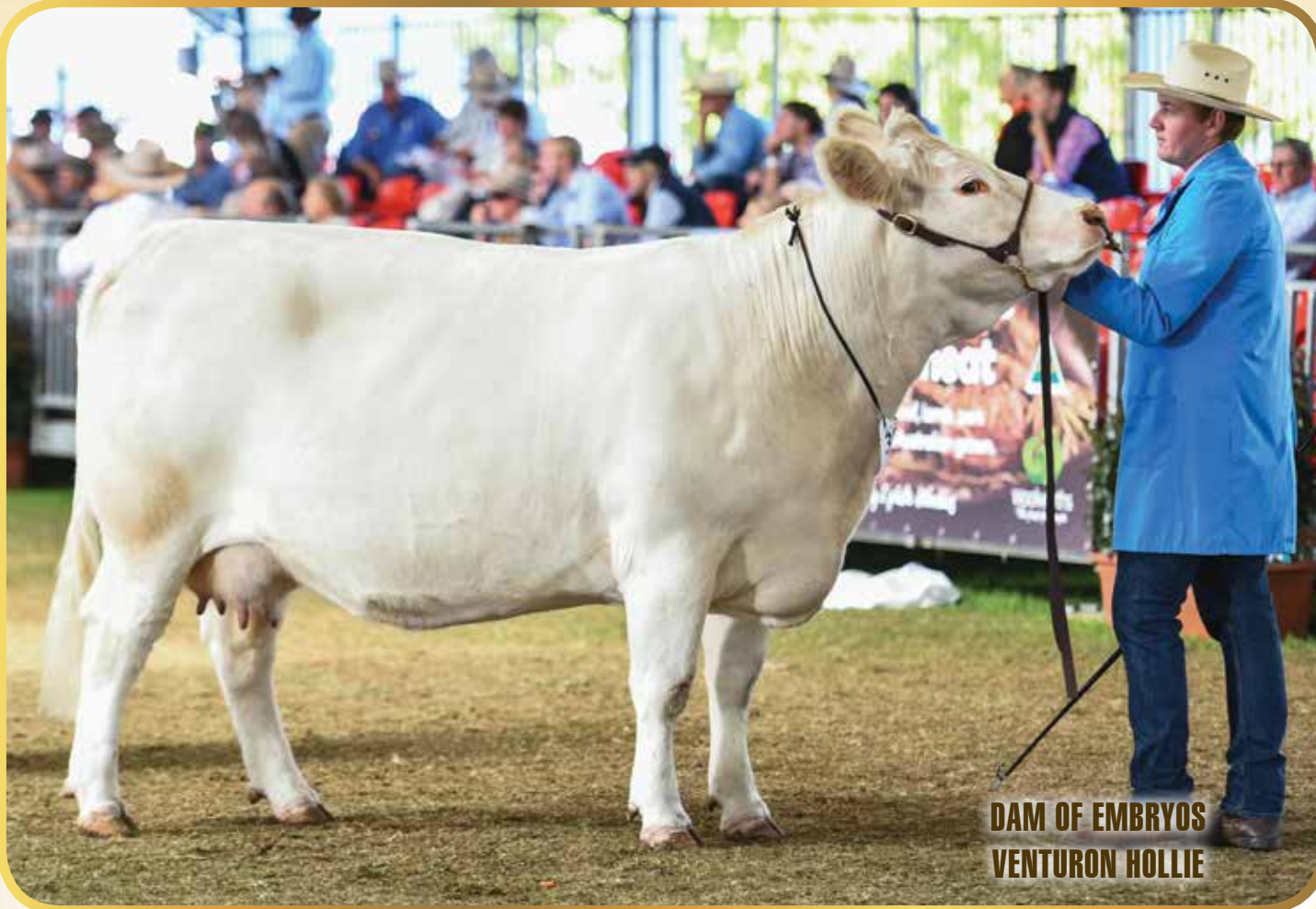
DAM OF EMBRYOS VENTURON HOLLIE