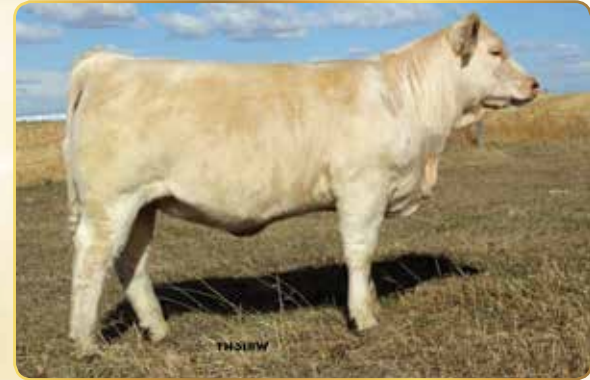
MVY 5H 2020 FORTRESS DAUGHTER

McAvoy Charolais is excited and proud to offer you choice of our entire 2020 Fortress sired heifer calves. From the day we found and purchased Fortress he has done what we thought he was capable of and went on that fall to be Agribition Reserve Champion Bull. In 2019, his offspring took Farm Fair Senior Heifer Calf Champion, Reserve Senior Bull Calf Champion, Breeders Herd and Get of Sire honours. At Agribition they were Semex Charolais Bull Calf Champion, Reserve Senior Heifer Calf Champion and second high selling lot in the sale. Fortress sons are stout, high performing bulls with great feet and legs but we feel his biggest impact is yet to come on the female side. With the Starstuck design they are feminine yet broody and well muscled. The dispositions are terrific and all are polled. Here's your chance to select a Fortress daughter out of our best females.