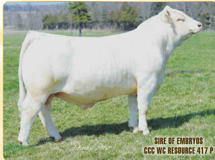
SIRE OF EMBRYOS CCC WC RESOURCE 417 P