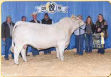
SIRE OF JMB 3H AND SERVICE SIRE OF JMB 829F: RPJ DIESEL 802F