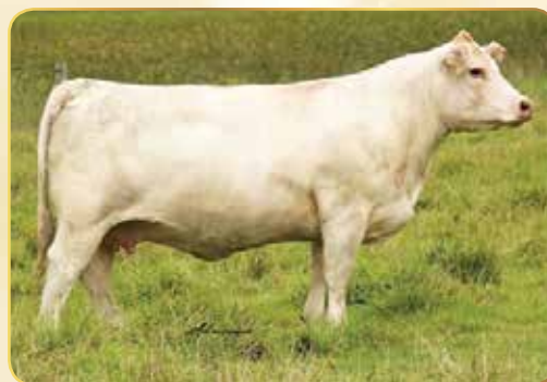
OBG ELVIRA 4303 PLD: DAM OF 2H PINUP GIRL 110Y PET

Stored at Bow Valley Genetics CONSIGNED BY: THE CANADIAN CHAROLAIS YOUTH ASSOCIATION