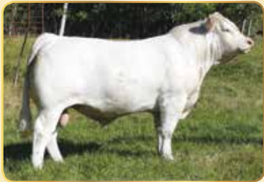
SIRE: JWX FORENSIC 691F