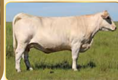
DAM: ROSSO MS ANGORAGAL 111B