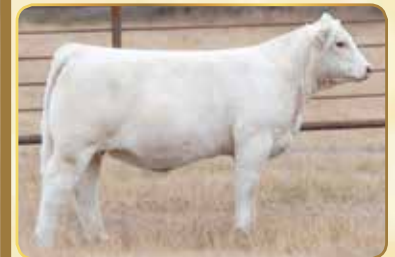
PROGENY OF SOS JESSICA 34B: SOS 158H