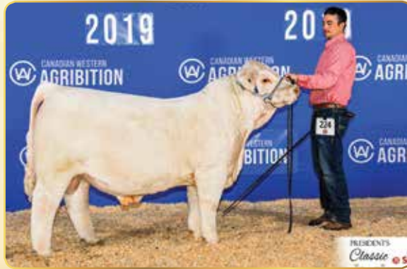
MVY 5G 2019 AGRIBITION SEMEX CHAROLAIS BULL CALF CHAMPION