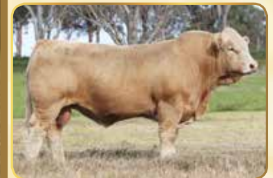
SON OF PALGROVE HALLMARK: PALGROVE PLATINUM P931E, SOLD FOR $48,000 (AUD) AT THE 2020 PALGROVE BULL SALE