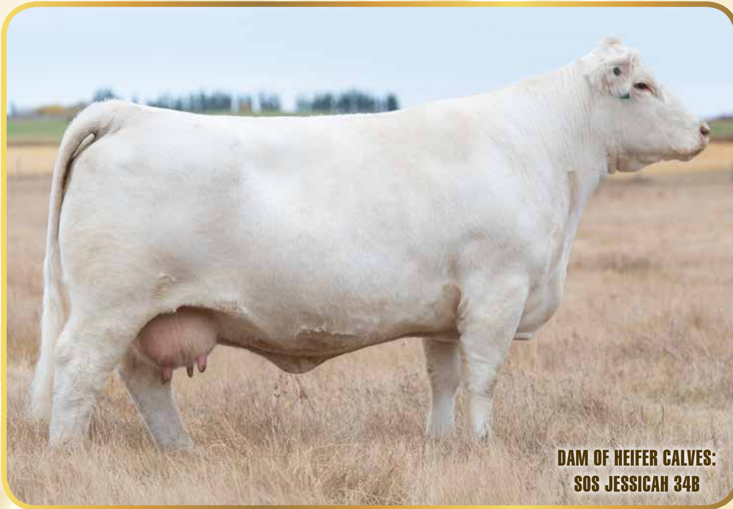
DAM OF HEIFER CALVES: SOS JESSICA 34B