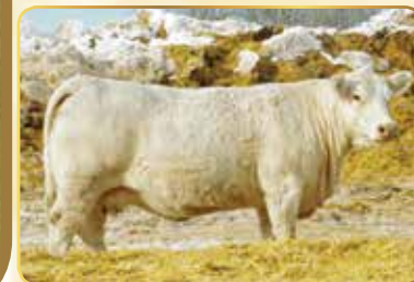
DAM: STEPLER MISS 314B