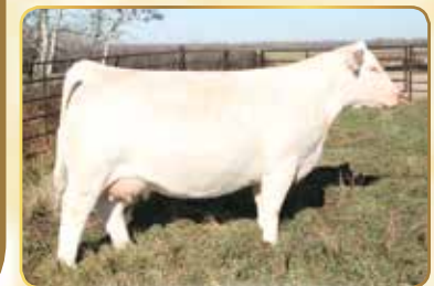
DAM: SVY STARSTRUCK 409B