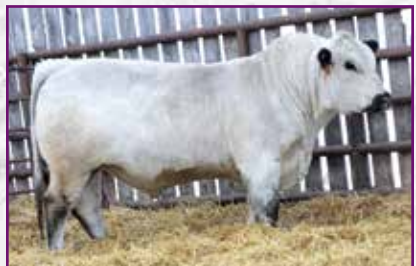
Belmoral's Bommer 6F Full Sibling to 121H