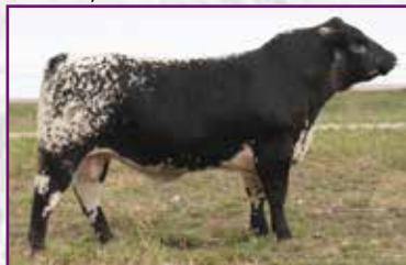
Colgan's General 20G Full Sibling to Embryos