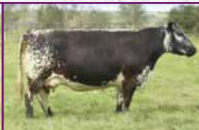
River Hill 54Z By Chance 05B Maternal Sister to 555H