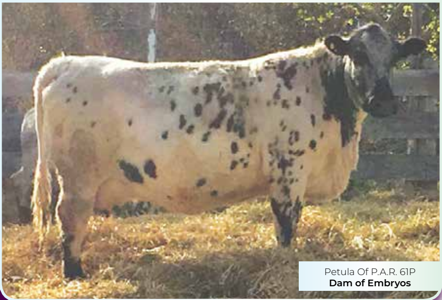
Petula Of P.A.R. 61P Dam of Embryos