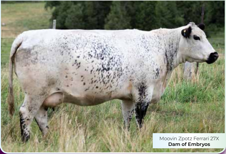
Moovin Zpotz Ferrari 27X Dam of Embryos