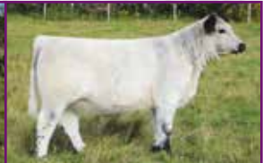
Greenwood Gloria DJP 154G Maternal Sibling to Embryos