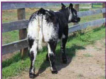
Calico Creek Heiress 102H

Calico Creek Heiress 102H is an extremely attractive heifer. Balance, style, conformation and thickness all contribute towards making her a great candidate for a future show ring female. With a full sister already in production in the Calico Creek herd, we can say with confidence that Heiress will make a great brood cow as well.