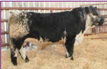
Wilcox Flip 2F Sire

Hop-A-Long is a heifer with lots of performance. She's thick, deep and long bodied. Her dam is a heavy milking female with a good udder. 59H's sire is a bull that we raised. We sold his full sister last year in the Agribition sale to Wrangler Farms. There is lots of power in this family.