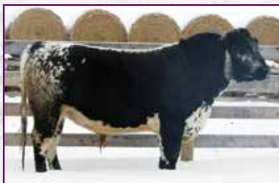
INC Dingo 26D Sire