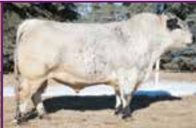
Second Chance Bazinga 2B Sire