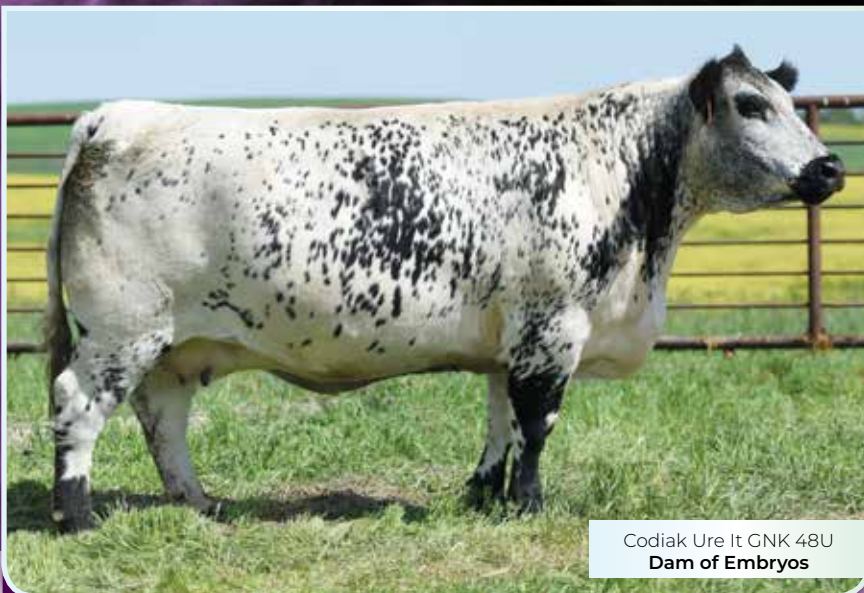
Codiak Ure It GNK 48U Dam of Embryos