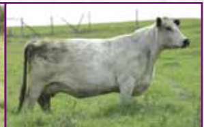
River Hill 50U Xia-Chance 105X Maternal Sister to 555H