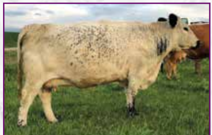
River Hill 60A Cinder 5D Dam