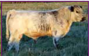
Cash Cow Of P.A.R. 221C