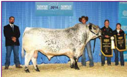
River Hill 60X Line Drive 54Z Sire of Embryos

Guaranteed one pregnancy if implanted by a licensed technician, within two years of purchase.