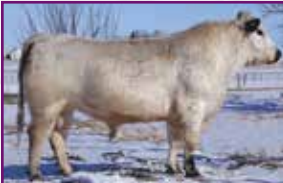
A & W 15R Sire of Embryos

THUNDER 168D LIGHTNING LADY 2Y ASPEN ACRES T.N.T. 4Y SPOTS AND SPROUTS 15Y P.A.R. TOUCH DOWN 600T LANDRY OF P.A.R. 5L P.A.R. ROLLIN STONE 01R RAINA OF P.A.R. 54R