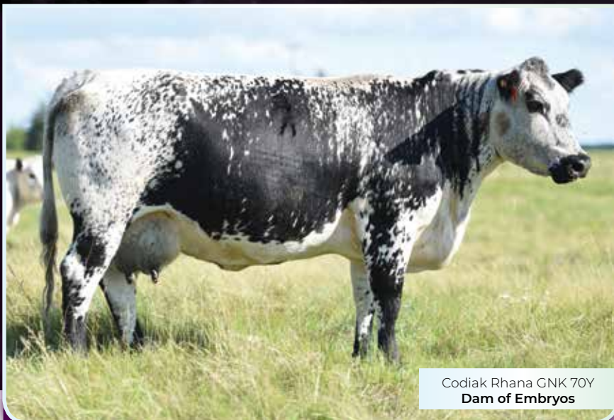
Codiak Rhana GNK 70Y Dam of Embryos