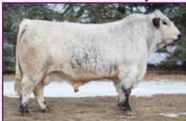
Colgan's Baxter 1B Sire

Stored at Davis-Rairdan Embryo Transplants Ltd., Crossfield, AB.