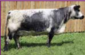
A & W 7Y Dam

Show stopper here! Halo has been a favourite with all our visitors throughout the summer, she has that eye appeal we all desire. Wide topped, big hipped and tons of middle; she is complete from tip to tail. Off our foundation cow; A&W 7Y, she has a promising future ahead. 7Y progeny are as consistent as you can make them. Halo is a maternal sibling to the 2018 Agribition Grand Champion Heifer Calf and Reserve Champion Female, Greenwood First Lady DJP 7F, that sold to Prestwould Parke for $22,000. Whether you're looking for your next front pasture donor or banner chasing show heifer, this is the one.