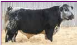
Excalibur 345E Sire of Embryos

Buyer pays shipping from Boviteq, Quebec Canada.