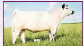
US Secret Service 2H Progeny of Ferrari 27X