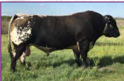
Calico Creek Butane 8B Sire

Here is a young heifer with lots of potential. She has good length of body and width of top. We wanted to show off a calf from the group of cows we purchased from Belmoral Farms. The 153Z cow is a good uddered female that has a good production record. We are using one of her sons, PGE 6F, in our herd.