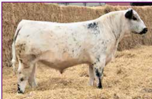
Silver Tip Gomez 50G Sire of Embryos

Here is an opportunity to secure some genetics that are a little different. Crossing the stylish Gomez bull over the powerful Petula donor is sure to be a potent combination.