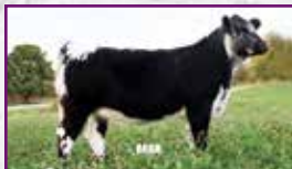
Underhill Eureka 3E Progeny of Ferrari 27X