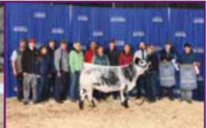
Greenwood First Lady DJP 7F Maternal Sibling to 8H