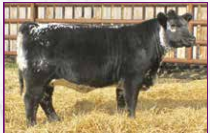
Wilcox Show Girl 12G Full Sibling to Sire