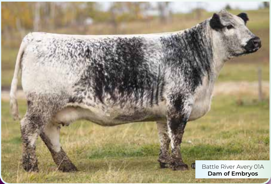
Battle River Avery 01A Dam of Embryos