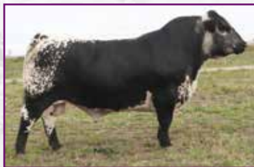
Colgan's Frasier CF 11F Full Sibling to Embryos