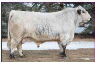
Colgan's Baxter 1B Sire

Stored at Davis-Rairdan Embryo Transplants Ltd., Crossfield, AB.