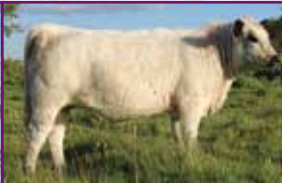
Greenwood Honeysuckle 53H Maternal Sibling to Embryos