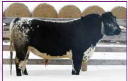
INC Dingo 26D Sire