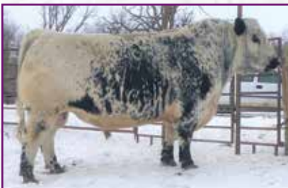
Flying E Digger 4D Sire

Cinder 65H is a heifer that has a lot going for her. She has lots of body mass with eye appeal. Her dam is a big barreled female with lots of thickness and a great udder. There is a very limited amount of offspring off the Flying E Digger bull as he went down suddenly. Digger has left very sought after offspring.