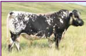
Codiak Capitaine GNK 5C Sire

Take a chance on an Heirloom out of the Cinder line. A proven cow family with noteworthy udders, maternal traits and longevity. A stylish, foundation type female that will easily move into the front pasture.