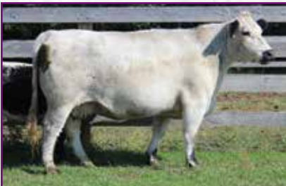
Calico Creek Day Dream 8D Dam

Here is another exciting INC Dingo daughter that exhibits that stylish look that the Dingo calves are known for. With her dam being my good "Day Dream" cow, Heirloom 108H has all the assets to follow in her dam's footsteps.