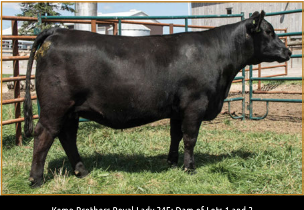
Kemp Brothers Royal Lady 24E: Dam of Lots 1 and 2