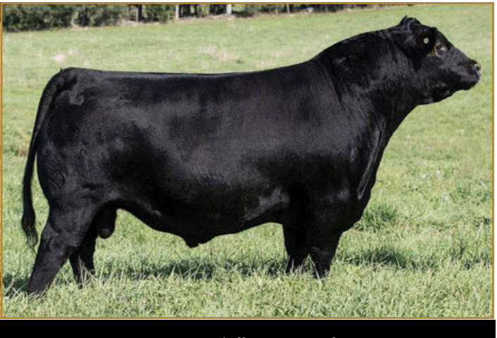
Lazy JB Compound Effect 6011 - Sire of Lot 49

S A V HERITAGE 6295 S A V EMBLYNETTE 7749 B C C BUSHWACKER 41-93 S A V MAY 7238 S A V BRILLIANCE 8077 PVF MISSIE 790 S A V FIRST CLASS 0207 LEGEND LANE BARDETTA 824U