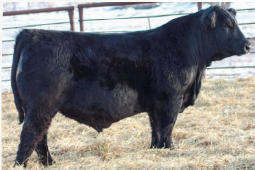
W/C Relentless 007G