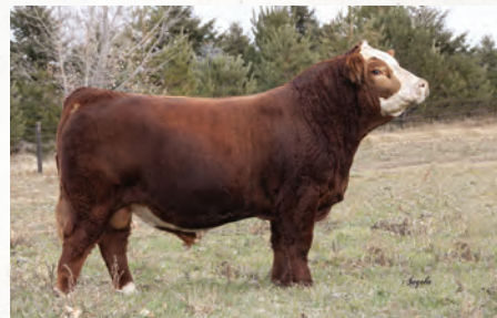
Felt Last Call 304F