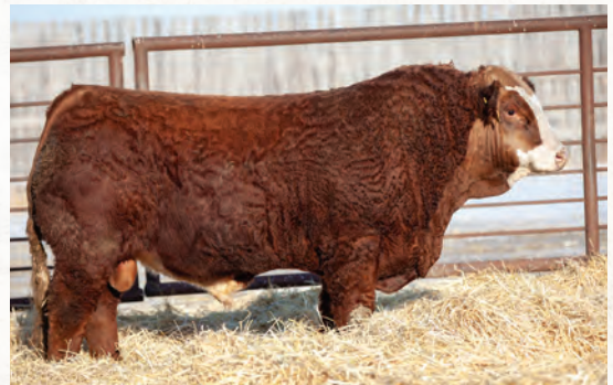
Double Bar D Batman 216E