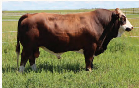
Anchor D Motown 865E - Sire