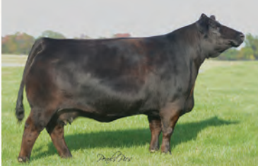
Wheatland Lady 822U - Granddam