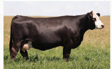
Swan Lake Pepsi 97A - Grandam