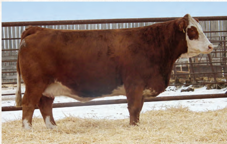
Double Bar D Adora 148X - Dam

A special opportunity to appraise a very good homo polled Fleckvieh female that has a very complete genetic profile along with excellent phenotype on a very correct structure. Her dam, Adora 148X, is a superior polled Fleckvieh cow with exceptional rib shape and depth with a very good functional udder. Her granddam Adora 224S is quite possibly the fleck foundation cow with most volume and mass to ever walk the pastures here at Double Bar D. Adore 48H checks many of the boxes in the Fleckvieh industry – homo polled, colored right, built right and has a cool genetic makeup!