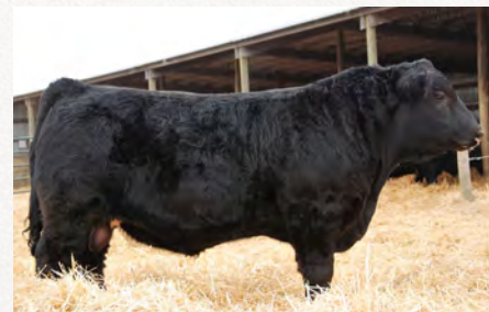
MBJ 137E - Son