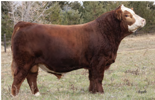
Felt Last Call 304F