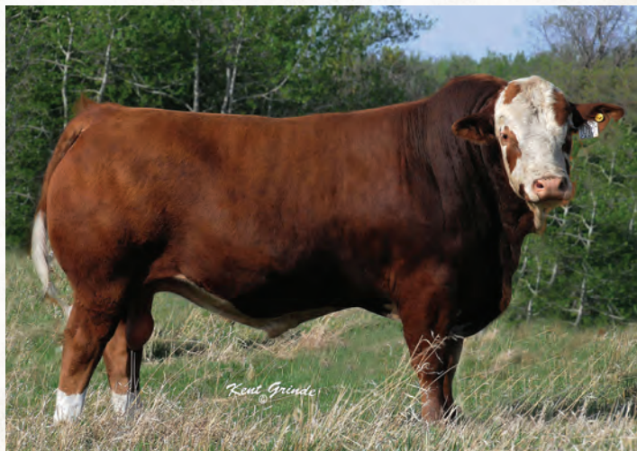
Grinalta's HP Sensation FF909D

Donna 123C is an exceptional, robust powerful built cow. She is very tanky yet possesses good eye appeal. She is polled and her guaranteed polled progeny from Sensation FF 9090D will be highly marketable. Her Adonis 603N sired dam, 535S, produced till she was 13 years of age while maintaining a very sound udder.