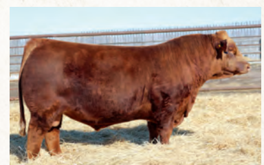
KWA Law Maker 59C - Sire