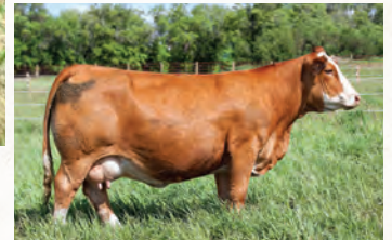
RLD 147A - Daughter

MFI WHISTLER 47L GIBBONS JEREMIAH RHY EVIE 62C