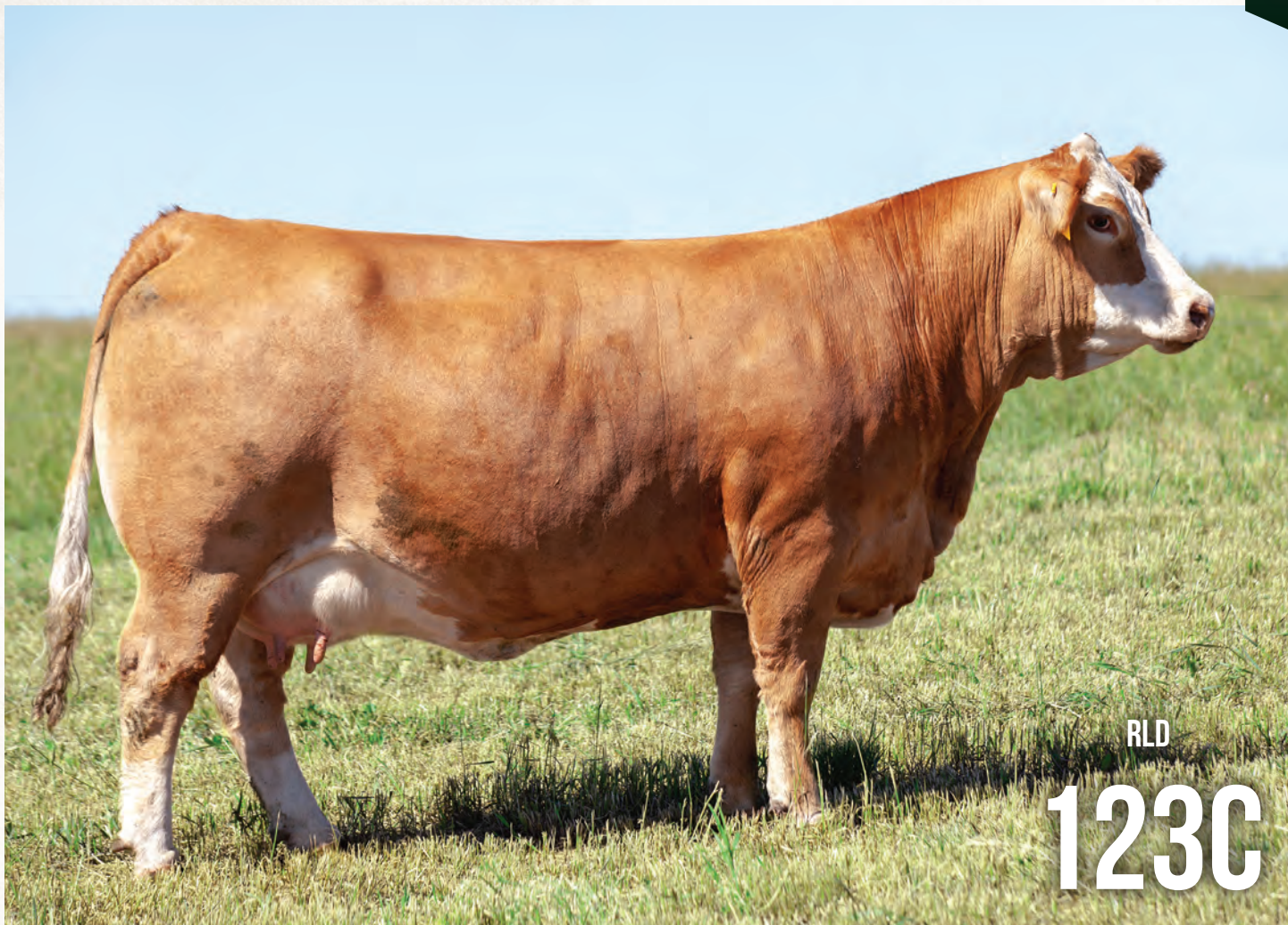
Polled Full Fleckvieh