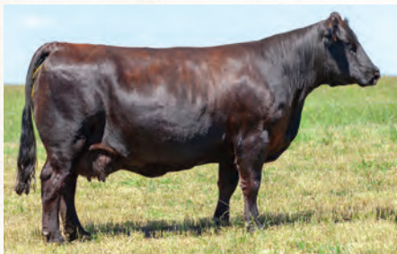
Double Bar D Galaxy 101X