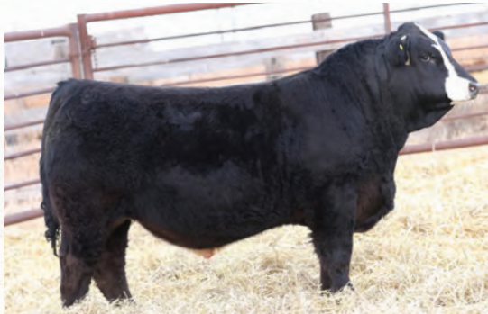
WFL Scarface 71E