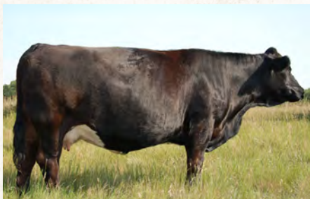
Springcreek Beauty 17U - Dam