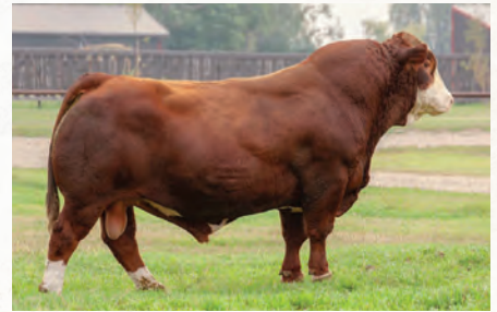
JB CDN Washington 1476 - Sire