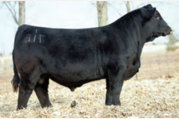
Rubys Turnpike 771E - Sire