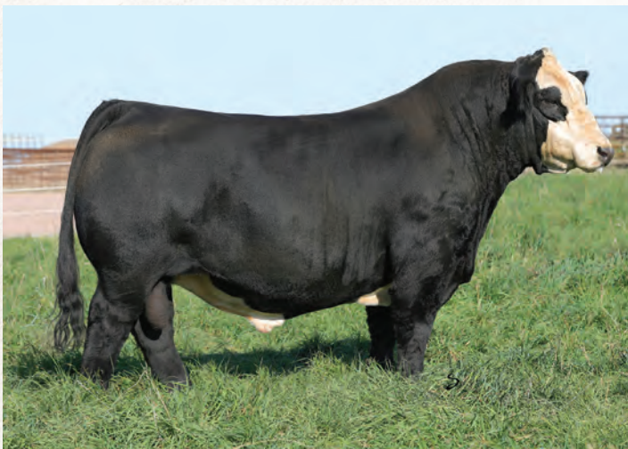
W/ C Bankroll 811D