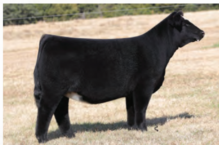
761E Pictured as a calf

Qualified for USA/CAN/AUS. Guaranteed one (1) pregnancy if implanted by a certified technician.