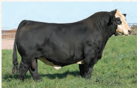
W/C Bankroll 811D

Preg Checked safe. Vet opinion is to AI breeding.