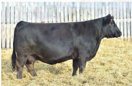
Springcreek Blk Tess 73T - Granddam