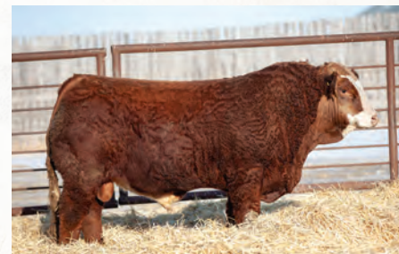
Double Bar D Batman 216E - Service Sire