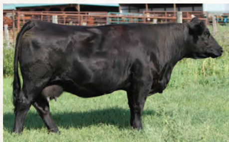
LFE Heaven Sent 30X

After keeping the McDavid semen exclusive since he was purchased for $95,000 from Lewis Farms, I have now decided to share his direct influence with the Canadian industry. The acceptance of his first sons to sell was tremendous. 'Denali' was sold to Doll Ranch for $46,000, 'Tesla' sold to Rocky Meadow Ranch for $30,000 and 'Duramax' sold to Silver Lake for $24,000. Fifteen sons sold in my 2018 sale, averaging nearly $13,000. Many sons have sold to progressive commercial operations such as Geisler Cattle Co. and K5 River Ranch. They have multiple sons and they are very happy with the increased performance in their calves.