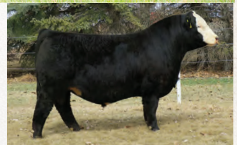
Wheatland Man O' War 907G

Here is a well anticipated mating! The consistency of Brett 454B, as she works extremely good with whoever we mate her to, with the excitement of the all time high seller, Wheatland Man O' War.