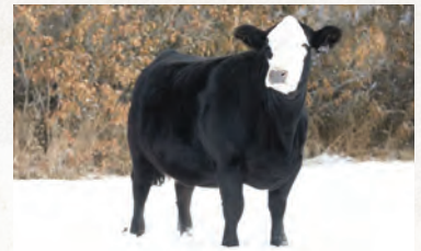
Double Bar D Pepsi 436E - Dam