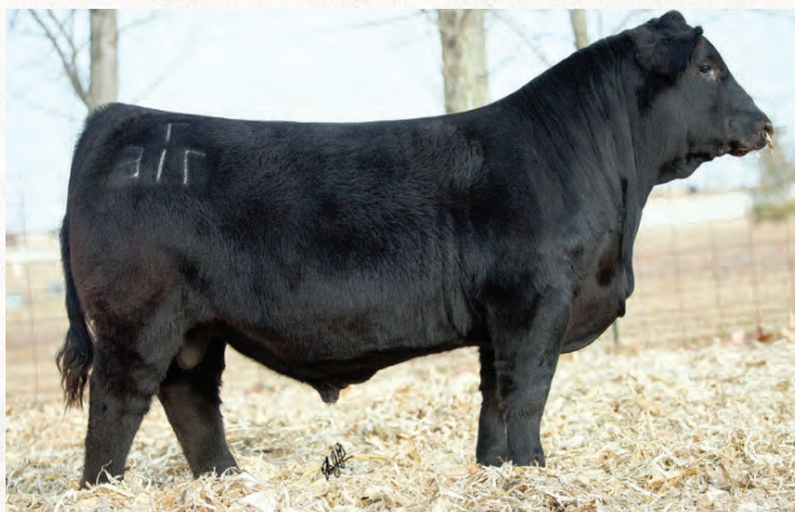
Rubys Turnpike 771E -Sire

Preg Checked safe. Vet opinion is to AI breeding.