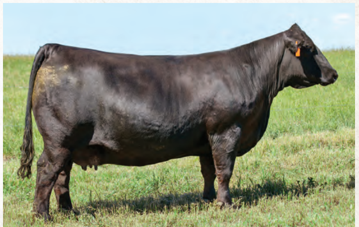
RLD 417A - Granddam