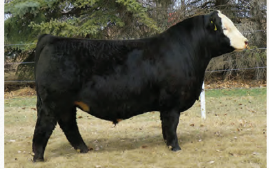
Wheatland Man O' War 907G