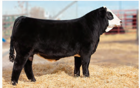
Double Bar D Bankroll 507F