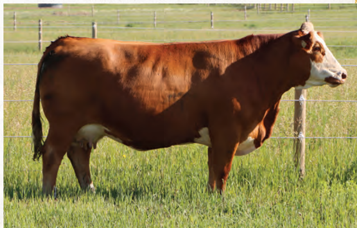
FGAF Barbarella 193B - Dam

Barbarella 40H is a chip off the old block of her dam, Barabrella 193B, who has emerged herself as a leading Fleckvieh donor here at Double Bar D. Watching her sire sell at Ferme Gagnon 2019 Bull Sale to Beechinor Brothers I knew I had to secure a semen pack. 40H possesses great heart, girth and rib shape on a sturdy and correct structure.