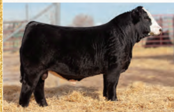
Double Bar D Annuity 635F

Qualified for CAN/USA/AUS. Guaranteed Two (2) pregnancy if implanted by a certified technician.