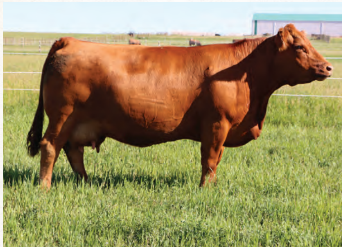
Double Bar D Gina 414Z

Qualified for USA/CAN. Guaranteed one (1) pregnancy if implanted by a certified technician.