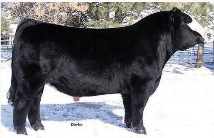
Mr HOC Broker - Sire

A real excellent opportunity to tie into an awesome cow family with this March born Broker heifer calf. Stylish to the core and very correct and sound in structure.