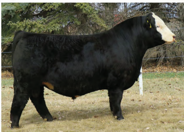
Wheatland Man O' War 907G