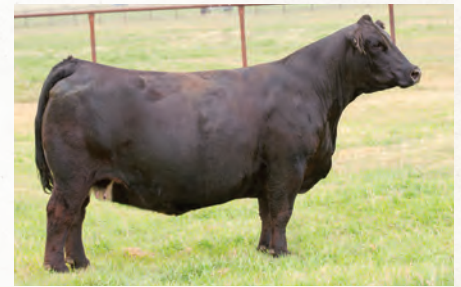
RLD 454B Dam of Lot 3 & Granddam of Lot 4