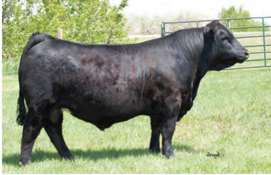
Rust Primetime 507G