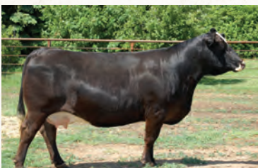
Miss M&S Black Ice 10N - Granddam

A very typey Proclamation daughter that possesses a ton of shape. Dam is a first calver that was purposely held back at Double Bar D For her awesome phenotype and pedigree – Bankroll x Power Drive combination.