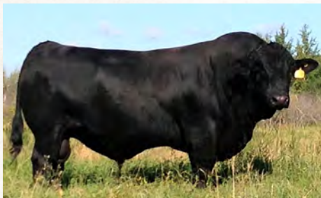
Springcreek All In 155Y - Sire