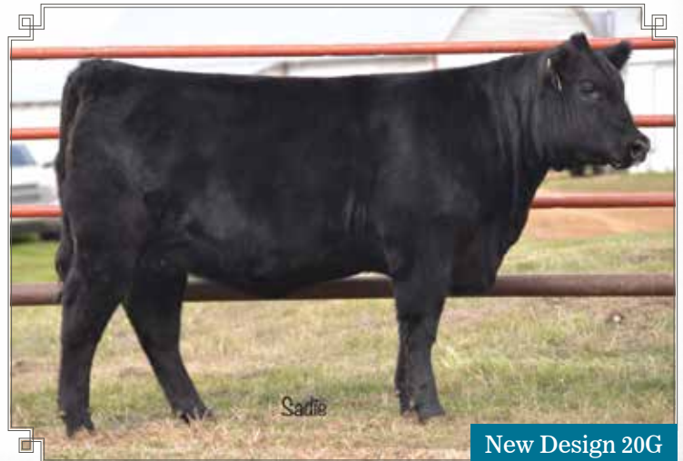
New Design 20G

Consigned By Sunny Grove Angus, Radville, SK