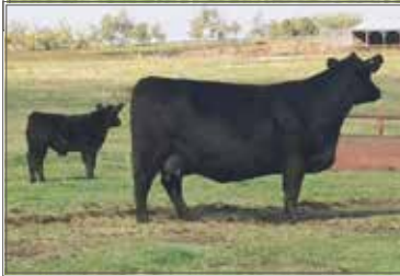
Young Dale Pollyanna 73Z

Consigned By Young Dale Angus, Carievale, SK