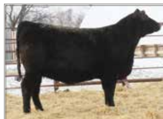
Young Dale Pollyanna 101E Daughter of RYA 73Z Sold to CMT Farms