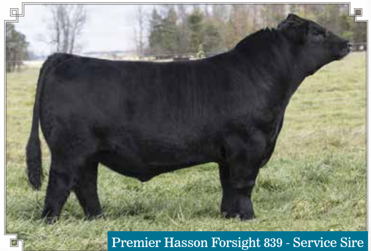
Premier Hasson Forsight 839 - Service Sire

Consigned By Mainstream Genetics, Watrous, SK