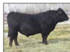
Premier Hasson Felix 811F Service Sire

Bootis Lady 9F is from one of our favourite Bismarck daughters, which will fit into any program. Her mother is an easy calver and always brought home a great calf. Bootis Lady 9F is due early March and is bred to Premier Hasson Felix 811F, son of Dameron First Impression, that we purchased from Ontario.