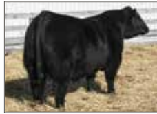
PFLC Insight 94D Sire of both Ramrod Lots

Consigned By Ramrod Cattle Co. Medora, MB