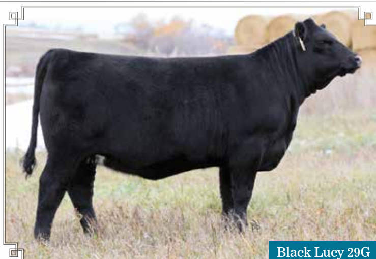
Black Lucy 29G

Consigned By Legaarden Livestock, Grandview, MB