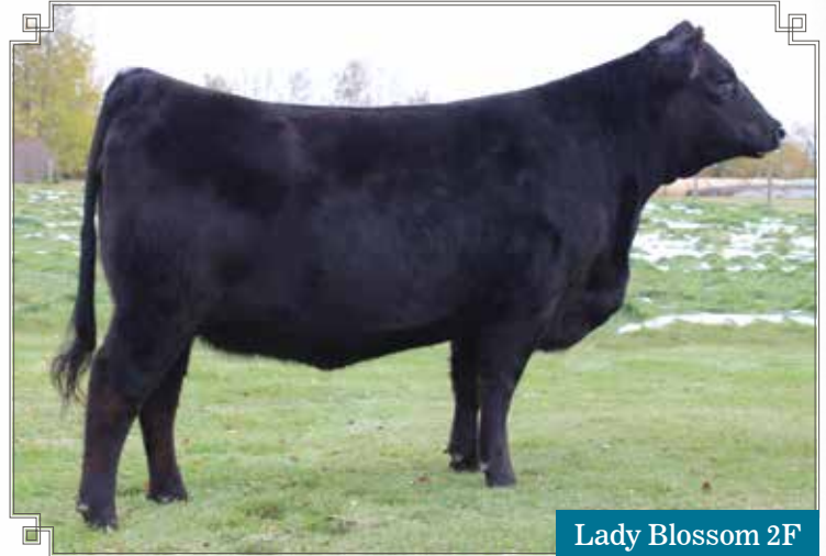
Lady Blossom 2F

Consigned By Stewart Cattle Co., Russell, MB