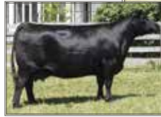
Legend Lane Bardetta 824U Paternal Granddam of both Ramrod Lots