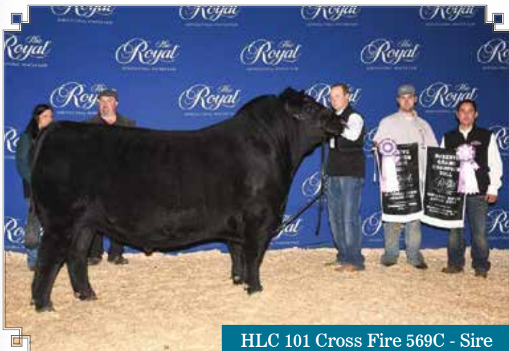
HLC 101 Cross Fire 569C - Sire

SANKEYS JUSTIFIED 101 HLC 101 CROSS FIRE 569C JL CHARISE 3159 S A V BRILLIANCE 8077 PFLC ANNE 39B BABY BLACK LO ANNE