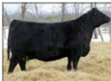
Young Dale Grace 169B - Dam

BW: 2.9 WW: 51 YW: 89 MM: 26 TM: 52 MCE: 6.5