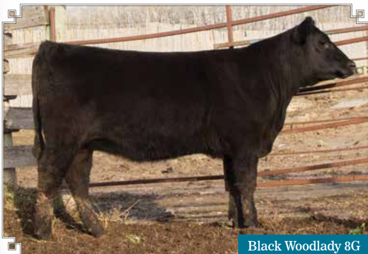
Black Woodlady 8G

S A V HARVESTOR 0338 EF TITAN 545 EXAR BLACKBIRD 5877 S A V HERITAGE 6295 S A V EMBLYNETTE 7749 SCHURRTOP MC 2500 EXAR BLACKBIRD 4448 SHIPWHEEL MONTANA 2600 N7'S BLACK WOODLADY 54D N7'S LADY WORTH 5W S CHISUM 6175 DR J MS WIDE TRACK 374 M15 S A V NET WORTH 4200 N7'S BLK WOOD LADY EXT 91K