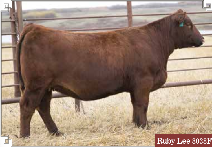
Ruby Lee 8038F

RED BENCHMARK BETTER BEE RED SIX MILE KILL SWITCH 135Z RED SIX MILE FLOWER 424U RED MCRAES CUB 43T RED MAR MAC RUBY LEE 59A RED MCRAES RUBY LEE 169X RED BASIN EXT 45T5 RED FAYETTE OF BENCHMARK 424 RED 6 MILE GIBSONS FINEST 771S RED SIX MILE FLOWER 713S RED MLK CRK CUB 722 RED MCRAE'S KERRY 61R RED COCKBURN RIBEYE 346U RED MCRAE'S RUBY LEE 48U