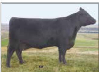
Young Dale Pollyanna 22P Great Granddam of RYA 73Z

Selling open and ready to be flushed. Reserving the right to share a successful flush.