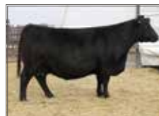
Young Dale Grace 126Z Dam

BW: 83 lbs. ADJ WW: 595 lbs. ADJ YW: 1059 lbs. BW: 3.4 WW: 58 YW: 84 MM: 24 TM: 53 MCE: 6.0