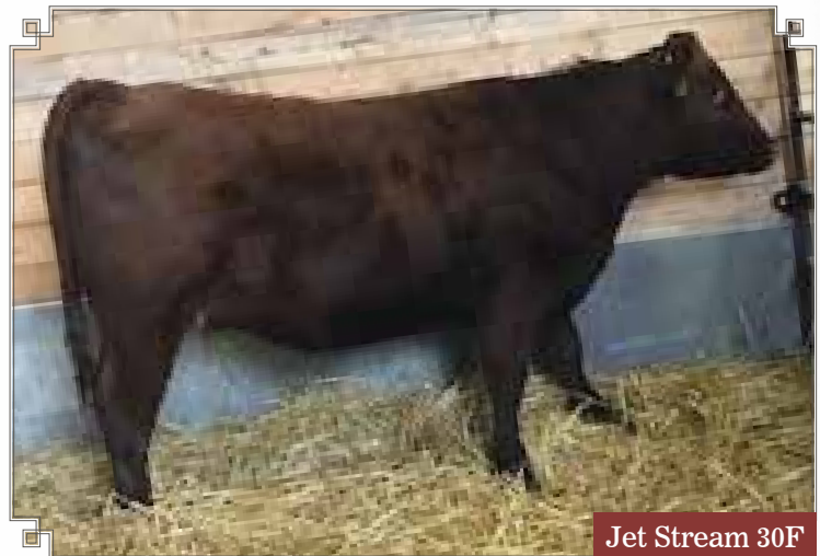
Jet Stream 30F

Consigned By Prime Ridge Stock Farms, Fisher Branch, MB