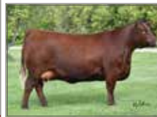
Red Wilbar Helga 211E Full Sister

BW: 3.2 WW: 46 YW: 72 MM: 23 TM:46 MCE: 4.0