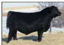
Six Mile Fort Knox 27F Service Sire