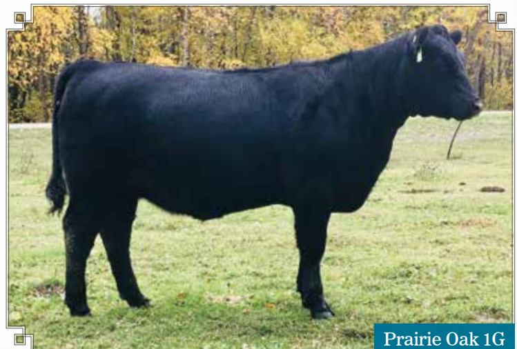
Prairie Oak 1G

Consigned By Diamond D Ranch, Rossendale, MB