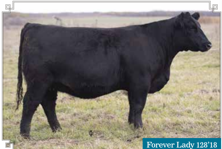
Forever Lady 128'18

Consigned By Eastondale Angus, Wawota, SK