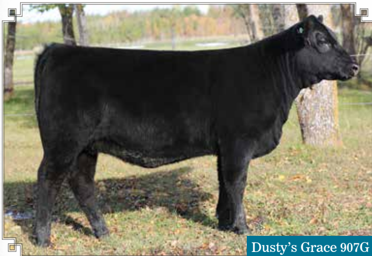
Dusty's Grace 907G

S A V HARVESTOR 0338 SA V CUTTING EDGE 4857 S A V BLACKCAP MAY 5530 S A V HERITAGE 6295 S A V EMBLYNETTE 7749 B C C BUSHWACKER 41-93 S A V MAY 7238 HOOVER DAM P F QUEEN MOTHER 446 YOUNG DALE GRACE 169B YOUNG DALE GRACE 107W YOUNG DALE PANARAMA 66T YOUNG DALE GRACE 14P