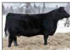
Jaymarandy Grace 640D Maternal Sister

BW: 2.9 WW: 51 YW: 89 MM: 26 TM: 52 MCE: 6.5