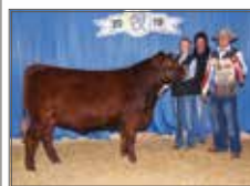
Red Rooke Fran 170F Junior Show Champion Heifer Ag Ex 2019