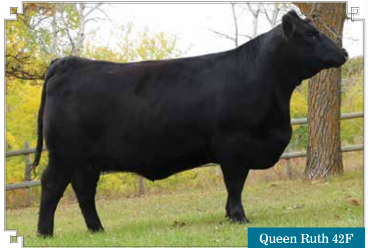
Queen Ruth 42F

Consigned By Anderson Cattle Company Inc., Swan River, MB