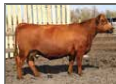
Red For's Cindy 50W Dam

(PE) BW: 2.7 WW: 37 YW: 65 MM: 21 TM: 39 MCE: 7.5