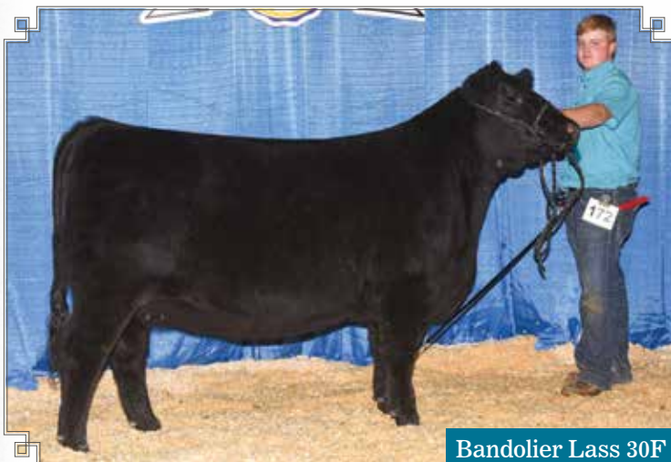
Bandolier Lass 30F

MOGCK BULLSEYE BRUNS BLASTER BALDRIDGE BLACKBIRD 11 BAF MOGCK SURE SHOT MOGCK MARY 1255 CONNEALY RIGHT ANSWER 746 BALDRIDGE BLACKBIRD 549 BAF CONNEALY THUNDER KEMBAR EILEEN 53P MVF EXTRA 85R HBH BANDOLIER LASS 14R