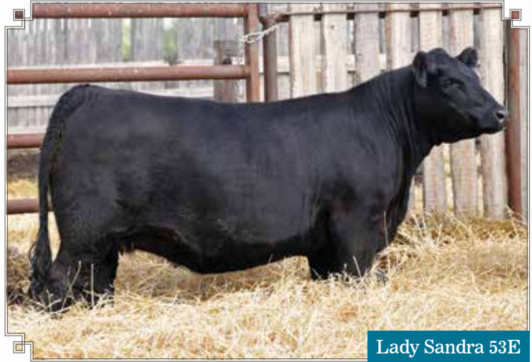
Lady Sandra 53E