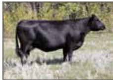
Young Dale Lady Sandra 177A Dam of Lots 50A & 50B