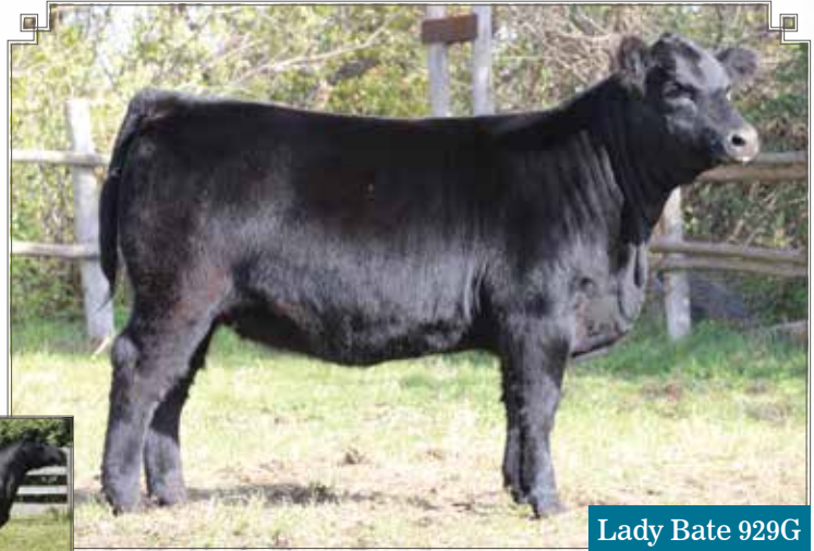
Lady Bate 929G