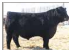
Young Dale Fine Tune 9F Service Sire

BW: 89 lbs. ADJ WW: 582 lbs. ADJ YW: 991 lbs. BW: 4.4 WW: 50 YW: 86 MM: 20 TM: 45 MCE: 6.0