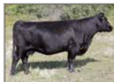
Young Dale Pride 157B Dam