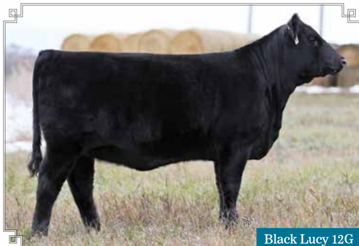
Black Lucy 12G

Consigned By Legaarden Livestock, Grandview, MB