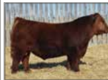
Red Cockburn Assassin 624D Service Sire

BW: 2.4 WW: 46 YW: 80 MM: 15 TM: 38 MCE: 3.0