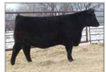
Young Dale Pollyanna 38E Maternal Sister of RYA 73Z Sold to Double Bar D & Dusty Rose