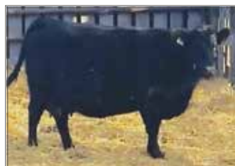
Young Dale Pollyanna 30U Dam of RYA 73Z