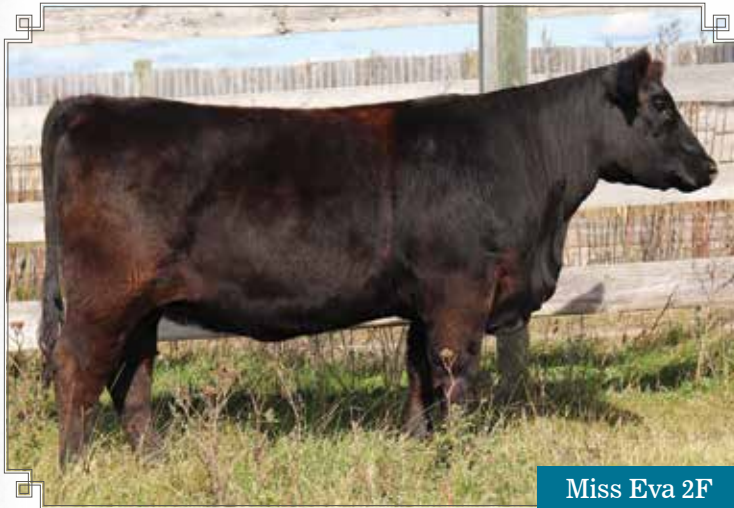
Miss Eva 2F

MOGCK BULLSEYE BRUNS BLASTER BALDRIDGE BLACKBIRD 11 BAF BELVIN TRES MARIAS PATRON 205 N7'S EVA MARIAS 12A MVF MISS EVA 195S MOGCK SURE SHOT MOGCK MARY 1255 CONNEALY RIGHT ANSWER 746 BALDRIDGE BLACKBIRD 549 BAF ALSTON 5384 CATRIEL F TRES MARIAS6764 ROSANEGRA 5214 WESTERN WIDESPREAD 1L MVF MISS EVA 12L