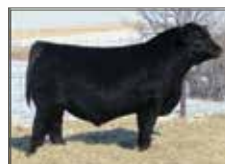
Six Mile Fort Knox 27F Service Sire

BW: 90 lbs. ADJ WW: 570 lbs. ADJ YW: 1041 lbs. BW: 5.2 WW: 50 YW: 93 MM: 21 TM: 46 MCE: -1.0