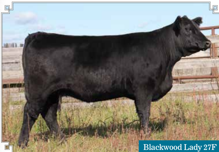
Blackwood Lady 27F

N7'S ELVIS 9Y NYK GRACELAND 39B SOO LINE GEORGINA 1101 S A V RESOURCE 1441 N7'S BLACK WOODLADY 46D N7'S BLK WOODLADY 7X SITZ UPWARD 307R MVMM BLOSSOM 250U HF KODIAK 5R SOO LINE GEORGINA 9371 RITO 707 OF IDEAL 3407 7075 S A V BLACKCAP MAY 4136 TC STOUT 407 N7'S BLKWOOD LADY 82U