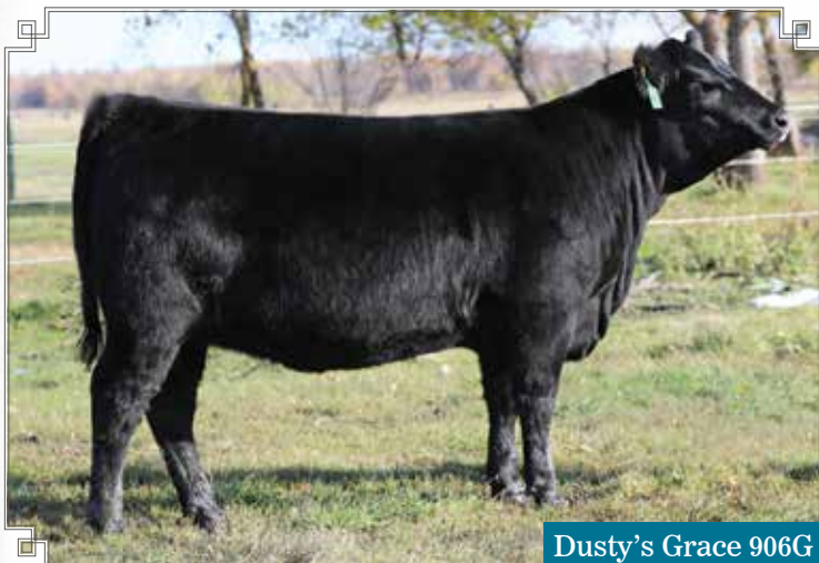
Dusty's Grace 906G

S A V HARVESTOR 0338 SA V CUTTING EDGE 4857 S A V BLACKCAP MAY 5530 S A V HERITAGE 6295 S A V EMBLYNETTE 7749 B C C BUSHWACKER 41-93 S A V MAY 7238 HOOVER DAM P F QUEEN MOTHER 446 YOUNG DALE GRACE 169B YOUNG DALE GRACE 107W YOUNG DALE PANARAMA 66T YOUNG DALE GRACE 14P