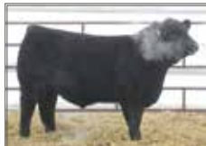
Young Dale Draisaatl 108D Sire