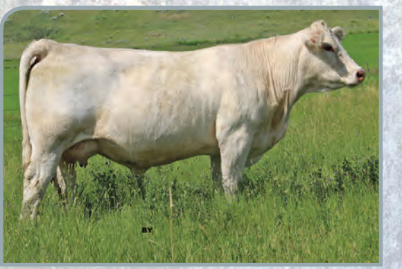
KLR 121C - Encore X 70X