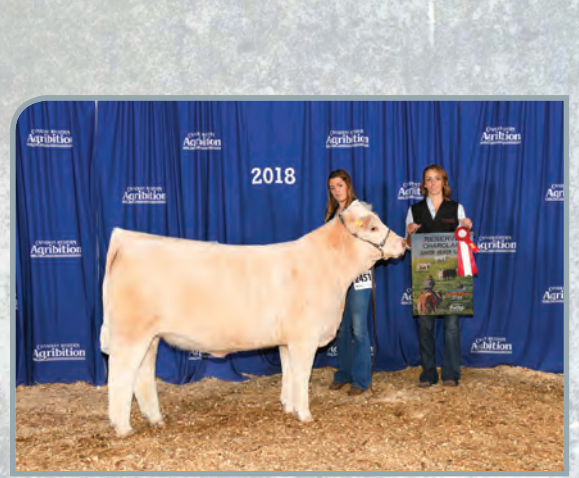
LAE 891F - 2018 CWA Reserve Junior Heifer Calf Champion