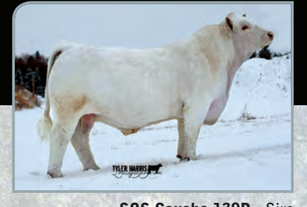
SOS Gaucho 139D - Sire