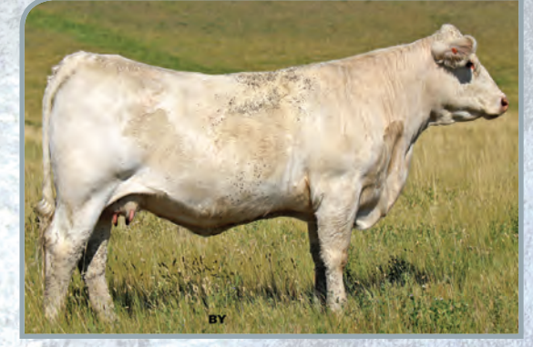
KLR 125D - Mother of high selling bull - Elder's Vexour 8042F