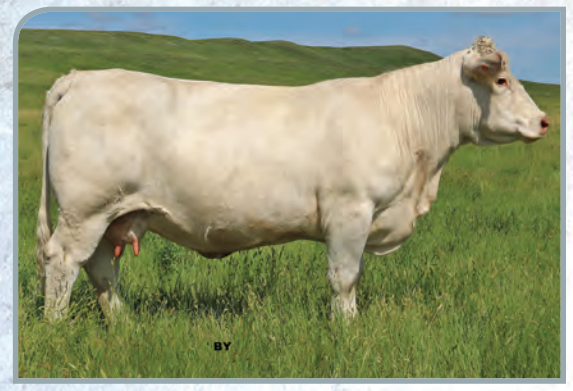
KLR 80C - Dam of $30,000 Blackjack son