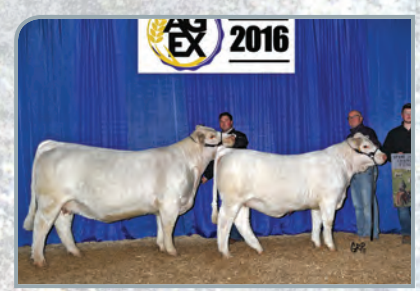
SOS Hot Mess 50B - Dam