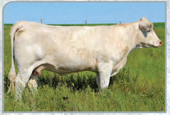
KLR 70X - Dam of KLR 125D

The buyer is guaranteed six (6) embryos, with the option to buy any/all embryos over the six (6) at the same price per embryo as this sale price. Any unpurchased embryos will be the property of Elder Charolais Farm.