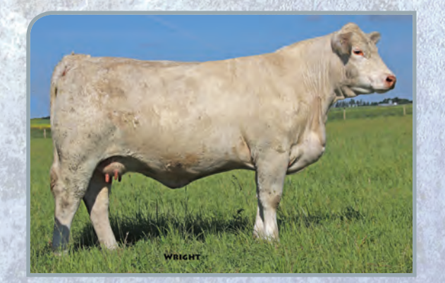
KLR 71E - Blackjack X Kaboom