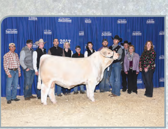
SVY Fortress 703E - Sire