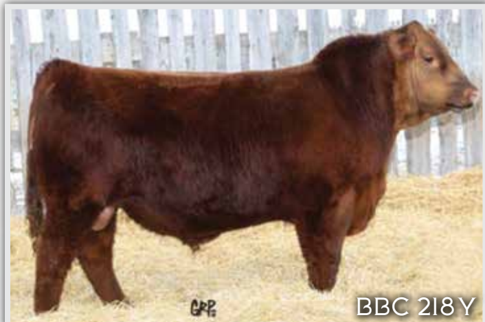
as a yearling