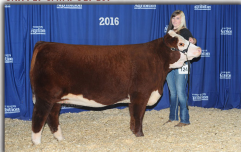
BLAIR-ATHOL TW DEBBIE DOO 22C