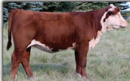
RSK 4Z Miss Magnolia 8C Sold in the 2015 Elite Genetics Production Sale to Faith MacDonald Out of the Magnolia cow family