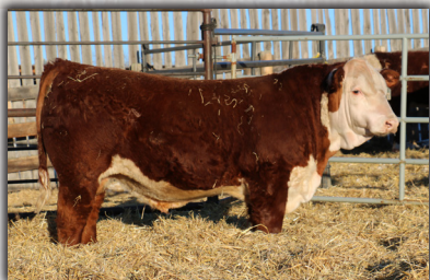
HARVIE STREAMLINE ET 200D - SERVICE SIRE SOLD FOR $20,000 TO KT RANCH