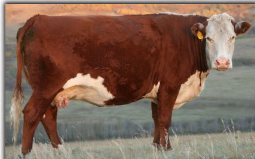
MJT 9N HARMONY 117R