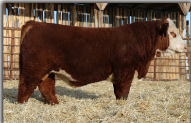
HARVIE E SACKETT ET 201E - MATERNAL BROTHER SOLD FOR $17,000 TO KROGSTAD POLLED HEREFORDS