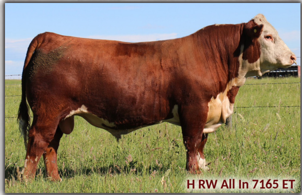
H RW All In 7165 ET