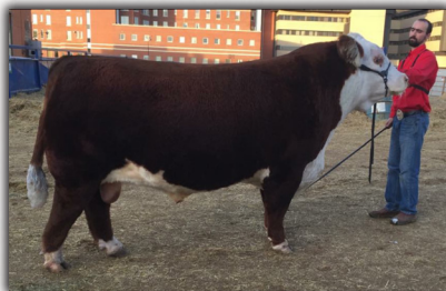
XLP 75Z KELSEY 55B - SIRE

Our top end show heifer that lives up to her name, one that is very exquisite through her front, bold through her rib and has as much depth of rib and flank as any I've seen. Homo polled by pedigree as well!! Glamour is a natural calf out of our 8B donor that consistently gets the job done year after year in producing our top end show calves. Not only is Glamour a female that will compete, she's also a sweetheart to work with and gets along with all types of show people. She was Champion Hereford Heifer Calf at Prince Albert Ex this summer, and recently Hereford breed champion in the calf jackpot at Manitoba Ag Ex. Once you're done showing her, she will go on to be a top end breeding piece.