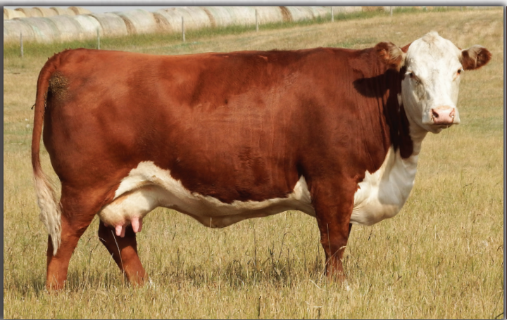
HAROLDSON'S JVJ SARAH 521X 14Z