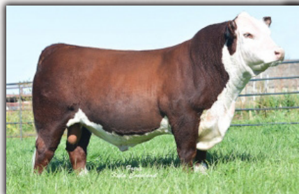
CRR 719 CATAPULT 109 - SIRE

We are very excited to offer what we think to be one of the best up and coming females we have raised to date. This heifer has been a standout since birth! Tru Style is as stout as they come with exceptional length and neck extension, all put together with beautiful balance and eye appeal! Her momma is one of our donor cows that just never seems to miss. Her sire, CRR 719 Catapult 109 needs no introduction and has sired many great ones. Retaining a future flush at our cost and the purchaser's convenience.