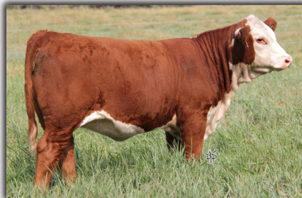
RSK FM 6964 Miss Princess 24F Sold in the 2018 Elite Genetics Production Sale to KCH R Leader out of the Princess Cow Family