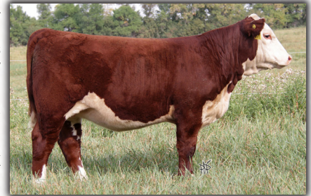
RSK H117 Miss Sage ET 21F Sold in the 2018 Elite Genetics Production Sale to Blairs.Ag - Full Bottle out of the Sage cow family