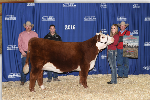
NEXT GEN RIESLING 295 ET - DAM CWA YEARLING CHAMPION FEMALE