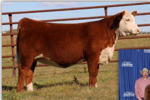
FULL SISTER TO EMPOWER 5F