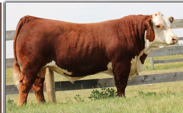
H RW ALL IN 7165 ET

CONSIGNEE BY BLAIR-ATHOL POLLED HEREFORDS