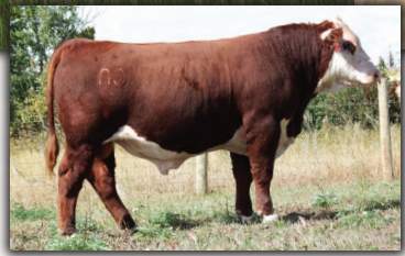
GHC C5 ATTENTION 155E