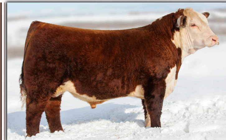
HAROLDSON'S JVJ ROYAL 24E