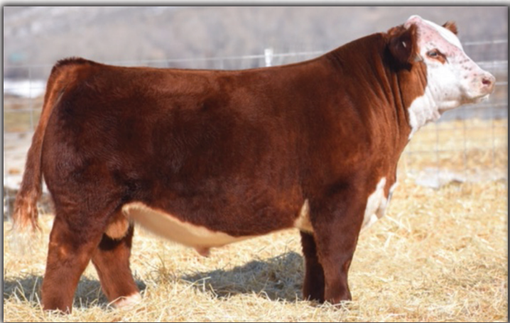
CHURCHILL ROCK 646D ET

CONSIGNED BY CRITTENDEN BROS. POLLED HEREFORDS.