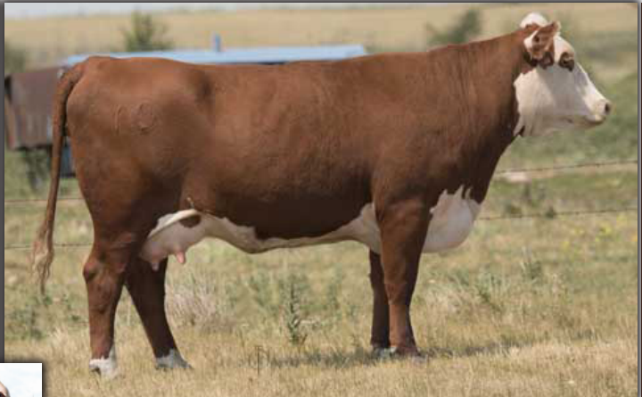
GHC C5 MISS DUCHESS 58C