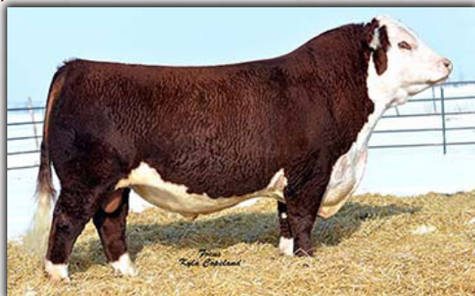
CRR 719 CATAPULT 109