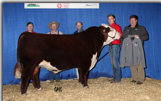
MLL 10Y ROCKY ET 225D