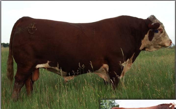
SHF CANNON Z210 C95