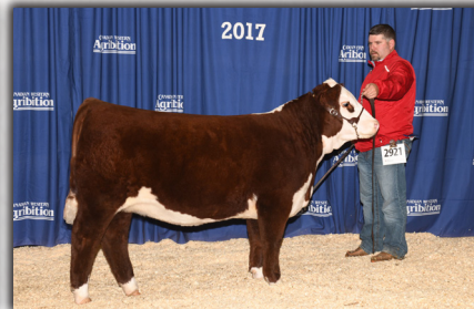
RSK H117 Miss Sage ET 44E Sold in the 2017 Elite Genetics Production Sale to MHPH Full Bottle out of the Sage cow family