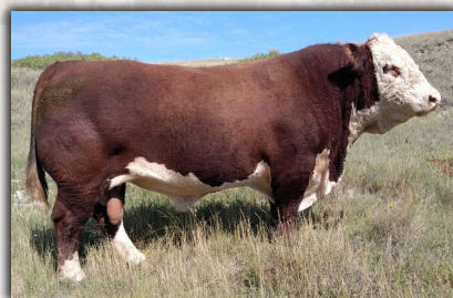
TCF JVJ 11X THE GOODS 305A - SIRE