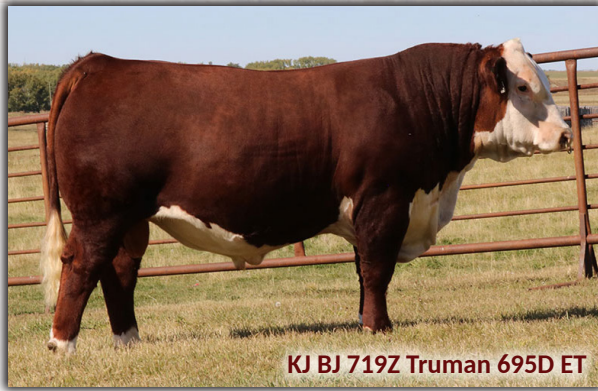
KJ BJ 719Z Truman 695D ET