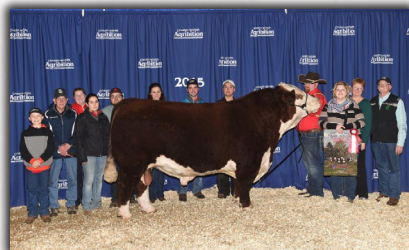
SIRE - RESERVE SENIOR AND RBC SUPREME TOP TEN FINALIST AT CWA'15