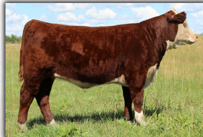
RSK Clay 4Z Miss Tamara 52B Sold in the 2014 Elite Genetics Production Sale to Phantom Creek. 2014 MLE Class Winner, out of the Tamara cow family