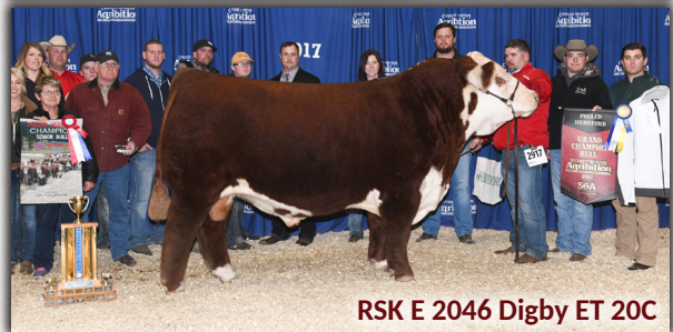
RSK E 2046 Digby ET 20C

RSK Farms is once again set to offer a pick of our entire 2019 heifer calf crop. We have offered many top heifer calves over the years, but the opportunity to come into the herd and pick your favorite before anyone else is truly a jackpot.