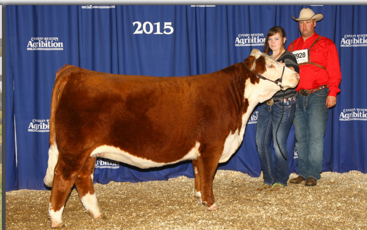
CHARDONNAY 93B - DAUGHTER OF 107W