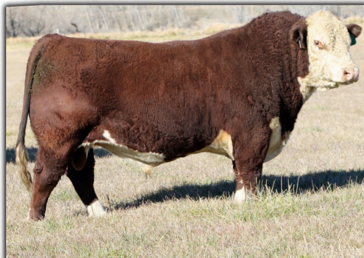
NJW 135U 10Y HOMETOWN 27A