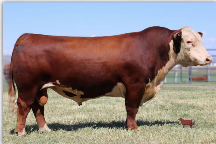
CHURCHILL STUD 3134A - SIRE

CONSIGNED BY MANCHESTER POLLED HEREFORDS