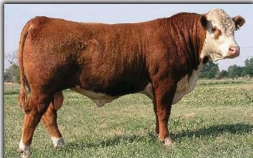
SHF RIB EYE M326 R117