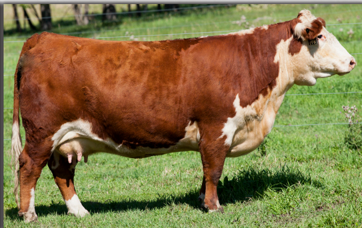
NJW 73S 485T GOLDENROD 62A ET