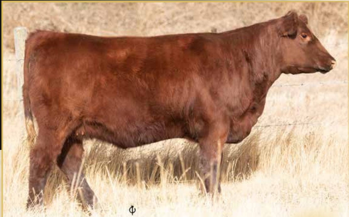
PE to Red SVR Cowboy 33D from May 27-Aug 30. Preg-checked 4 mos on Sept.26