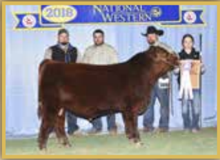
Pat. Sib / SVR Continental 112E

RED TER-RON BIG LEAGUE106X S: RED COCKBURN CONQUER 593C RED COCKBURN DREAM 527X RED SVR KNIGHT 149S D: RED SVR LEAH 117Y RED BH LEAH 26M