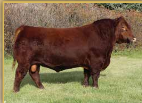
Sire of lots 3 and 4A embryos / Red Pie Specialist 430

bw 0.2 ww 39 yw 67 milk 26 tm 460.43 ce 9 mce 12