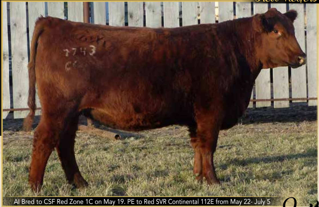
AI Bred to CSF Red Zone 1C on May 19. PE to Red SVR Continental 112E from May 22- July 5

bw 2 ww 40 yw 72 milk 16 tm 36 ce -1 mce 2