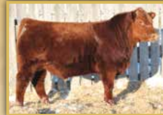
Sire / SVR Bail Out 94B

RED T-K BAILOUT 1Z S: RED SVR BAIL OUT 94B RED SVR RUBY 144X RED CLAY BANDIT 18X D: RED SVR COLLEEN 41B RED SVR COLLEEN 174Y