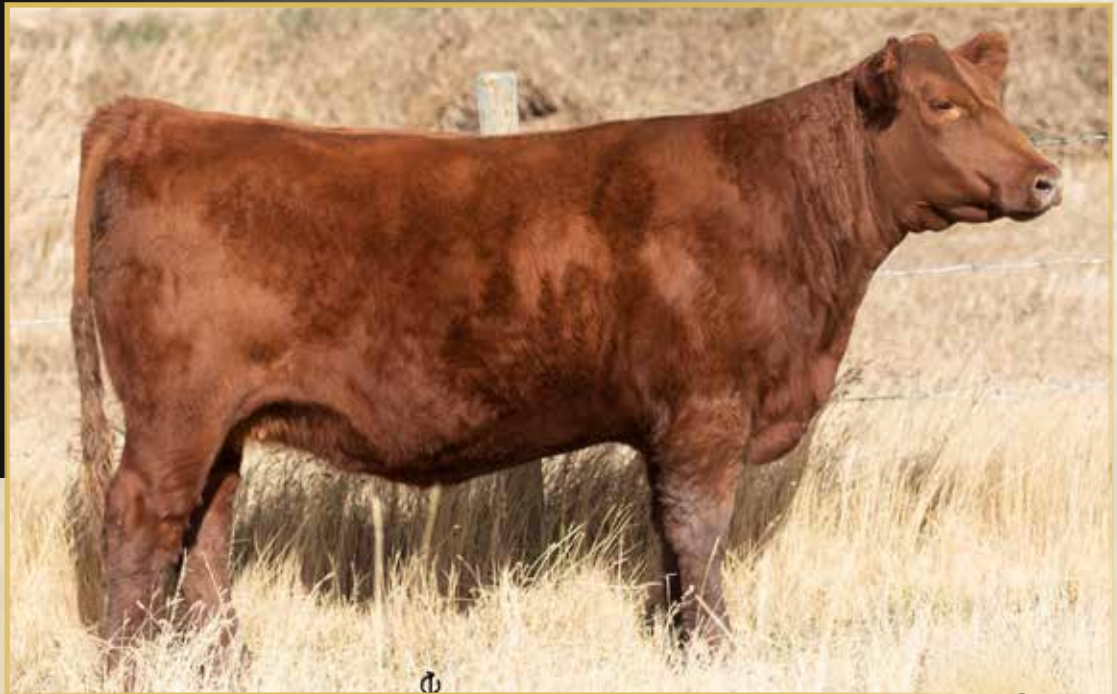
PE to Red SVR Casino 204E from May 27-Aug 28. Preg-checked 4 mos on Sept.26