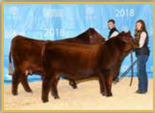
Daughter and Grandson