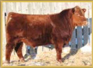
Sire / SVR Bail Out 94B