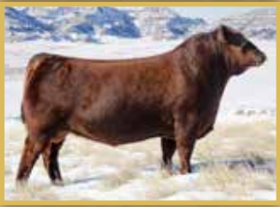
Service Sire / CSF Red Zone

bw 2 ww 40 yw 72 milk 16 tm 36 ce -1 mce 2