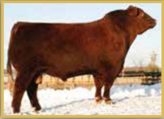
Mat. Grandsire / Gangster 14S

RED T-K BAILOUT 1Z S: RED SVR BAIL OUT 94B RED SVR RUBY 144X