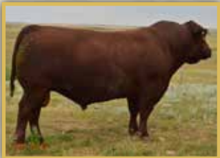
Sire / Red Clay Bandit 18X

Another 63B daughter that is very correct and well balanced. These daughters are proving to be excellent producers with outstanding udders. 23D, a son of 63B was the high selling bull in our 2017 sale that was purchased by Wards Red Angus. This service to Cowboy 33D should be a top-notch mating.