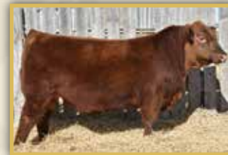
Sire / SVR Swag 106C

RED T-K BAILOUT 1Z S: RED SVR SWAG 106C RED SVR JINNY 123T RED SVR KNIGHT 73P D: RED SVR JINNY 93S RED SVR JINNY 49M