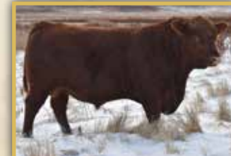
Service Sire / Cowboy 33d

RED CLAY BANDIT 18X S: RED SVR HITCH 78C RED SVR RUBY 144X RED GEIS HI HO 180'04 D: RED SVR CHRISTY 74U RED SVR CHRISTY 35P