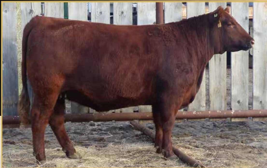
AI Bred to Red Rust Redeem 201C on May 1. PE to T-K Revolution 59D from May 22- July 5

bw 2.6 ww 38 yw 58 milk 17 tm 36 ce 3 mce 8