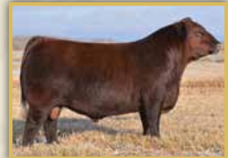
Grandsire / Signature 295B

bw 1.9 ww 38 yw 65 milk 20 tm 39 ce 2.3 mce 6