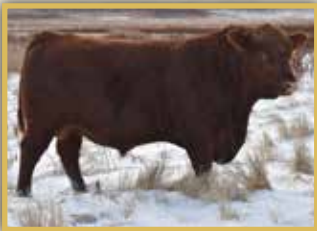
Service Sire / Cowboy 33d

RED XO CROWFOOT 817U S: RED CROWFOOT 187X CROWFOOT LADY ERICA 5728R RED SVR NO EQUAL 34R D: RED SVR CHRISTY 272X RED SVR CHRISTY 230S