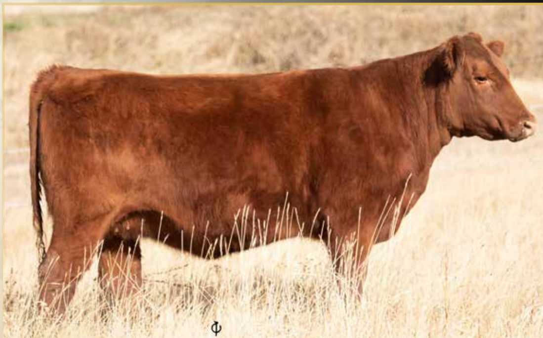
PE to Red Flying K Arrow 13E from May 27-Aug 10. Preg-checked 4 mos on Sept.26

46E is an absolute tank; a powerful, soft made heifer with a tonne of potential to be a top producer and make a positive impact on any herd. We are very excited about this powerful mating to Flying K Arrow. This service sire brings outcross genetics to the Red Angus breed. Help yourselves here, you don't get the opportunity to buy a bred heifer like this everyday.