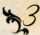
3 or 5 EMBRYOS: Red Cockburn Cora 133Y X Red Pie Specialist 430