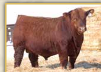
Service Sire / Coming in Hot 24E

RED LSF SAGA 1040Y S: RED PIE SPECIALIST 430 RED PIE PLAYMATE 232 RED BAR-E-L RIBEYE 103R D: RED COCKBURN CORA 132Y RED WILBAR CORA 443P