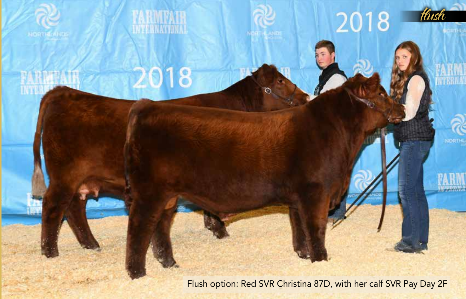
Flush option: Red SVR Christina 87D, with her calf SVR Pay Day 2F