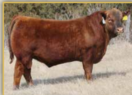
Sire of lot 3 & 4B embryos / Seneca