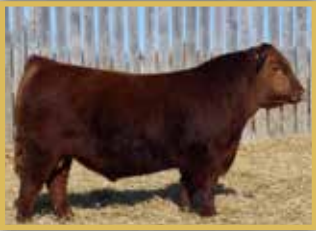
Service Sire / Assassin 624D

The Firefly cow family has long been a favourite around our ranch. 743E has to be admired for her length of spine, depth of body and sound structure. This powerful Specialist daughter also carries the service to Red Zone. The Red Zone Specialist cross has worked extremely well for us. Expect great things from this mating.