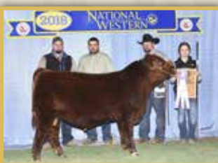
Service Sire / SVR Continental 112E

Here is another member of our cherished Cora cow family; this big time power heifer will be sure to grab your attention on sale day. A maternal sister by Assassin sells as lot 27. The service to Red Zone should be a lights out mating.