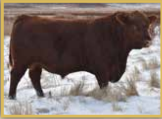
Service Sire / Cowboy 33d

RED CLAY BANDIT 18X S: RED SVR HITCH 78C RED SVR RUBY 144X RED GEIS HI HO 180'04 D: RED SVR FANCY LADY 88X RED SVR FANCY LADY 29P