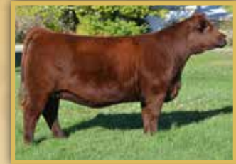
Dam / Cora 312A

RED LSF SAGA 1040Y S: RED PIE SPECIALIST 430 RED PIE PLAYMATE 232 RED SSS BREAK OUT 114Y D: RED COCKBURN CORA 312A RED COCKBURN CORA 135Y