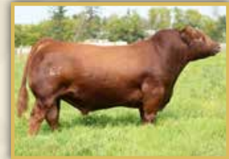
Sire / Heavy Duty 518C

RED SSS BREAK OUT 114Y S: RED COCKBURN HEAVY DUTY 518C RED COCKBURN QUEEN 340U RED FINE LINE MULBERRY 26P D: RED COCKBURN CORA 208Z RED WILBAR CORA 443P OSF