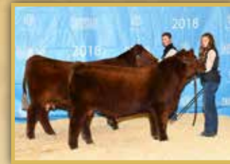
Maternal sib to sire SVR 63B

RED CLAY BANDIT 18X S: RED SVR HITCH 63B RED SVR CHRISTINA 12Y RED SVR KODIAK 213Z D: RED SVR MISS STOCKY 76C RED SVR MISS STOCKY 178Y