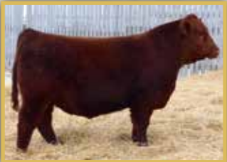
Son / Cockburn Cowboy Up 718E

RED BUF CRK LANCER R017 S: RED BUF CRK THE RIGHT KINDU199 RED BUF CRK SHOSHONE R353 RED PIE CODE RED 9058 D: RED PIE CASCADE 561 RED TPIE CASCADE 561