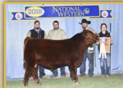
Service Sire / Continental 112E