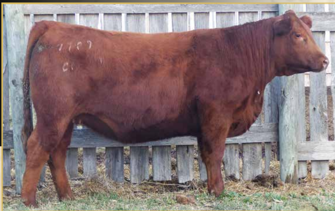
AI Bred to NCJ Coming In Hot 24E on May 1. PE to Red SVR Continental 112E from May 22- July 5

bw 3.1 ww 35 yw 63 milk 14 tm 32 ce -1 mce 3