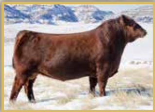
Sire / Red Zone 1C

Cora 8013F is an angular, deep bodied female, and is the first female we will sell off of Assassin. Since being our high selling bull in 2017 Assassin has been in high demand with semen selling up to 300 a straw. His first calf crop here is Impressive and reports from others who have used him are very positive. The dam of 8013 has been a big time producer, also being the dam of lot 14. She is also a flushmate to our Ribeye 308U bull. whether you are looking for a Cora heifer to hang a halter on or become a cornerstone female, 8013 should fit the bill.