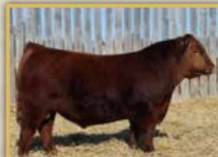
Full Sib to lot 4A embryos