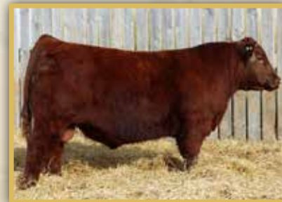
$14,000 Son / Matrix 403B

Only as this is our first female sale are we offering a cow we are very proud of and that exemplifies the kind we strive to raise. Its rare to find a cow with the phenotype, proven pedigree and production that 133Y possesses. Her rib, hip, udder quality and style are hard to rival. 133Y's dam, grandam, and several maternal sisters are all proven donors. The Cora cow family is our largest, highest earning and most prolific cow family. Cora's sire Mulberry is one of the most popular and well known Red Angus bulls of all time. Two sons were high sellers in our 2015 and 2018 bull sales. 133Y's daughters are following in the typical Cora family footsteps and are amongst our very best. Cora successfully flushed in 2017 and averaged 10 eggs per flush. We feel 133Y has much to offer and has only begun to make her mark