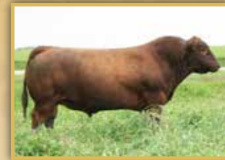
Grandsire / Kargo 215U