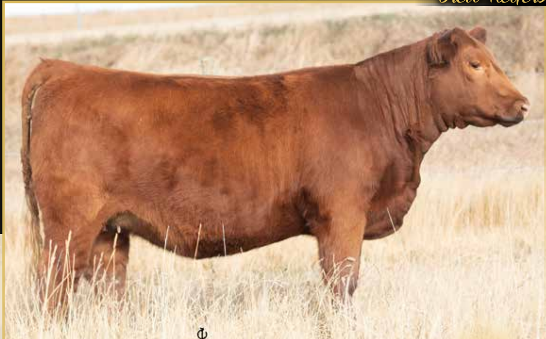
PE to Red SVR Cowboy 33D from May 27-Aug 30. Preg-checked 4 mos on Sept.26