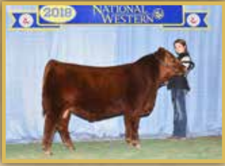
Paternal Sib / SVR Bonus 28E