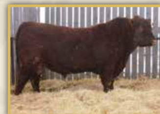
Mat. Grandsire / Geis Hi Ho 180'04