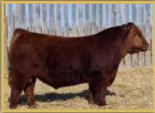
Sire / Assassin 624D

RED PIE SPECIALIST 430 S: RED COCKBURN ASSASSIN 624D RED COCKBURN CORA 254Z RED BAR-E-L RIBEYE 103R D: RED COCKBURN CORA 554X RED WILBAR CORA 443P