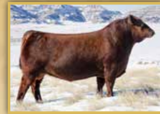
Service Sire / CSF Red Zone 1C

RED TR PRAIRIE FIRE 500W S: RED SVR KODIAK 21Y RED SVR RUBY 100W RED TER-RON REALDEAL 01W D: RED WHEEL AUBURN 2Z RED WHEEL AUBURN 39N