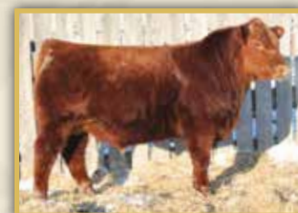
Sire / Bail Out 94B

RED T-K BAILOUT 1Z S: RED SVR BAIL OUT 94B RED SVR RUBY 144X RED SVR KODIAK 21Y D: RED SVR COCA 201B RED SVR COCA 168S