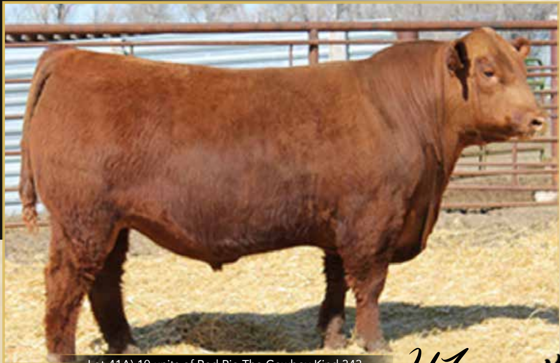
Lot 41A) 10 units of Red Pie The Cowboy Kind 343 Lot 41B) 10 units of Red Pie The Cowboy Kind 343