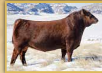
Service Sire / Red Zone 1C

RED BUF CRK THE RIGHT KINDU199 S: RED PIE THE COYBOY KIND 343 RED PIE CASCADE 561 RED T-S PATRIOT 84K D: RED COCKBURN MS HAUCK 28N RED COCKBURN MS HAUCK 27J