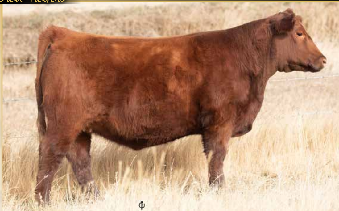
PE to Red Flying K Arrow 13E from May 27-Aug 10. Preg-checked 3 mos on Sept.26