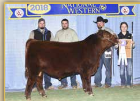
Red SVR Continental 112E