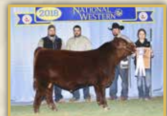
Pat. Sib / SVR Continental 112E

RED TER-RON BIG LEAGUE106X S: RED COCKBURN CONQUER 593C RED COCKBURN DREAM 527X RED GEIS HI HO 180'04 D: RED SVR COCA 88W RED SVR COCA 32L