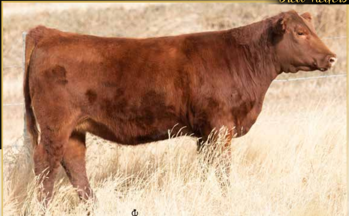
PE to Red SVR Cowboy 33D from May 27-Aug 30. Preg-checked 4 mos on Sept.26