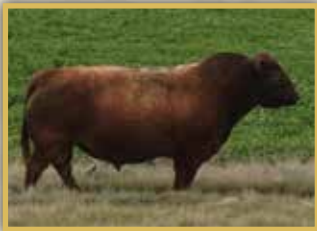
Sire / Crowfoot 187X

133E is a powerful female that has the potential to crank out some herd bulls. Her great grand dam was a productive cow for us, being a CAA Elite dam. Her sire 78C, is a maternal brother to SVR 94B.