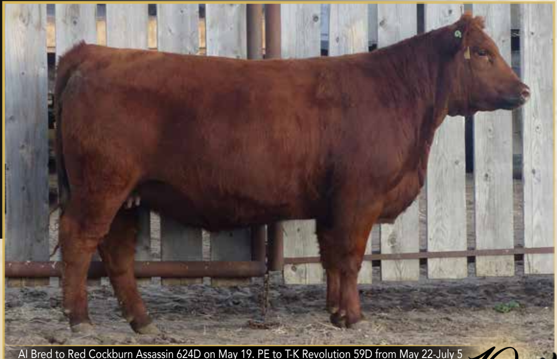
AI Bred to Red Cockburn Assassin 624D on May 19. PE to T-K Revolution 59D from May 22-July 5

bw 2.7 ww 30 yw 48 milk 19 tm 34 ce 1 mce 7