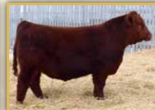
Maternal Sib to lot 4 embryos