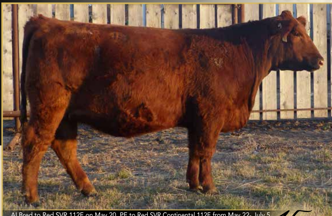
AI Bred to Red SVR 112E on May 20. PE to Red SVR Continental 112E from May 22- July 5

bw 0.1 ww 58 yw 93 milk 18 tm 47 ce 8 mce 10