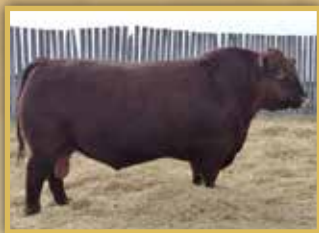
Sire / Break Out 114Y

bw 2.6 ww 38 yw 58 milk 17 tm 36 ce 3 mce 8