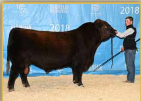
Red Blairswest Enterprise

Here is your opportunity to flush any cow at South View. This will guarantee you 3 #1 embryos and will be split if there are more than 6 embryos. You can flush the cow to a bull of your choice with the option to use any of our SVR bulls, Cowboy Kind 343, No Equal 28H, SVR High Octane 54K, SVR Knight 73P, Flying K Arrow 13E.