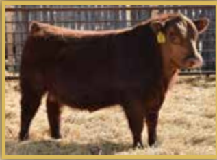
Sire / SVR Hitch 78C