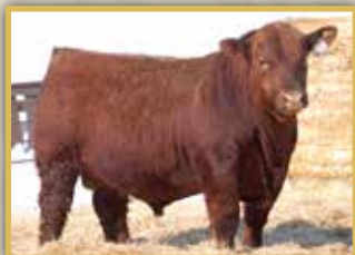
Service Sire / Coming In Hot 24E

Dream is a moderate framed, deep bodied, cherry red Breakout daughter. The Breakout females are proving to be some of the most productive and easy keeping in our herd. Dream is carrying the service of Red Rust Redeem 201C, an exciting calving ease sire from Semex.