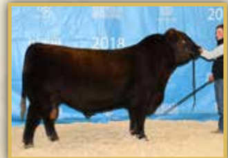
Sire / Champion 2 yr. old Bull at Farmfair 2018

RED SIX MILE SIGNATURE 295B S: RED BLAIRSWEST ENTERPRISE 33D RED BLAIRS SUGRLAND 5X RED T-K BAILOUT 1Z D: RED SVR COCA 59D RED SVR COCA 140A