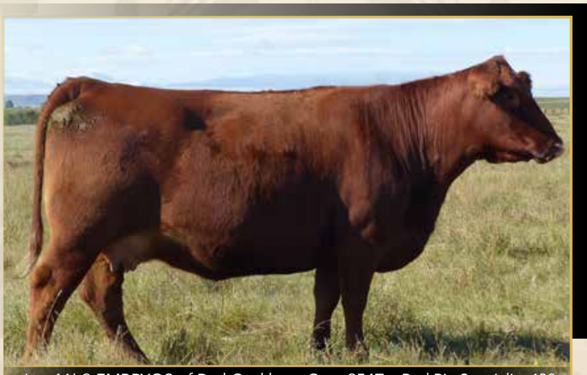
Lot 4A) 3 EMBRYOS of Red Cockburn Cora 254Z x Red Pie Specialist 430 Lot 4b) 3 EMBRYOS of Red Cockburn Cora 254Z x RREDS Seneca 731C

This is a mating we are very excited about and only because of a very successful flush are we able to offer some of these genetics for sale. Specialist has bred extremely well for us, moderating birth but not sacrificing on performance, muscle and growth. His sons have been our high selling sire group the past two years and include the $77,500 Red Cockburn Assassin to Brylor Ranch, the specialist daughters have risen to the top of our replacement pen.