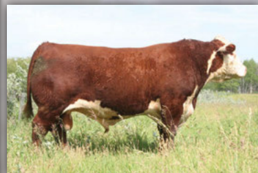
Square D Century 957B