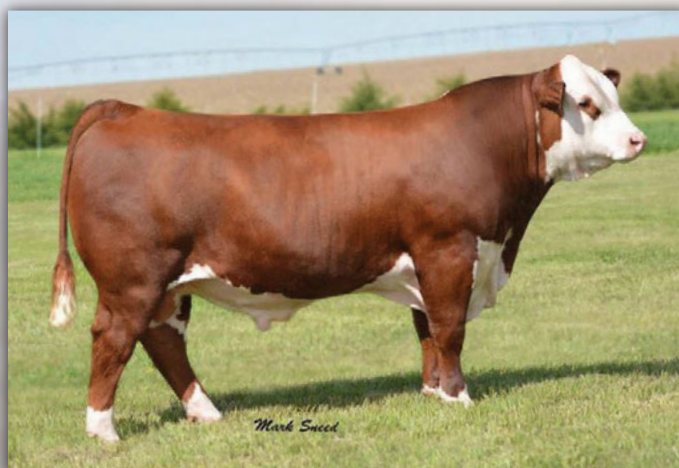
R Leader 6964