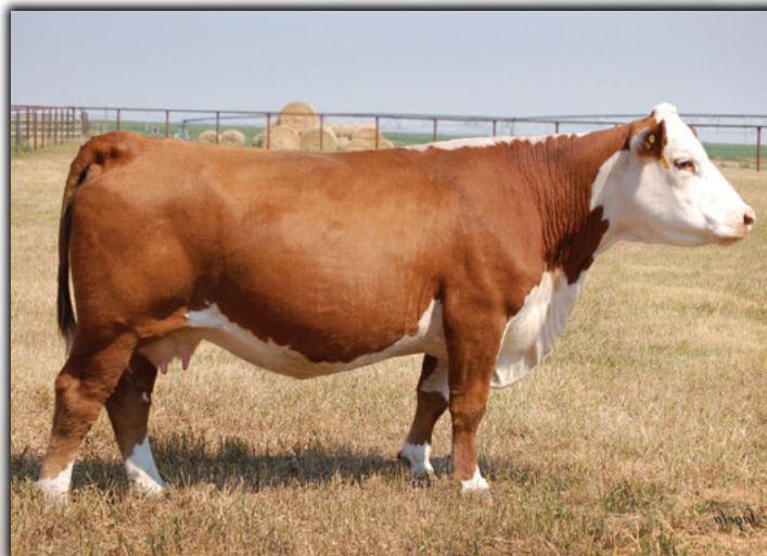
Blair's Xkeona 521X 1A