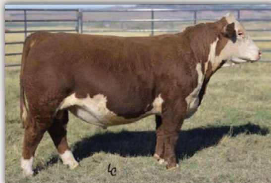
Pyramid Hickok 4130