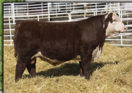
NJW 73S 485T Goldenrod 62A ET