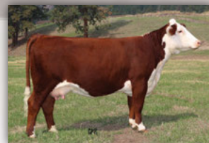
ANL R 1076 Lady Redeem 25A