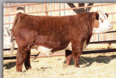
Harvie Boardwalk ET 212C

108 HARVIE MS Medonte 32E PC03032480 CVIH 32E January 12, 2017 Polled Female