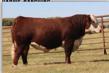
KJ BJ 719Z Truman 695D