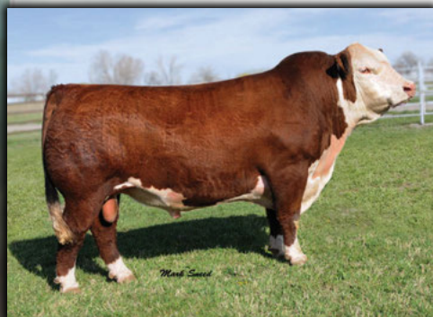
TH 122 71I Victor 719T