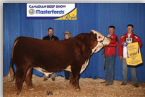
MHPH 521X Action 106A