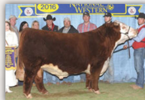
TFR KU Roll The Dice 1326