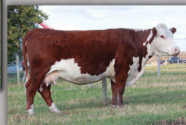
MHPH 118U Catriona 1071Z

CONSIGNEE BY BLAIR-ATHOL POLLED HEREFORDS