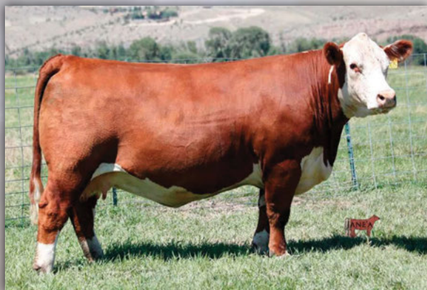
SC CCC Ladysport 2205 Z ET