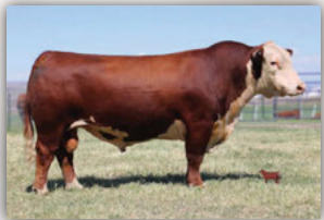
Churchill Stud 3134A