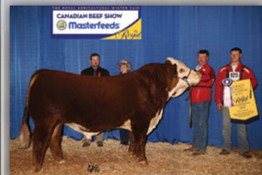
MHPH 521X Action 106A

CONSIGNED BY MANCHESTER POLLED HEREFORDS