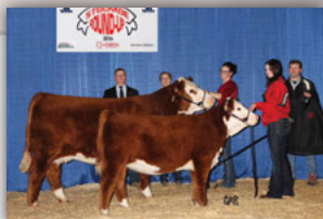
Dam and 651D at side 2016