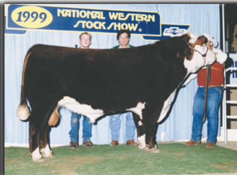
CS Boomer 29F