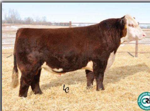
TH 71U 719Y Mr. Hereford 11X