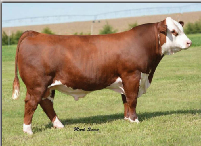
R Leader 6964