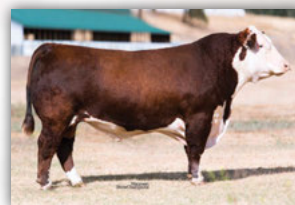
CCR 719T Carl 21C - Maternal Brother

CCR 70E is sired by Roll The Dice, whose progeny are topping sale rings and show rings alike. This will likely be the only Roll The Dice female to go through a sale ring in Canada this year. Lady Luck 70E is moderate framed but is a powerhouse in her overall mass and dimension. She is long sided, big ribbed and super fronted with a great look to her. Her dam is a perfect-uddered, super fronted female that we purchased from ANL as a calf. She is also the dam of our go-to heifer bull - CCR 719T Carl 21C. 70E should be a highly competitive show heifer down the road and being backed by such maternal power, she holds tremendous brood cow potential.