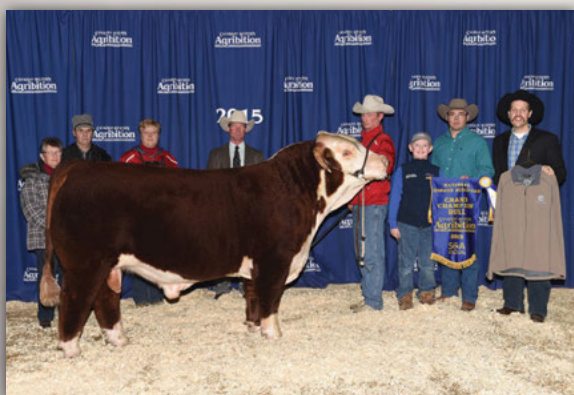
Triple-A 2059 Bam Bam 11B

Here is a real opportunity to own a female right from the top of a highly renowned outfit that very seldom offers a female for sale. Triple-A Summertime is a high quality female from the top of our heifer pen. She combines many attributes to make her a great show heifer, while still making a superior cow. Tons of rib with more dimension and thickness over her top with a huge hind quarter. She is very sound and moves extremely well with the nice extension through her front end. Her sire, the one and only Bam Bam needs no introduction. He was the 2015 and 2016 CWA Champion Bull and two times RBC Top 10 qualifier consecutively. His progeny all carry that same extra thickness and overall look we all try to achieve. Summertime's mother, 13W, is a top cow that we flushed this past spring and retrieved 22 #1 embryos that are full siblings to Summertime. We pride ourselves on producing top quality females that go out and work. Summertime is one of a kind.