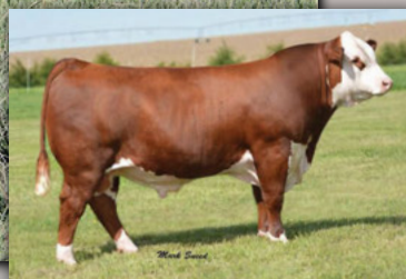
R Leader 9646