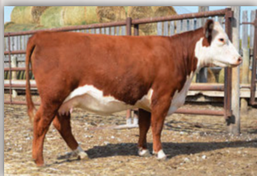
WCC 180A Spirit Queen 5007C