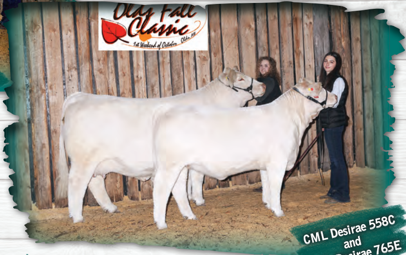
CML Desirae 558C and CML Desirae 765E