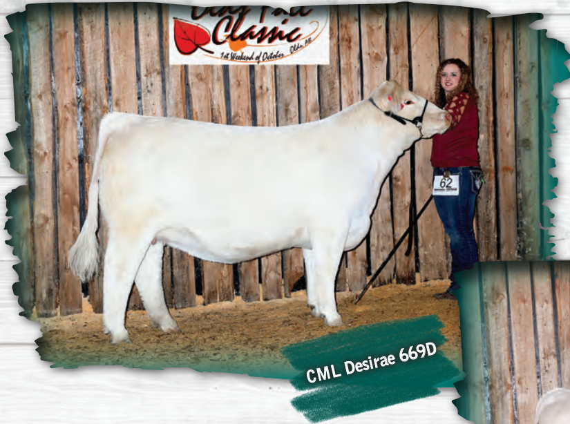
CML Desirae 669D