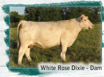
White Rose Dixie - Dam