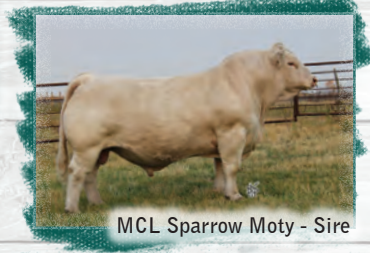
MCL Sparrow Moty - Sire