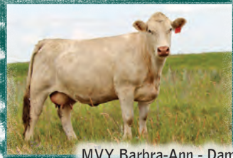
MVY Barbra-Ann - Dam