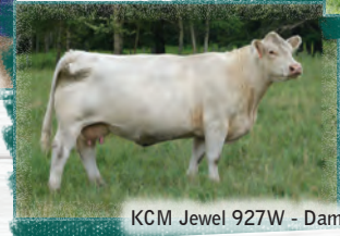
KCM Jewel 927W - Dam