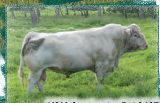
KCM Spectacular Bid 240Z