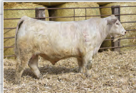
LOT 222 WCR COMMISSIONER 593P

3 Straws: Donated by Prairie Cove Charolais