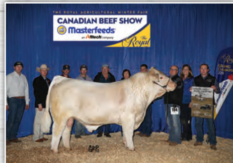
LOT 220 SOS CHUCK WAGON 54C

3 Straws: Donated by McKeary Charolais Springside Farms, Big Johnson Charolais and Medonte Charolais