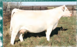
SVY Starstruck - Dam