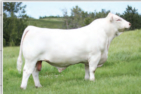
LOT 221 PCC ROME 437B

3 Straws: Donated by Prairie Cove Charolais