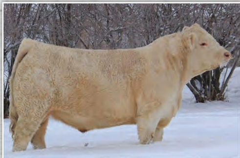
LOT 219 HRJ CROWD FAVOURITE 515C

The Semen Auction is a fundraiser run by the Canadian Charolais Youth Association (CCYA), where semen from top bulls in the breed is generously donated from various breeders across the country. All funds directly support the youth. The semen donated is auctioned off at one of the fall sales, and all proceeds go towards programs of the National Board. Particularly, leadership scholarships are presented at the conference and show from funds raised through the Semen Auction, recognizing senior members on their contribution to the Charolais breed and their leadership among other Charolais youth members. The CCYA National Board would like to thank everyone who has donated and supported in the past for making our programs and scholarship opportunities possible for our youth.