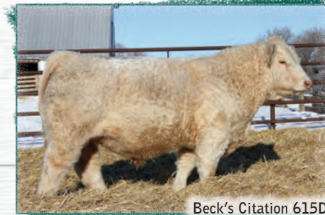
Beck's Citation 615D

Selection to be made before Beck Farms and McCoy Cattle Co. Annual Bull Sale February 28, 2018.