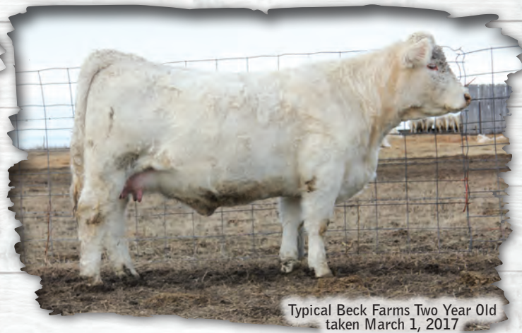
Typical Beck Farms Two Year Old taken March 1, 2017