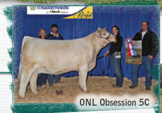
ONL Obsession 5C